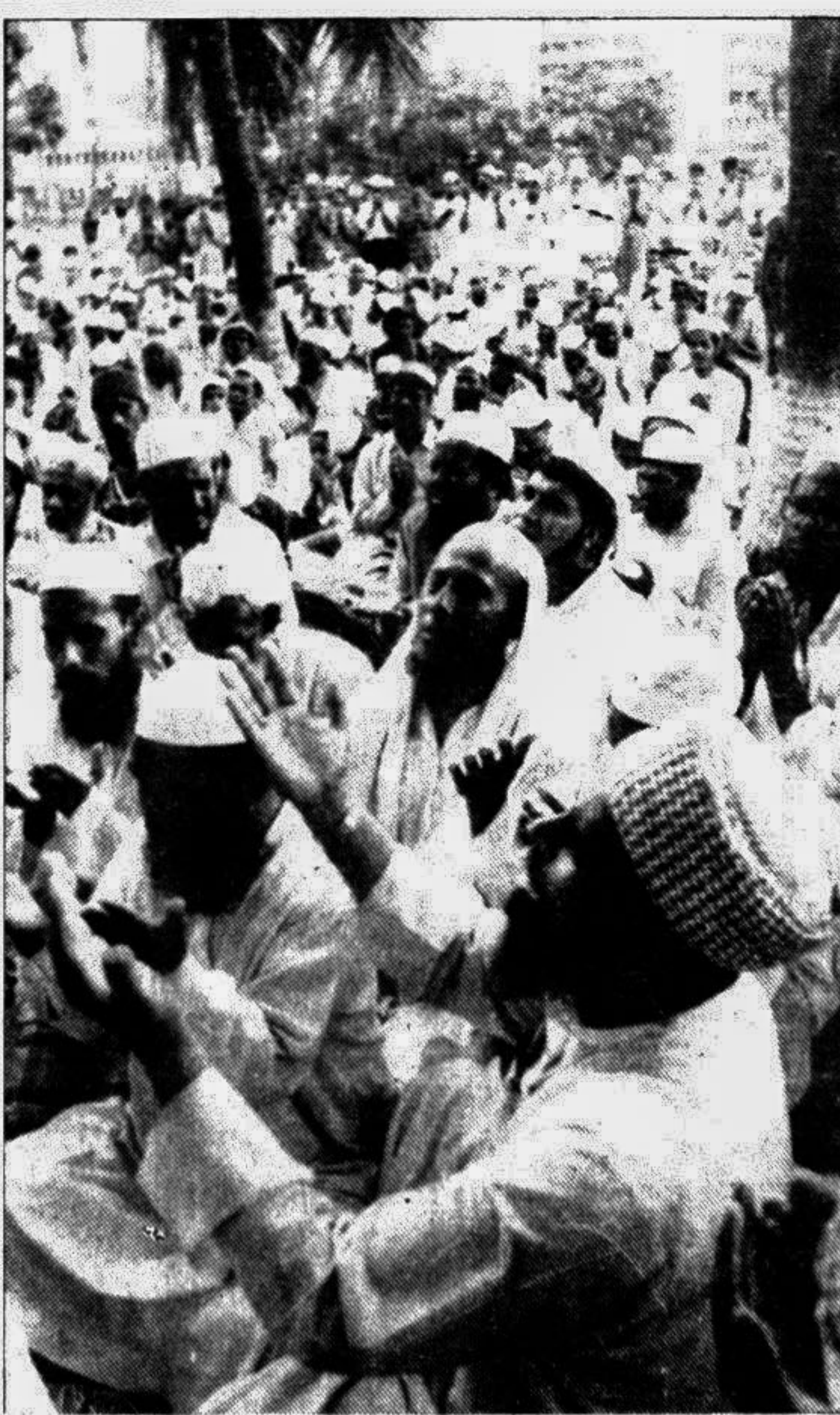
Special prayers were offered at Paltan Maidan in the city yesterday seeking divine blessings to get rid of the devastating flood.