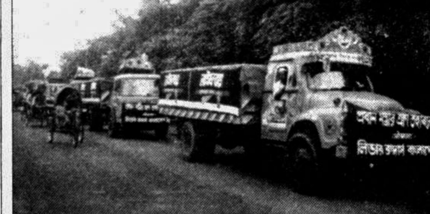
Lever Brothers Bangladesh Ltd has donated 50 tonnes of soap worth Tk 10 lakh to the Prime Minister's Relief Fund for flood victims.