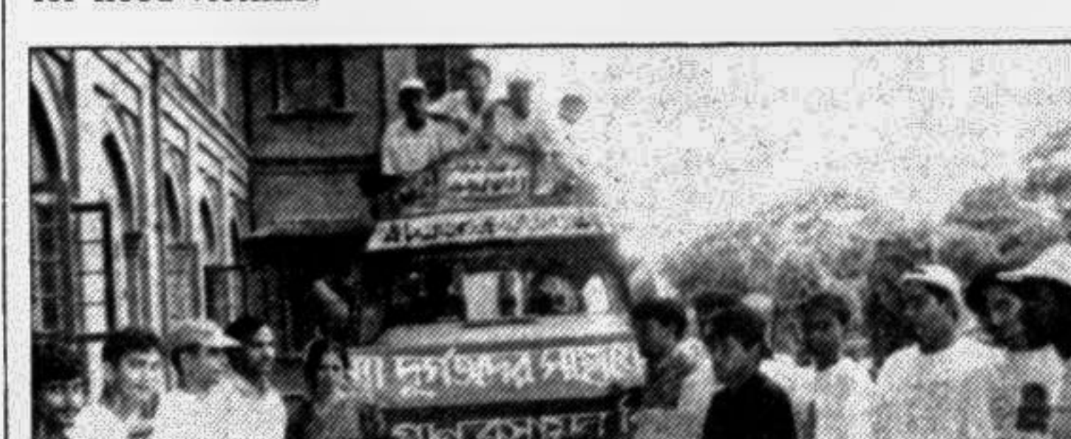
Students and teachers of the Biochemistry Department of Dhaka University distributed relief for the flood-victims in Narsingdi district yesterday.