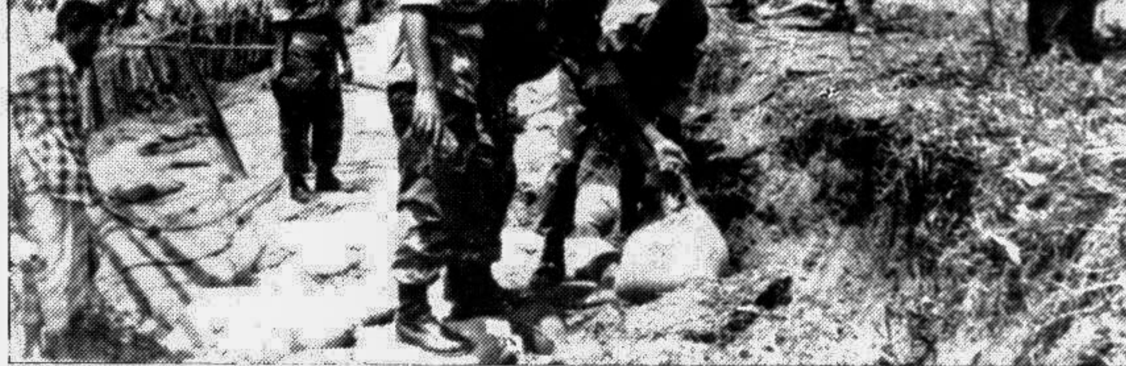
Army personnel making their utmost efforts to save the DND dam from erosion by placing sandbags at Chashara, Narayanganj yesterday.

Deputy Police Commissioner (Sadar) for Police Commissioner Rajshahi Metropolitan Police, Rajshahi Phone No-775649 (office)