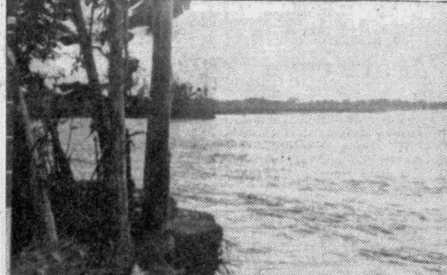
RANGPUR: The river Teesta has been devouring Ganga-chhara area very fast during the ongoing flood.