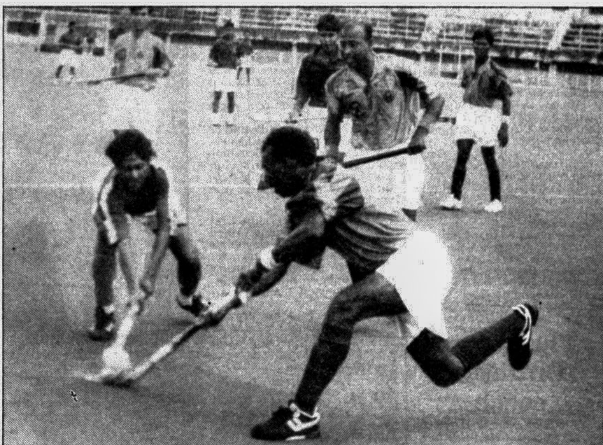
Action from yesterday's First Division hockey league match between Sonali Bank and Dhaka Ansars at the Moulana Bhasani Stadium.

State Minister for Youth and Sports Obaidul Quader inaugurated the tournament as chief guest while BFF general secretary Harun-ur Rashid MP and other CZKP officials were present on the occasion.