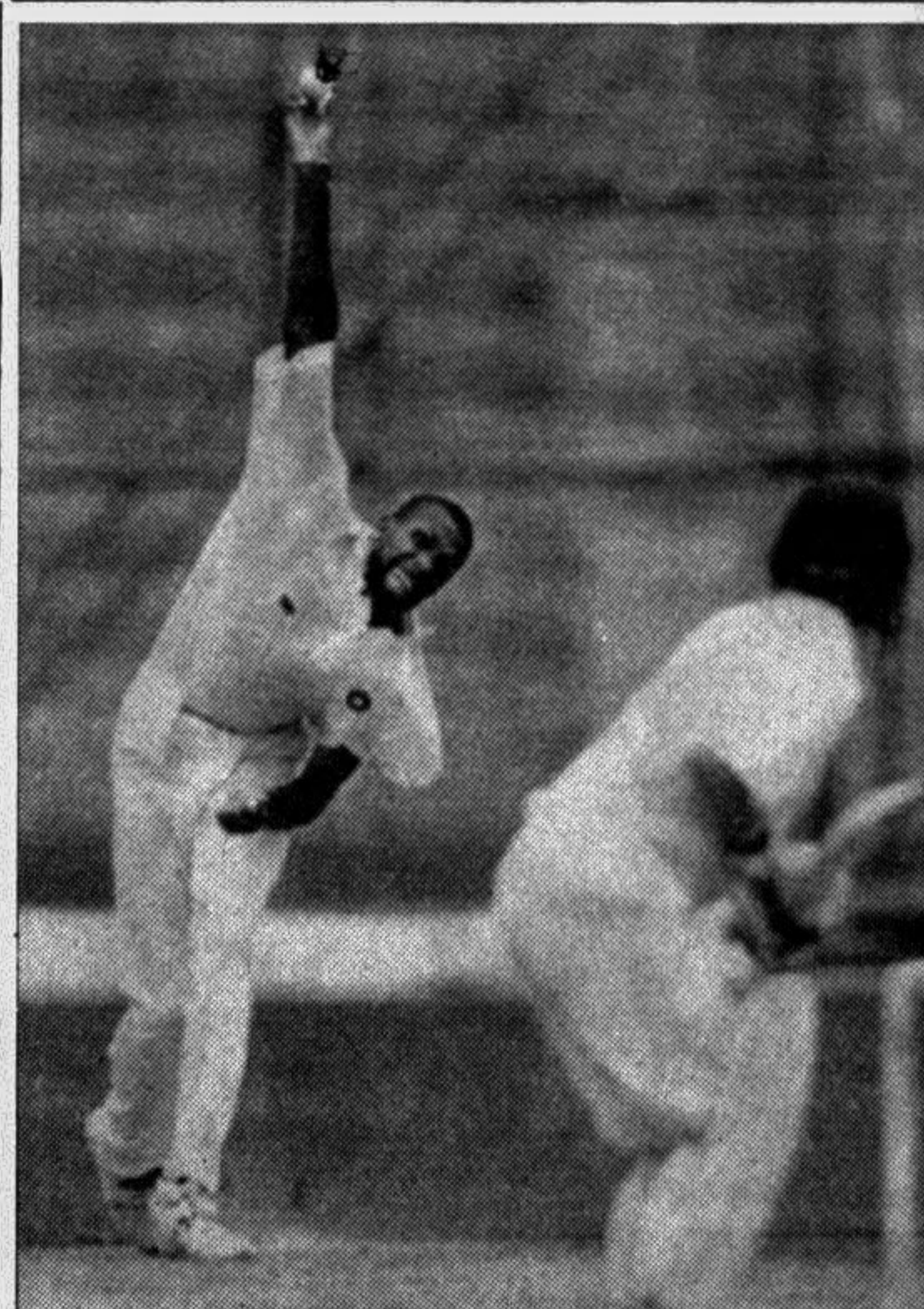
TOWERING INFERNO: Antigua's champion fast bowler Curtly Ambrose bowling against India's star batsman Sachin Tendulkar during a Commonwealth Games cricket competition first round match at Kuala Lumpur yesterday. The match had to be abandoned midway due to rain.

"Muralitharan is one of the best off-spinners in the world and there is no doubt he's a