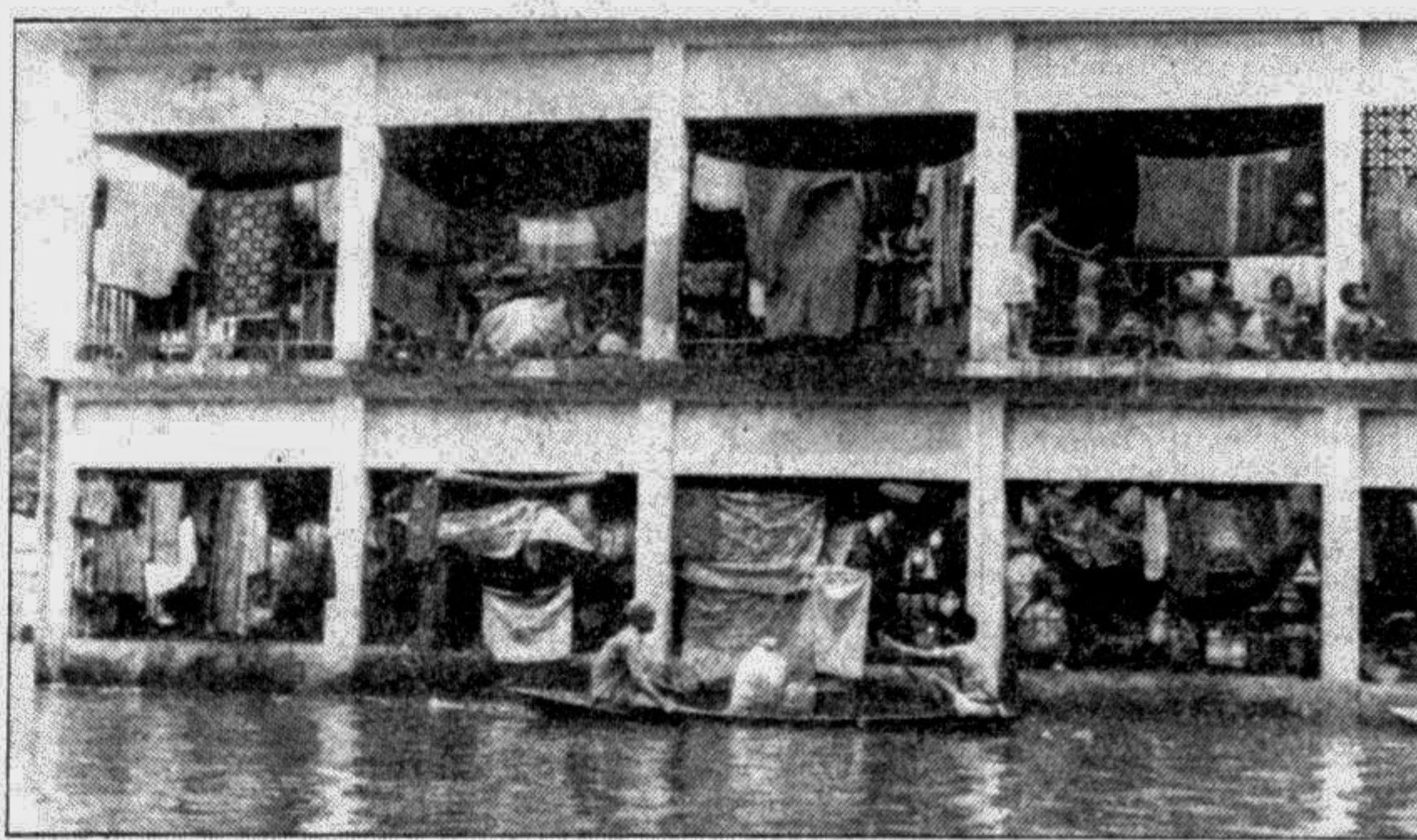
Boat is the only means to move in and out of the flood shelter at Manda in the city.

On the contrary the PM will give, and the world, an example of her deep feeling for our people if she extends her genuine hand of co-operation to all at this stage of our national crisis.