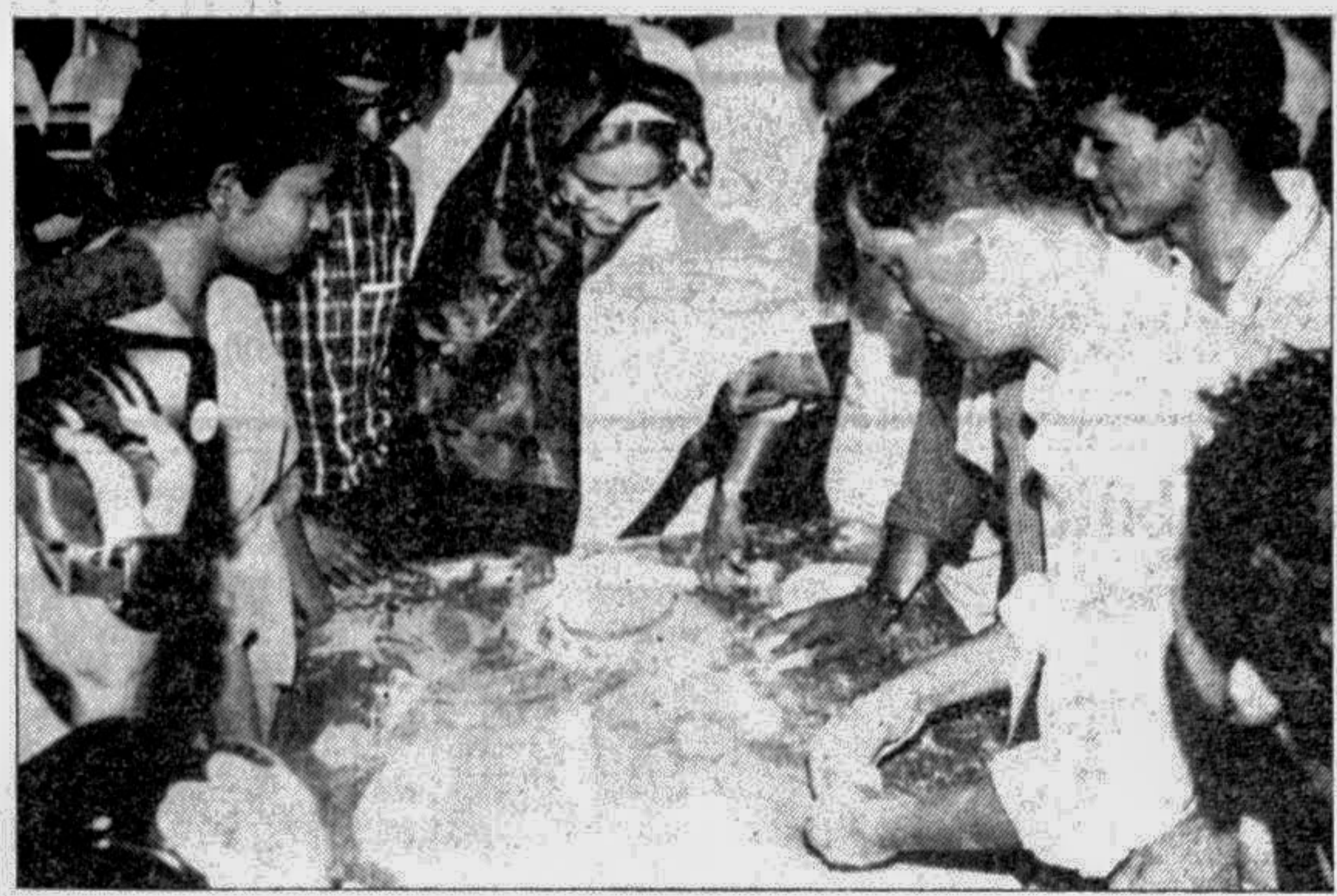
Prime Minister Sheikh Hasina taking part in preparing bread for the flood victims at DUCSU Bhaban when she visited the programme conducted by Bangladesh Chhatra League yesterday.

HATIA, Sept 9: Chief of the Naval Staff Rear Admiral Mohammad Nurul Islam today inaugurated a low-cost housing project build by the BN personnel under the Ashrayan scheme here, reports BSS. The BN personnel in coordination with the local district administration this year completed construction of 13 barrack-type houses, each having accommodation for 10 families with provision of pure drinking water and modern sanitation facilities. Besides, provision of bio-gas plant, pisciculture, farming, bee cultivation and other income generating activities will also be undertaken. In 1997, the BN personnel constructed 28 such barracks including 5 at St Martin's Island, 15 at Moheshkhali and eight at Kutubdia. Speaking on the occasion, the Navy chief called upon the BN personnel to expedite the ongoing relief and medical assistance programme of Bangladesh Navy for the flood affected people in addition to the humanitarian services being provided to the landless and homeless people of the off-shore islands.