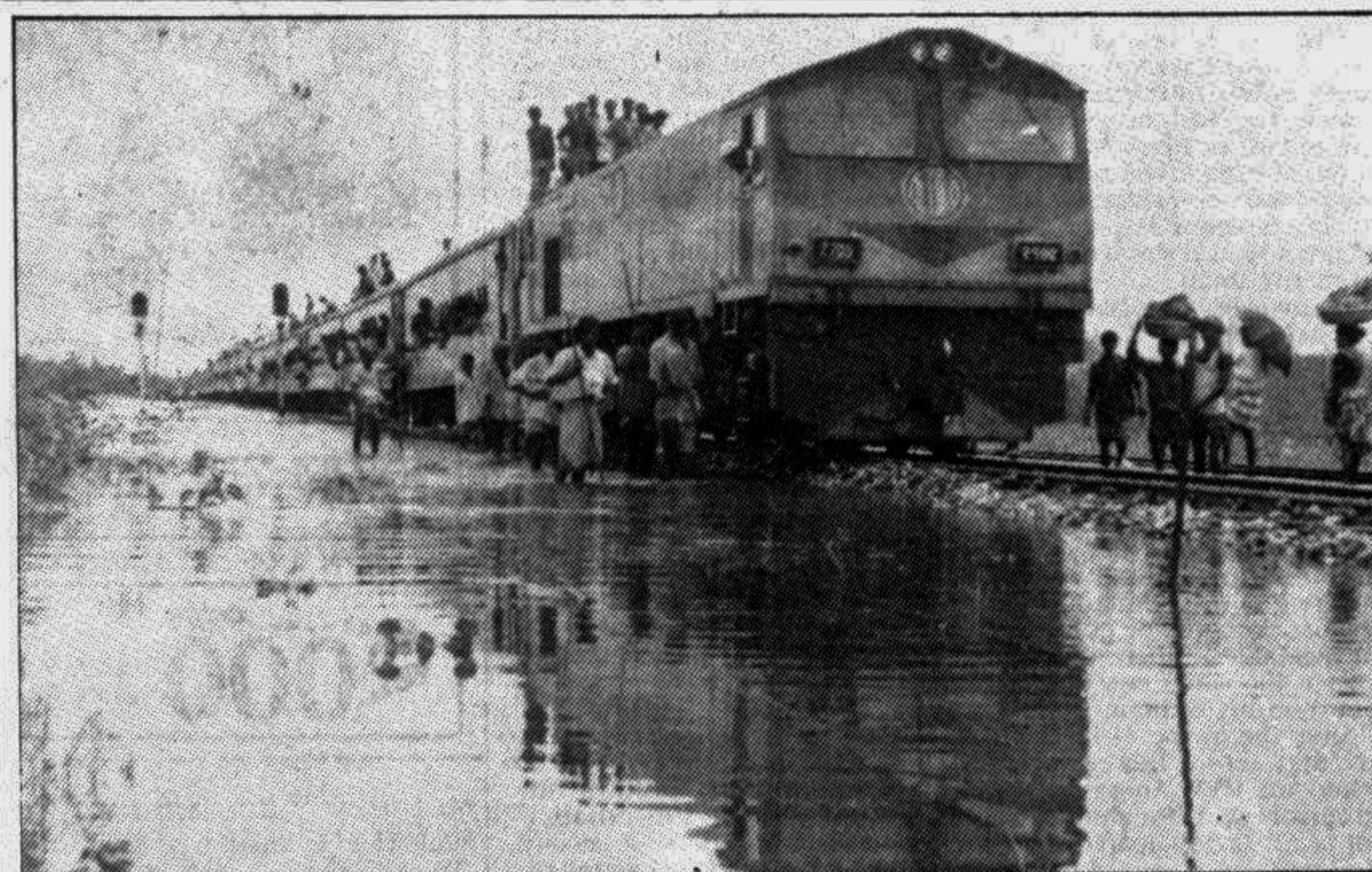
To keep the rail service operative, Railway engineers and workers have raised this rail track near Arikhola station as rail tracks between Arikhola and Pubail went under flood waters.