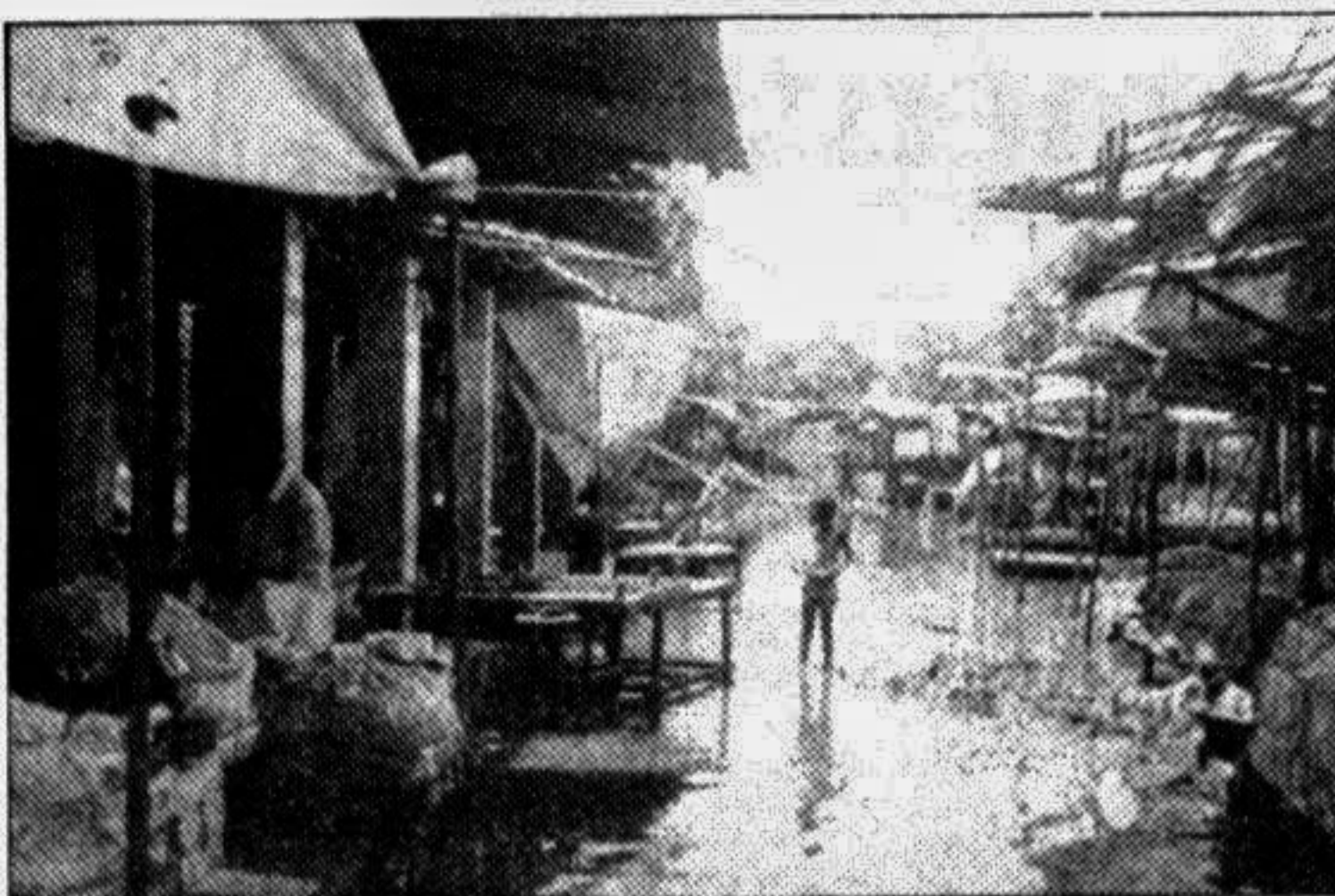
CHANDPUR: Haziganj municipal market has been submerged by flood water.