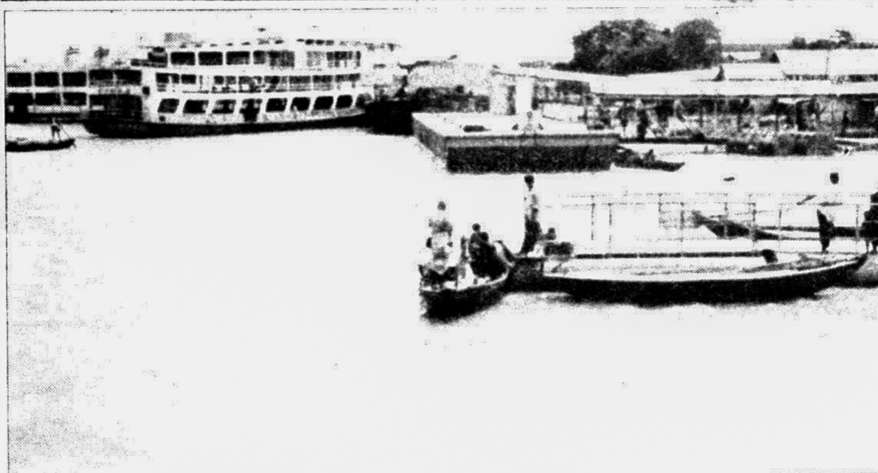
BARISAL: Barisal launch terminal is threatened by erosion of the river Kirtonkhola.

The homeless people, who have taken shelter on the highway and other safer places, are passing their days in great hardship.