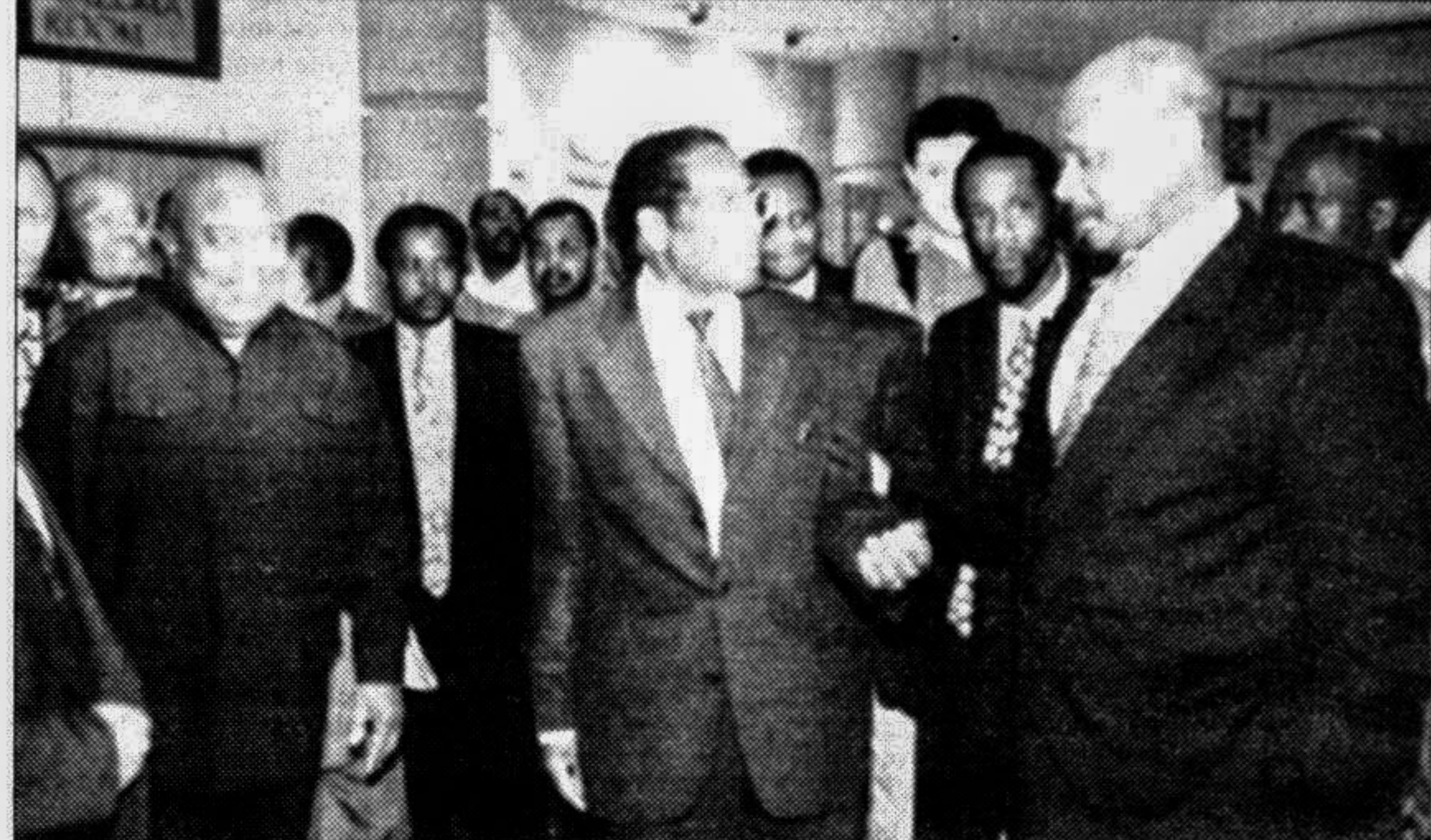
Zimbabwean President Robert Mugabe, centre, turns to his Ugandan counterpart Yoweri Museveni, right, as fellow President of Democratic Republic of Congo Laurent Kabila, left, emerges from the end of the day's peace talks in the Zimbabwean resort town of Victoria Falls, Monday.