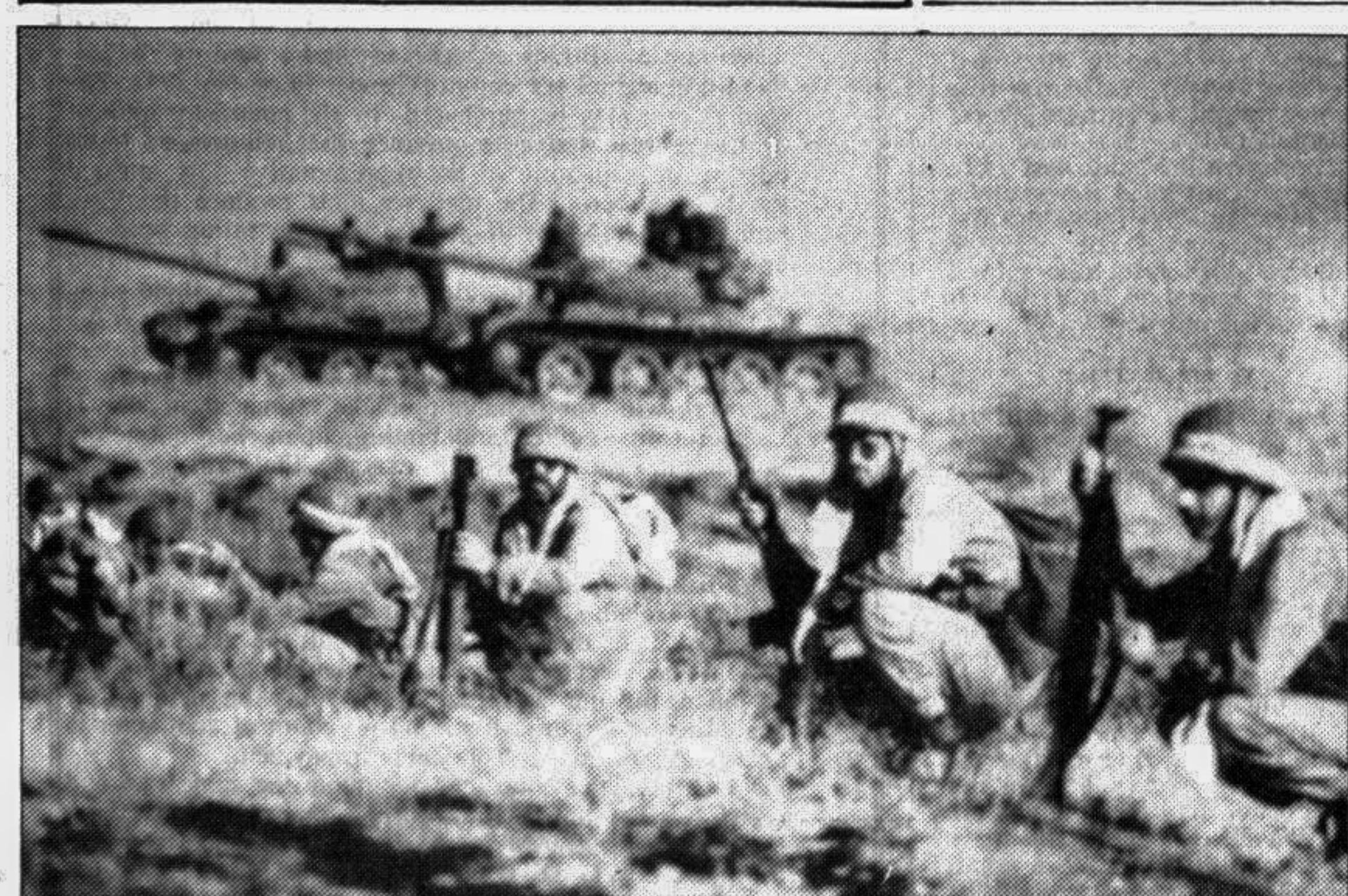
Soldiers of the Iranian elite forces (IRGC) participate in the largest-ever war games near the town of Torbat-e-Jaam, close to the Iran-Afghan border, on Wednesday last.