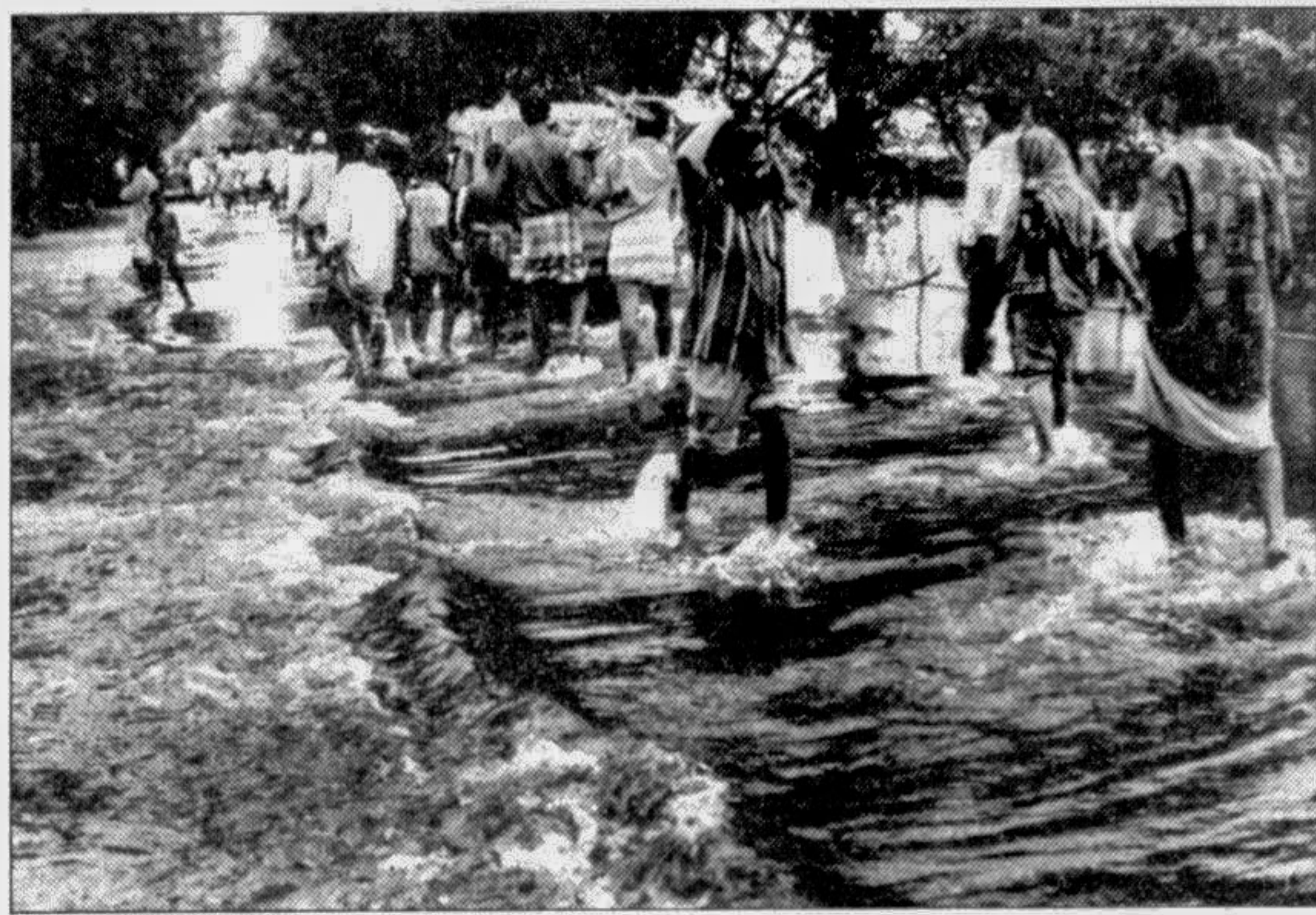
DHAKA-MAWA HIGHWAY HAS ITS GROUND LOST: Braving the gushing waters which stopped normal vehicular traffic on the road, an locomotive has made it. For most people in the surrounding areas, making a living is what matters most now. Their indomitable spirit has probably kept them going.

ADP funds istries to send reprogrammes how additional money could be generated by chopping the low priority projects and refocusing funds to most needed ones.