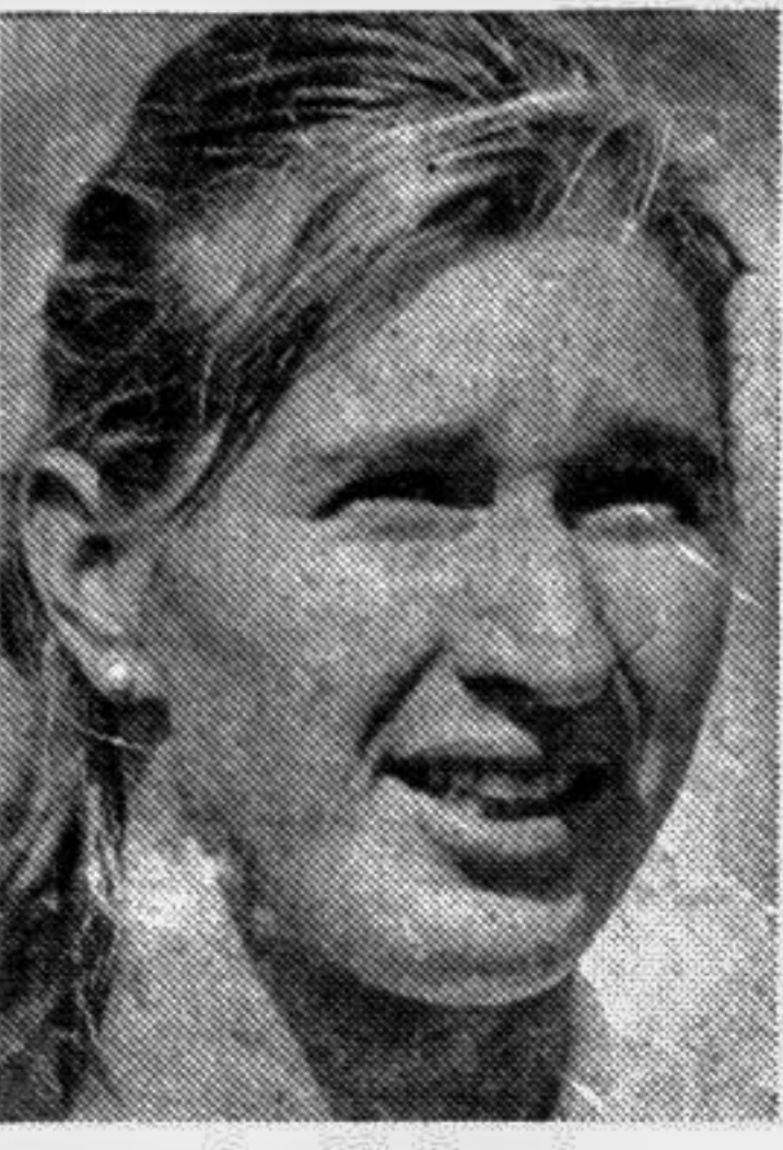
Steffi Graf (German tennis superstar) "I want to do well, no question about that. But there is no number on my mind or a certain amount of titles."

metres in the final straight, Laban Rotich of Kenya was second in 3:33.04. Gebrselassie, meanwhile, looking as if he was out for a stroll in the park, pulled away from the pack with a lap to go, all the time monitoring the stadium's huge electronic screen to check on his progress.