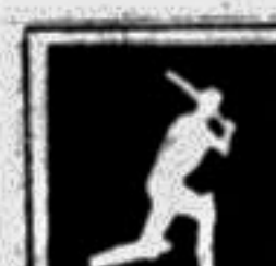
KARACHI, Sept 6 (Hindustan Times/Internet): A copy of the interim report drawn up by the Pakistan Cricket Board (PCB) committee probing match-fixing charges has named Wasim Akram, Salim Malik and Ijaz Ahmed as "the stalwarts of match fixing."

Internet reports said the latter two are players in the squad for the Sahara Cup and Akram is expected to be back as soon as he is finished with his county season in England.