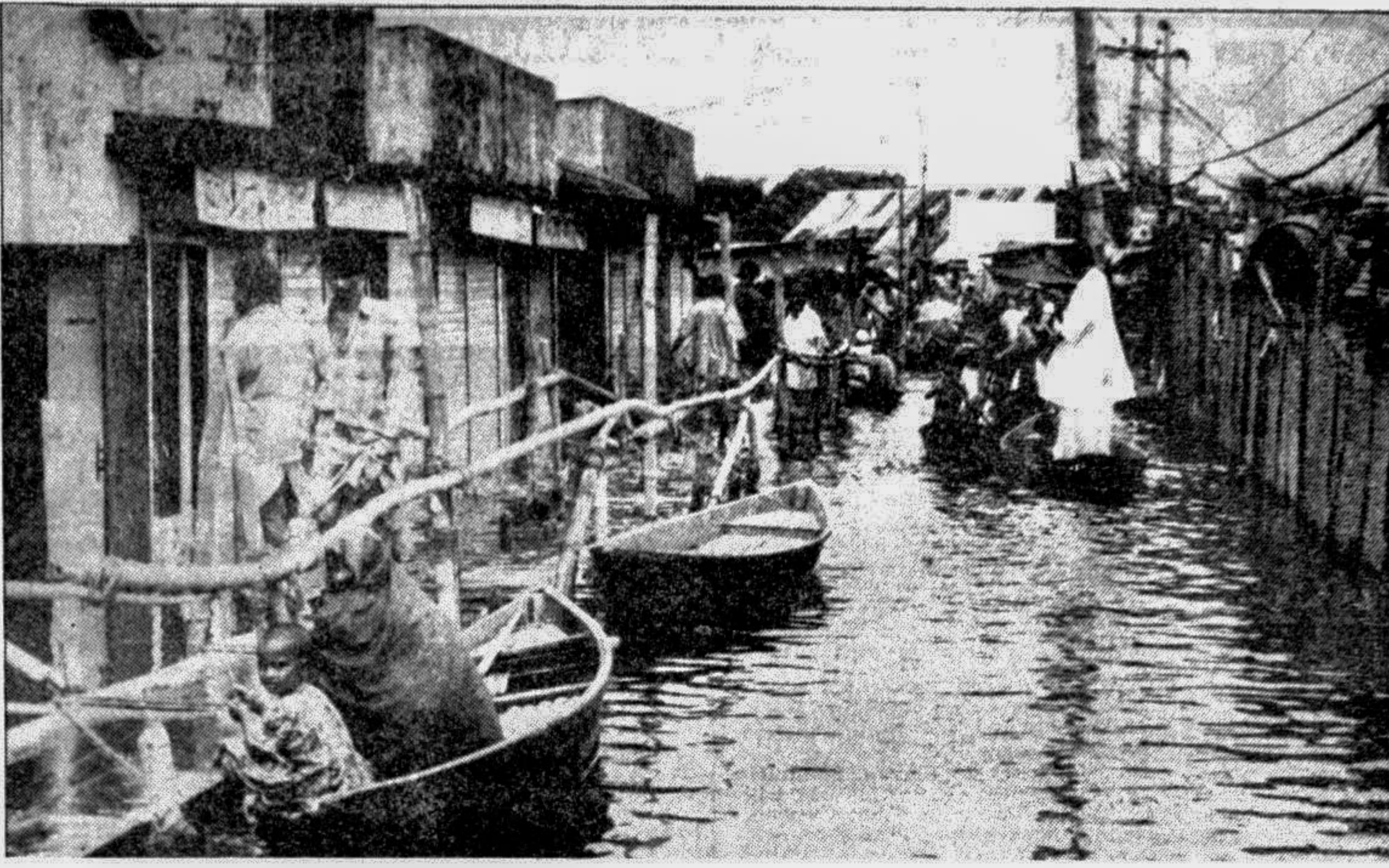
The bamboo frame at Nandipara in the city that was made for pedestrians has gone under water with the rise of water level in all rivers.