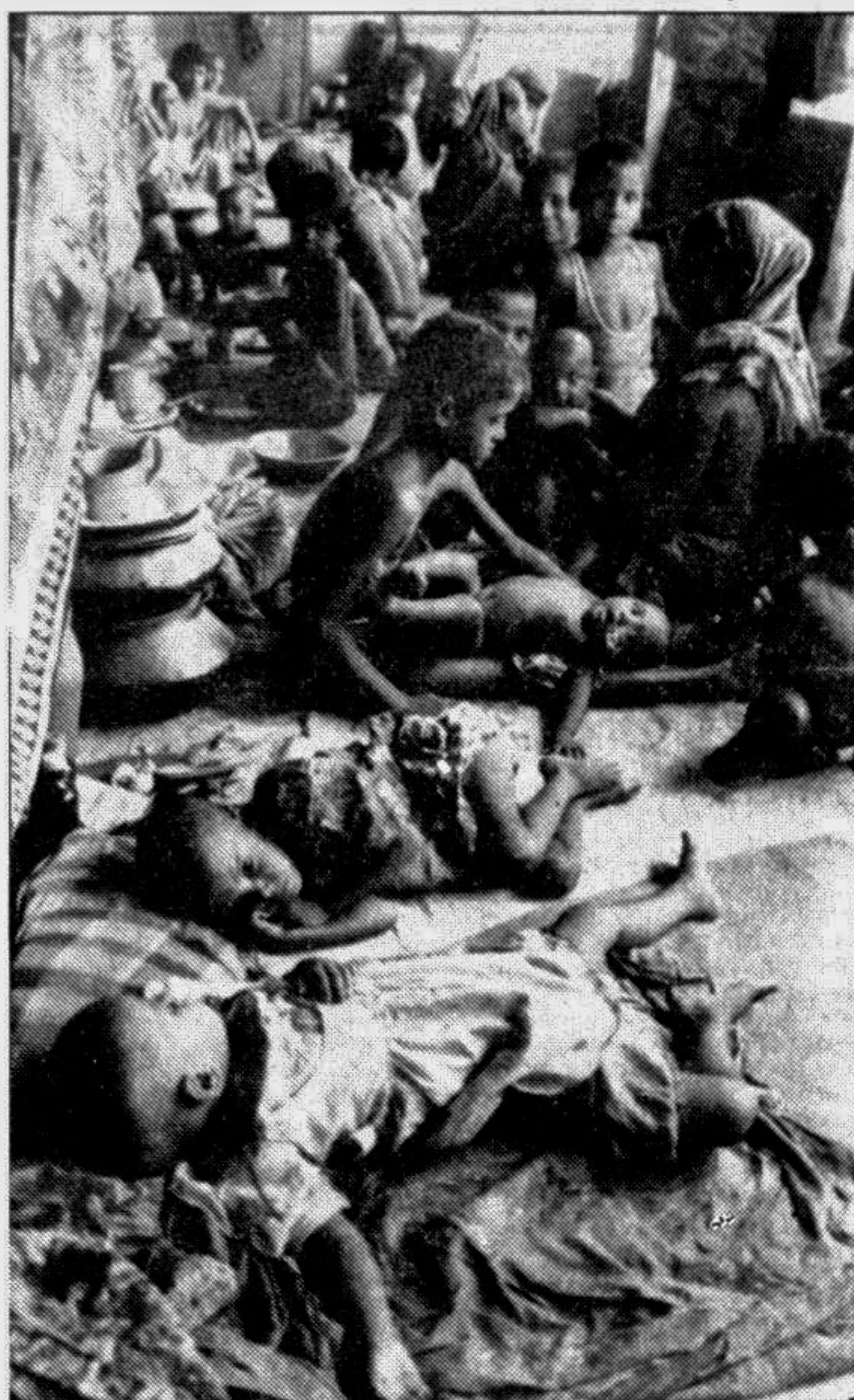
Two children await their mother, who has gone out to look for means of getting some food, at a relief shelter in Mirpur area yesterday.