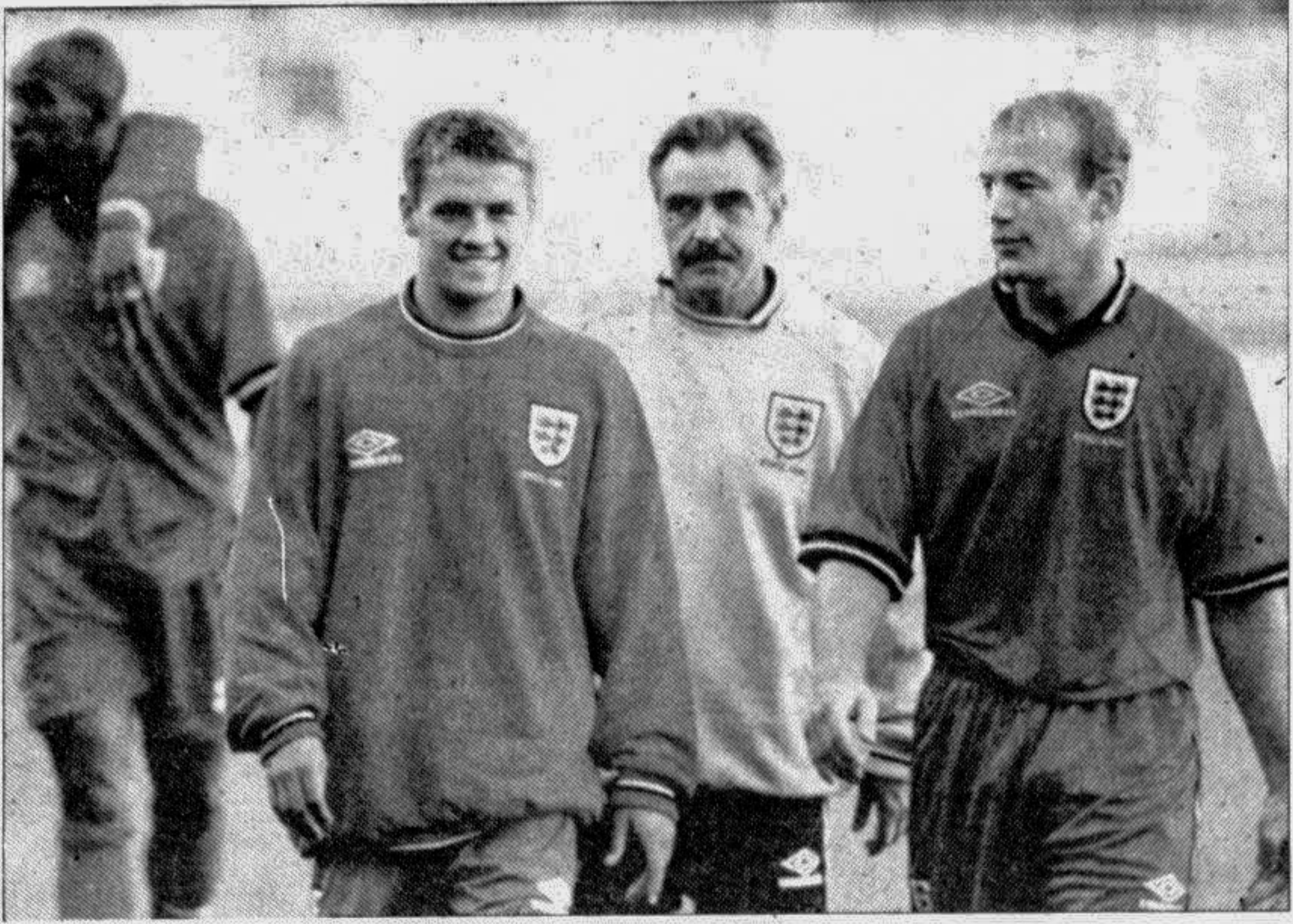
England's striking duo Michael Owen (3rd from R) and Alan Shearer (R) coming off the Rusanda Stadium pitch in Stockholm following a training session ahead of Saturday's Euro 2000 qualifier against Sweden.

(India cricket team's consultant) 'I get a kick as a coach. I have never lost my enthusiasm for the game.'