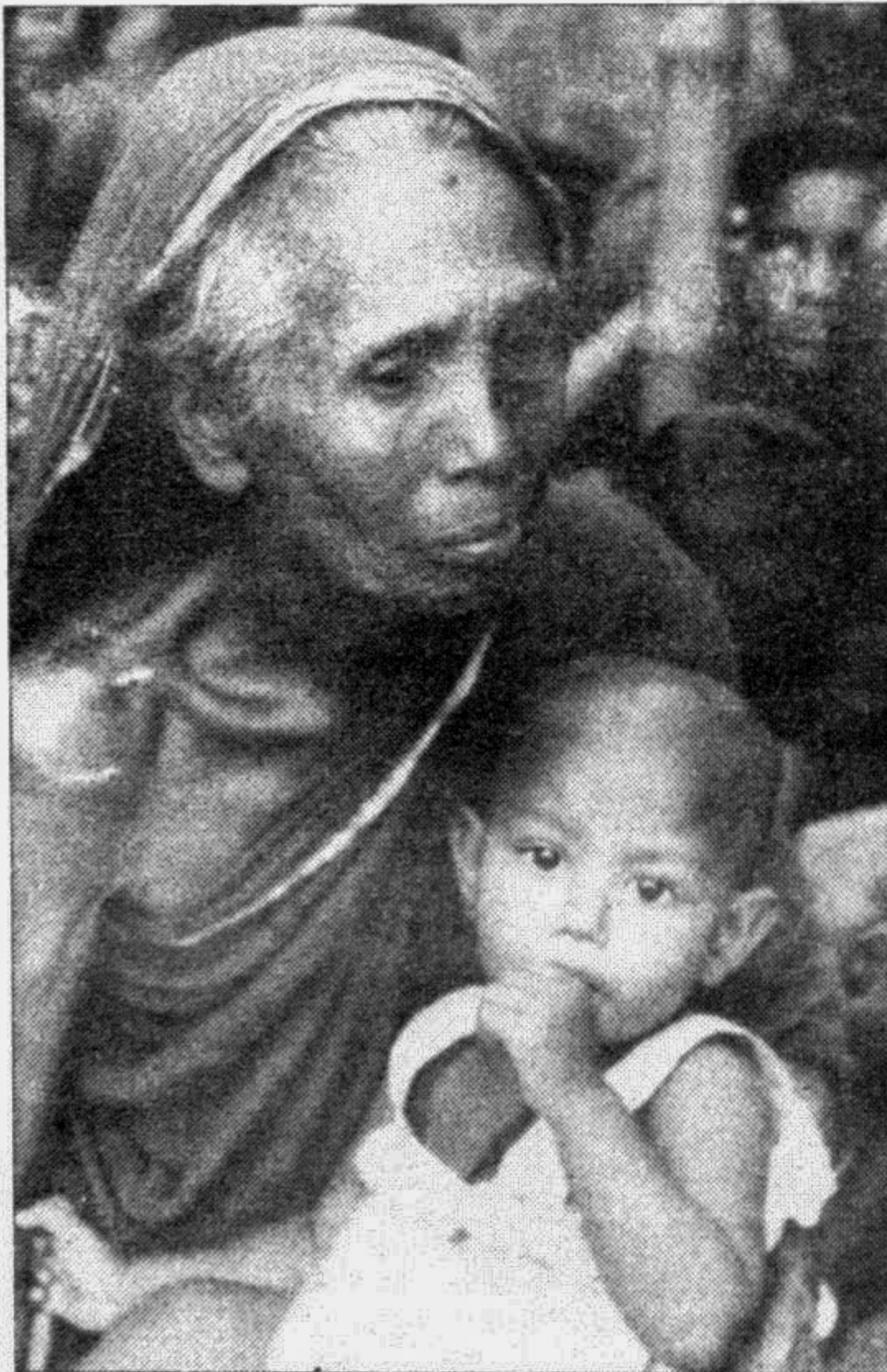
A helpless old woman with a child in her lap at a relief camp at Keraniganj ghat.