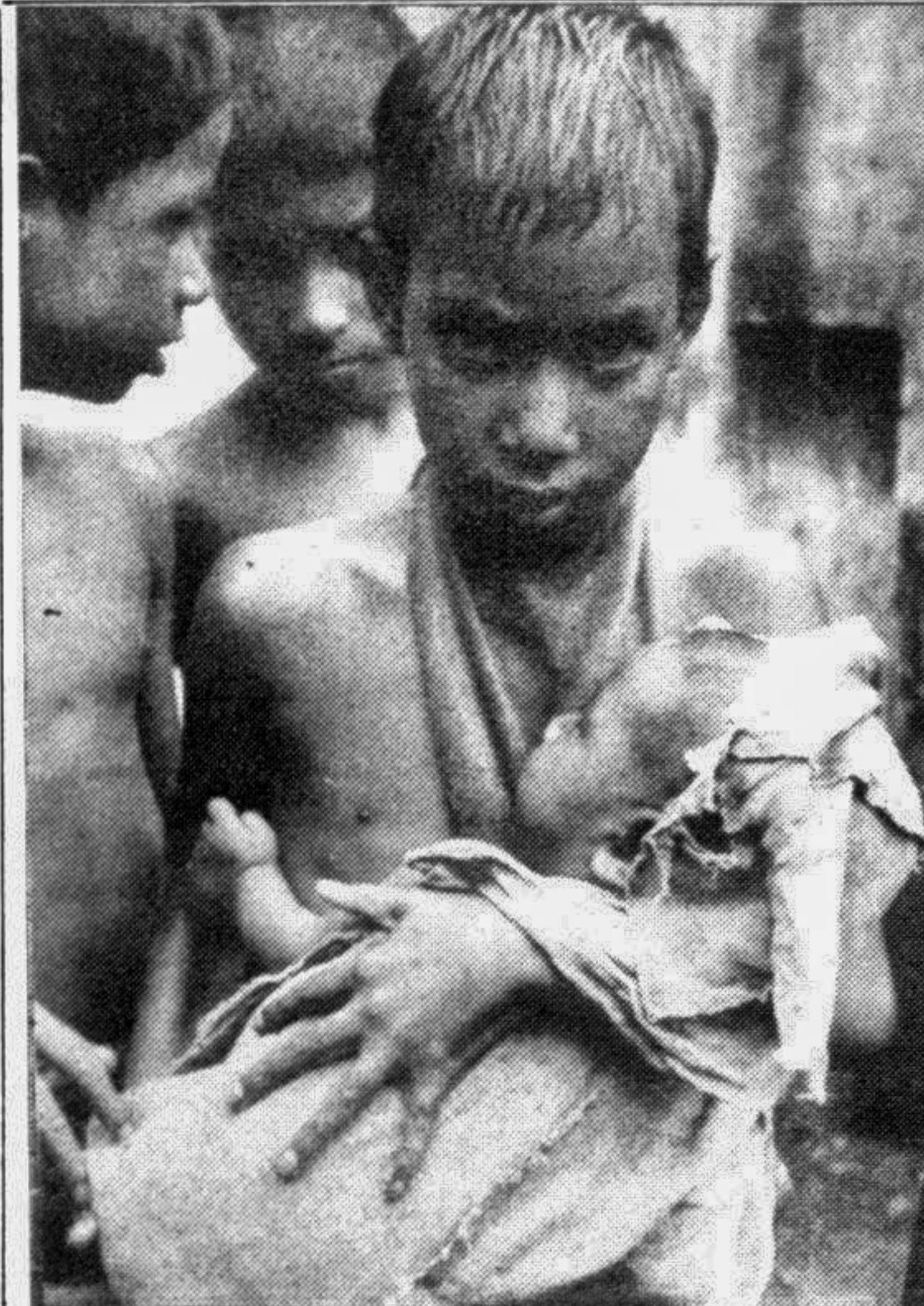
A boy with his brother, a newborn baby at a relief camp at Kamrangirchar.