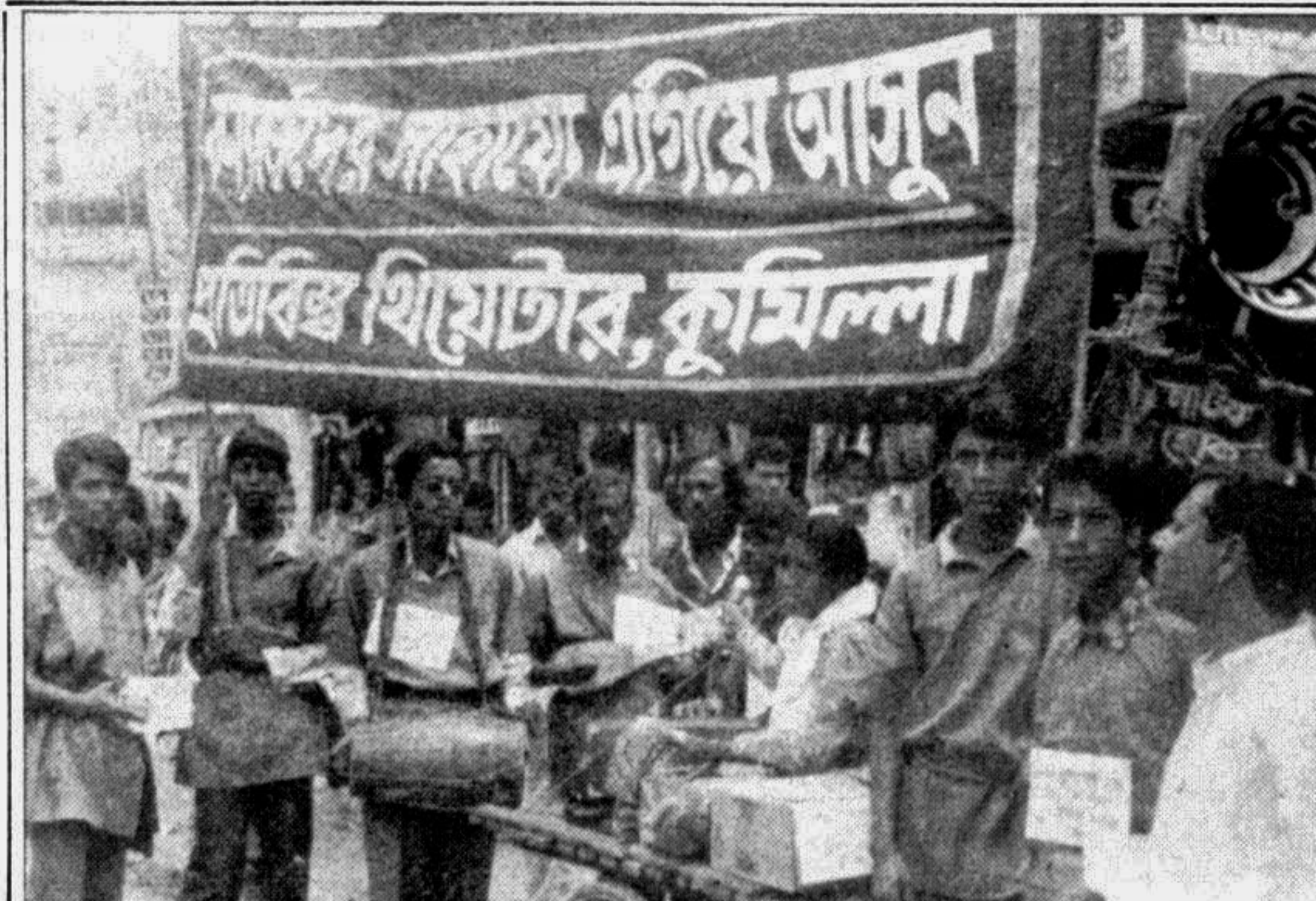
COMILLA: Protibimbo Theatre, a cultural organisation here arranged on August 30 roadside drama and musical programme with view to collecting donation for flood victims.