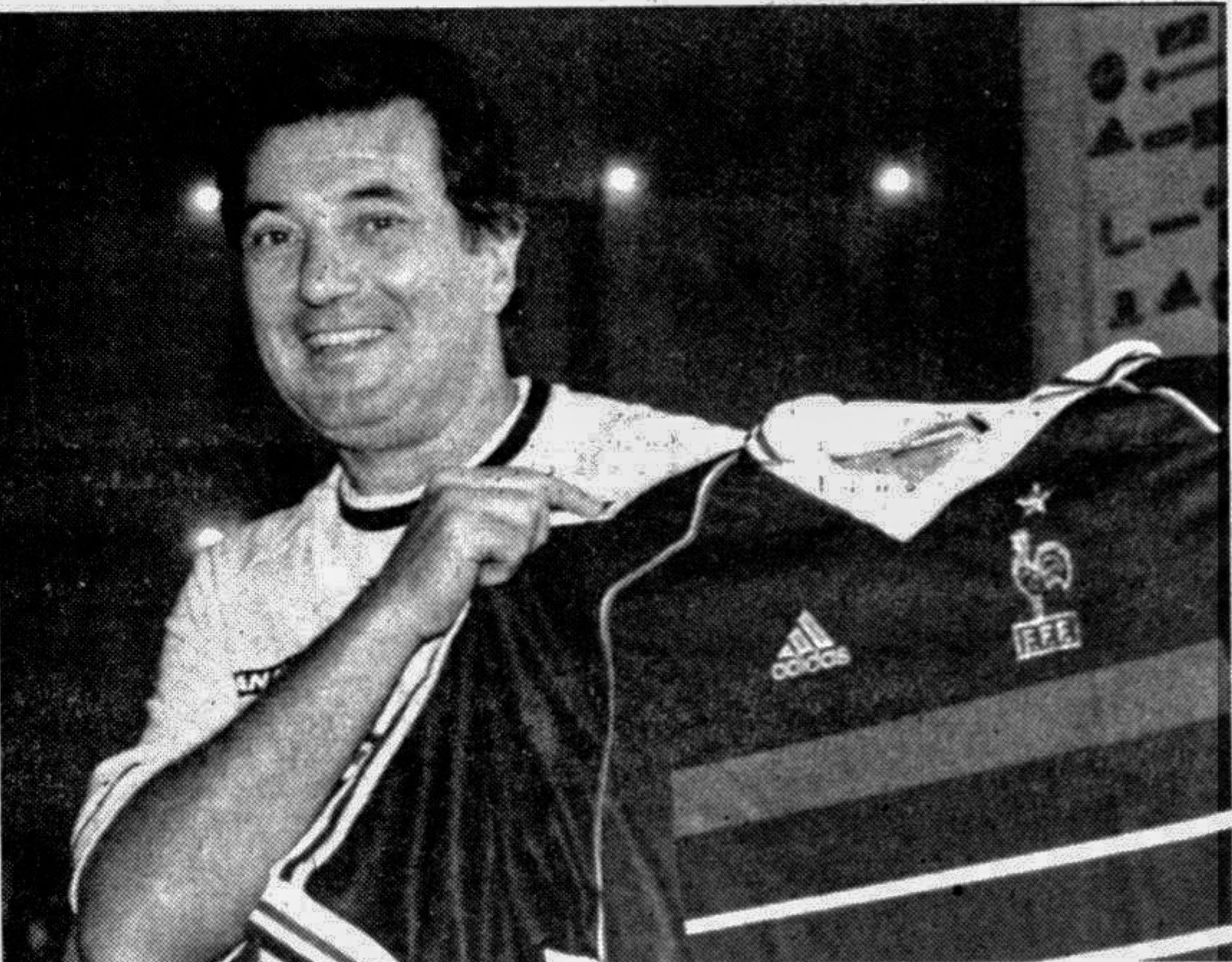
Roger Lemerre, the French national coach, shows the new team jersey with a yellow star commemorating their World Cup triumph, at Clairefontaine yesterday.

In the event neither team progressed to the final. Singapore defeated Indonesia 2-1 in the first semifinal while Vietnam beat Thailand 3-0.