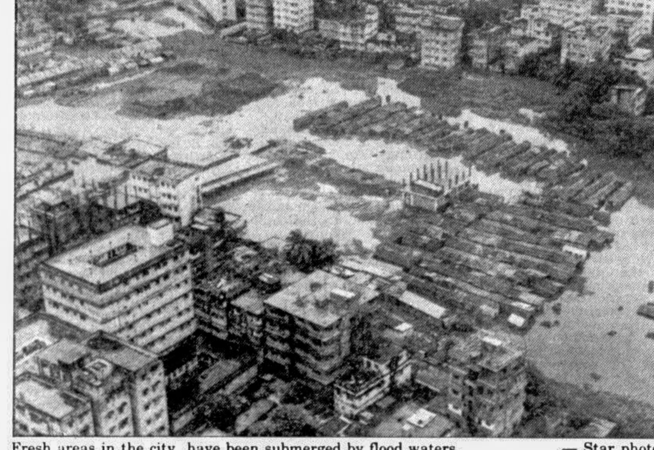
Fresh areas in the city have been submerged by flood waters.

The present flood situation in the country has caused a tremendous increase in the volume of the city's floating labourers. Normally they form a prominent aspect of its socio-economic life.