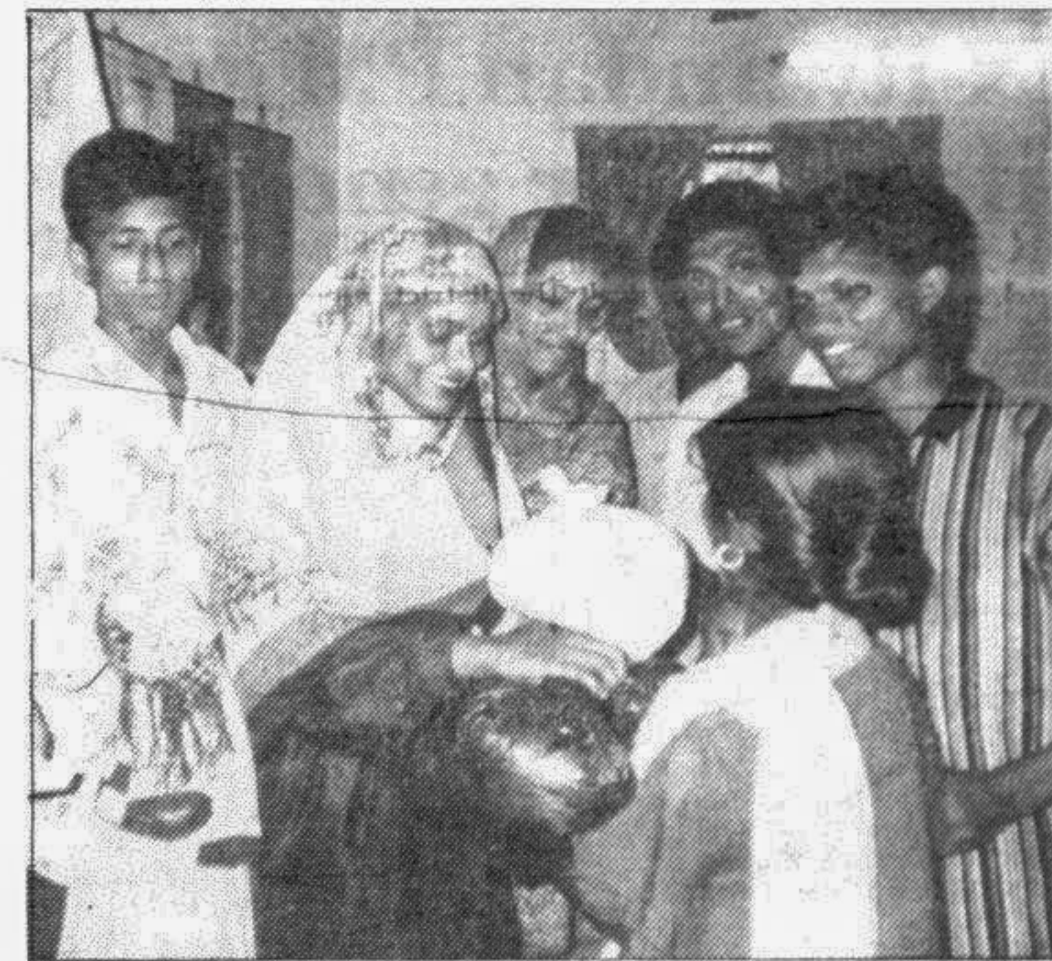
Darland International School distributed relief materials, including dry foods and old clothes, among flood victims at the Mirpur Shah Ali Girls' School and College shelter in the city yesterday.