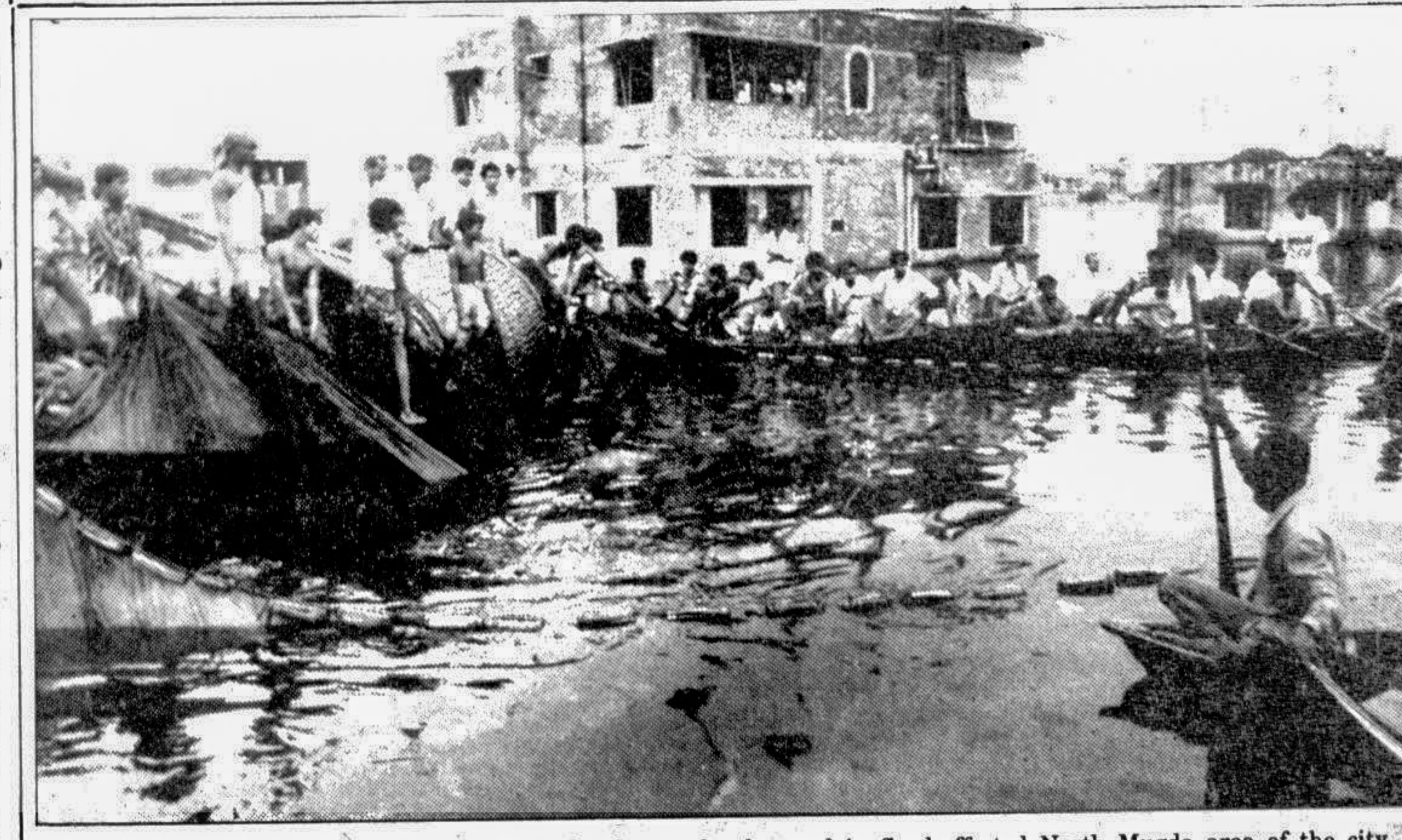
Search for the body of the younger of two brothers, who drowned in flood-affected North Mugda area of the city Thursday, continued yesterday.

But observers believe Saturday's test could be designed to coincide with the election of the isolated North Korean state's leader Kim Jong-il as president. The Stalinist leader is expected to be voted president on Saturday, with a formal inauguration on Wednesday.