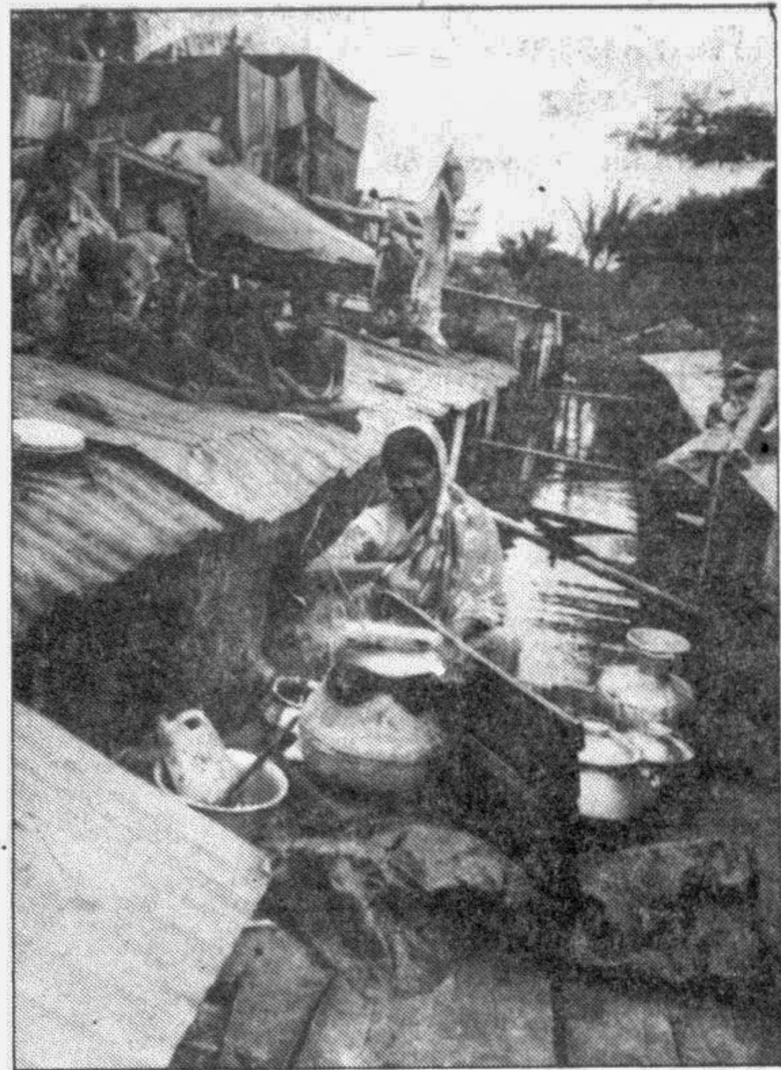
MANY MOUTHS TO FEED: A woman cooks food in a makeshift kitchen for a large family while the youngsters wait patiently on rooftop.