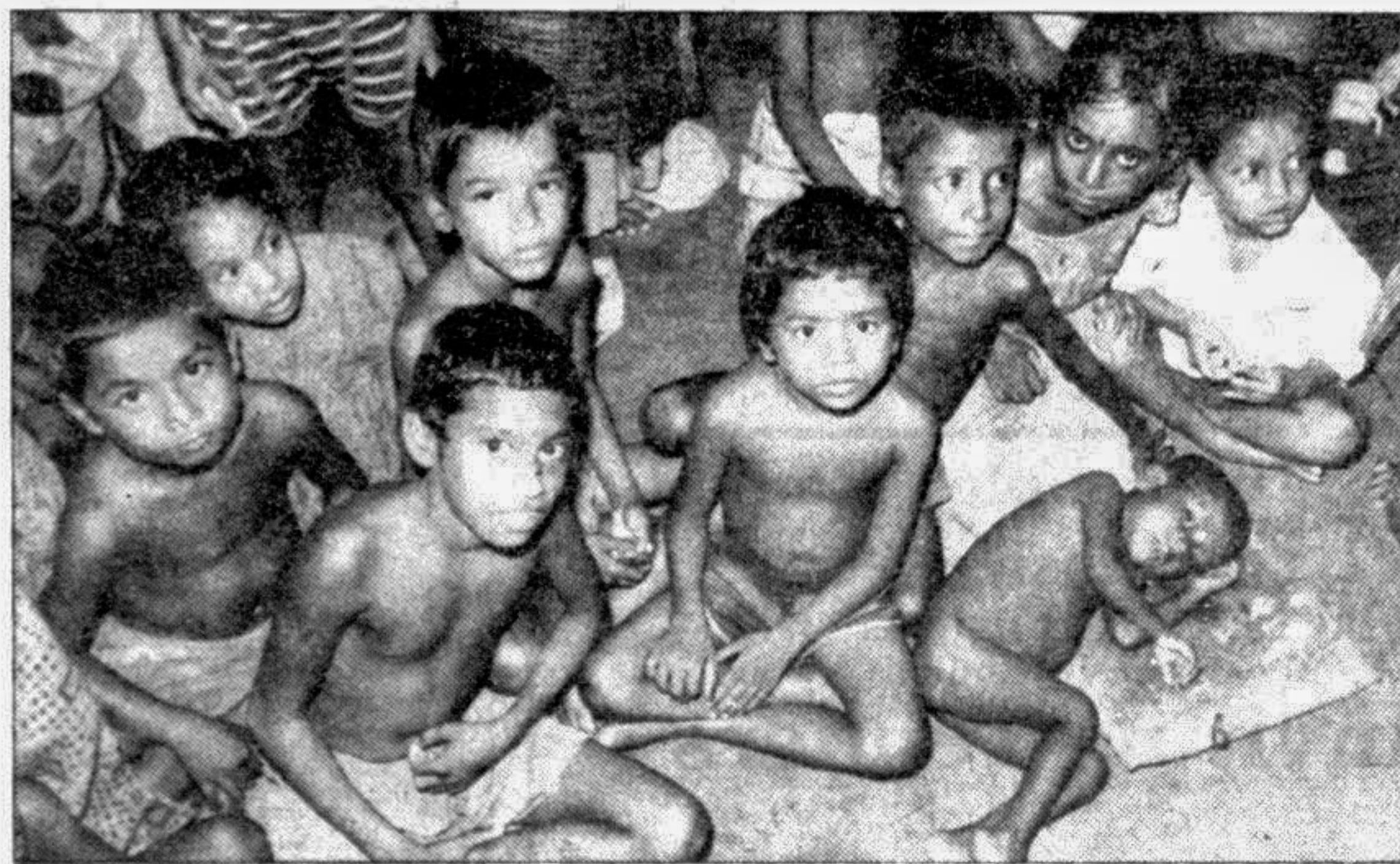
CHILDREN OF LESSER GOD: While the healthy ones wait in a relief camp for flood water to recede, one of them, not so healthy, tries to get some rest.