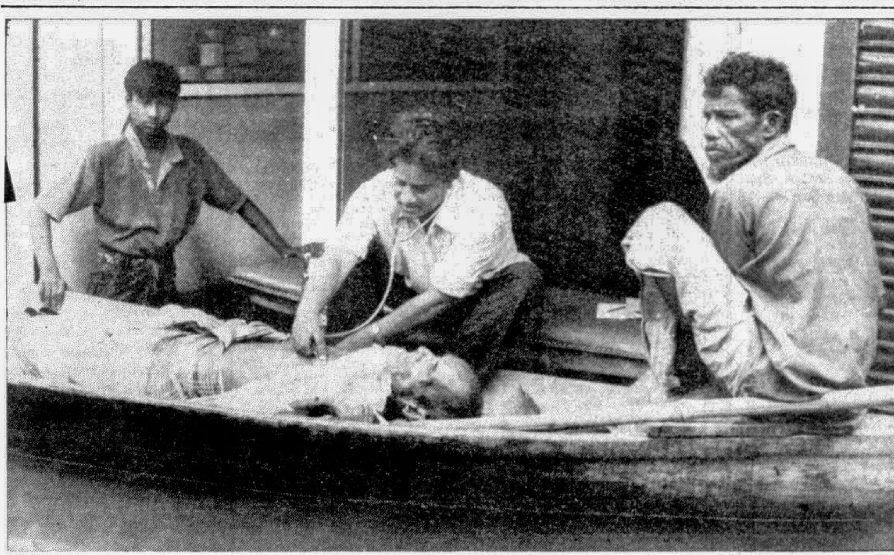
FLOATING MEDICAL CENTRE: A physician examining a patient brought on a boat at Kamrangirchar.