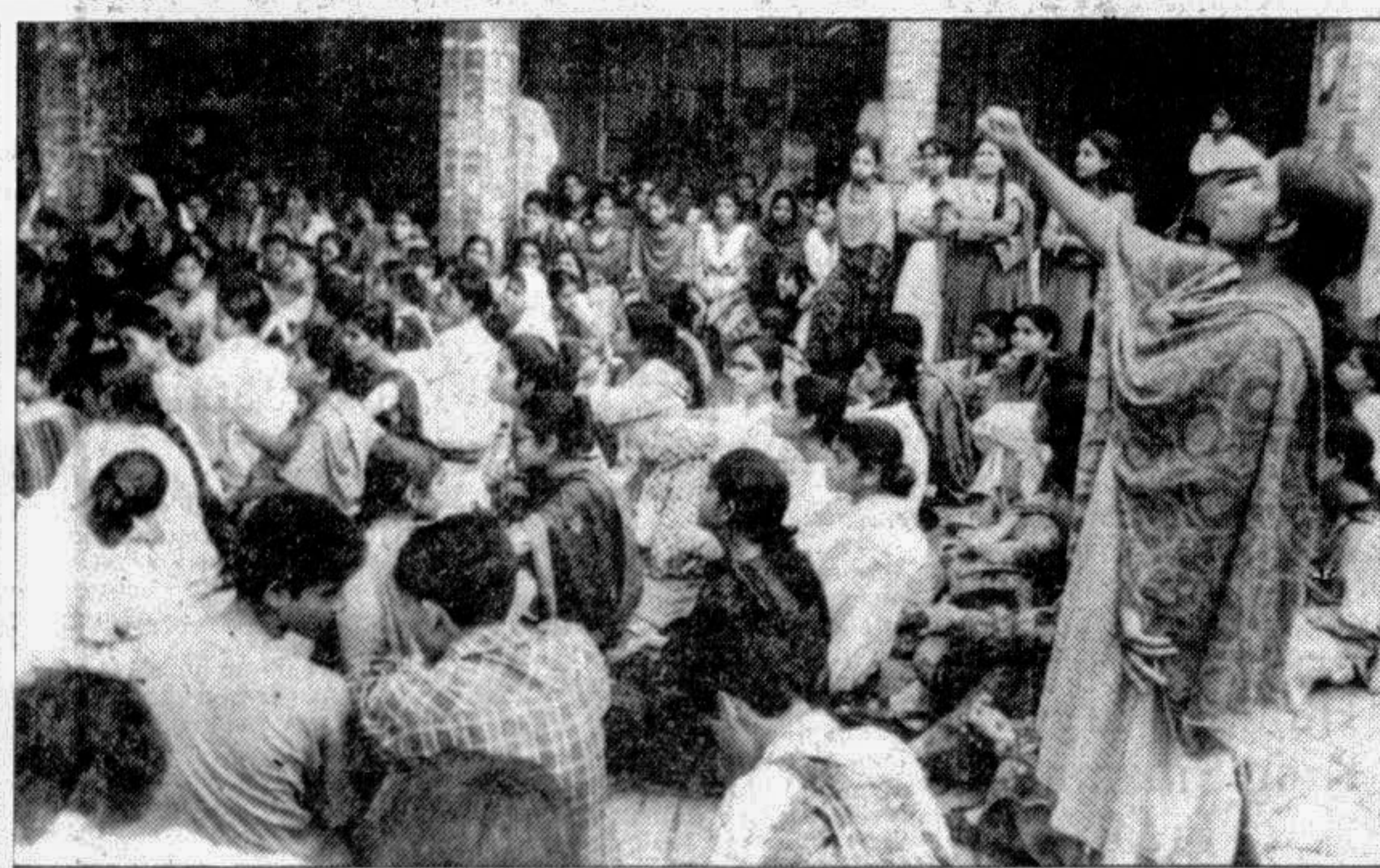
Students of Jahangirnagar University gheraoed the VC's office yesterday while a Syndicate meeting was going on.

About the future task of NAM, Hasina said Durban summit will have to prepare a blueprint of the role of the