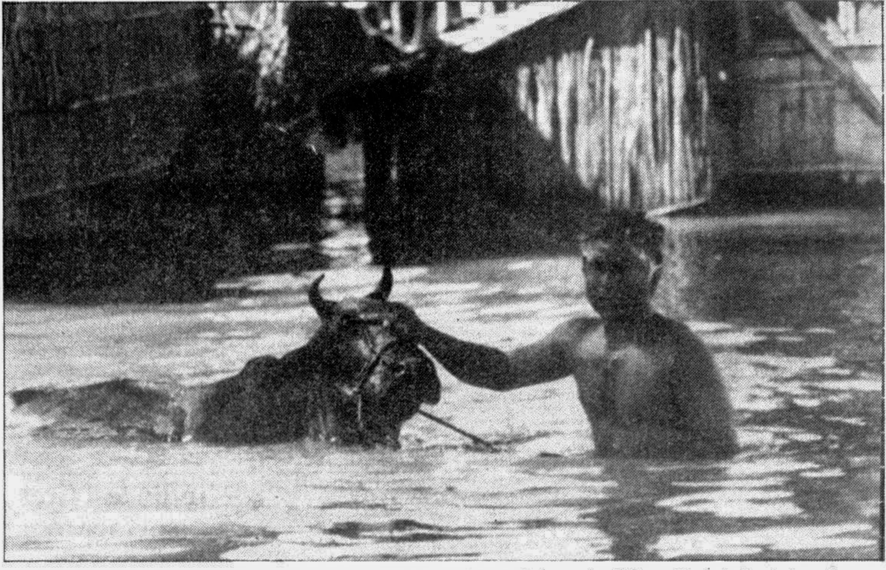
MUNSHIGANJ: Cattles have no place of shelter as flood submerged the entire Kalma village in Lauhajang thana.

Work on 117 projects progressing FENI, Sept 2: One hundred seventeen projects of different nature are going to be completed in the district within the next month, reports BSS.