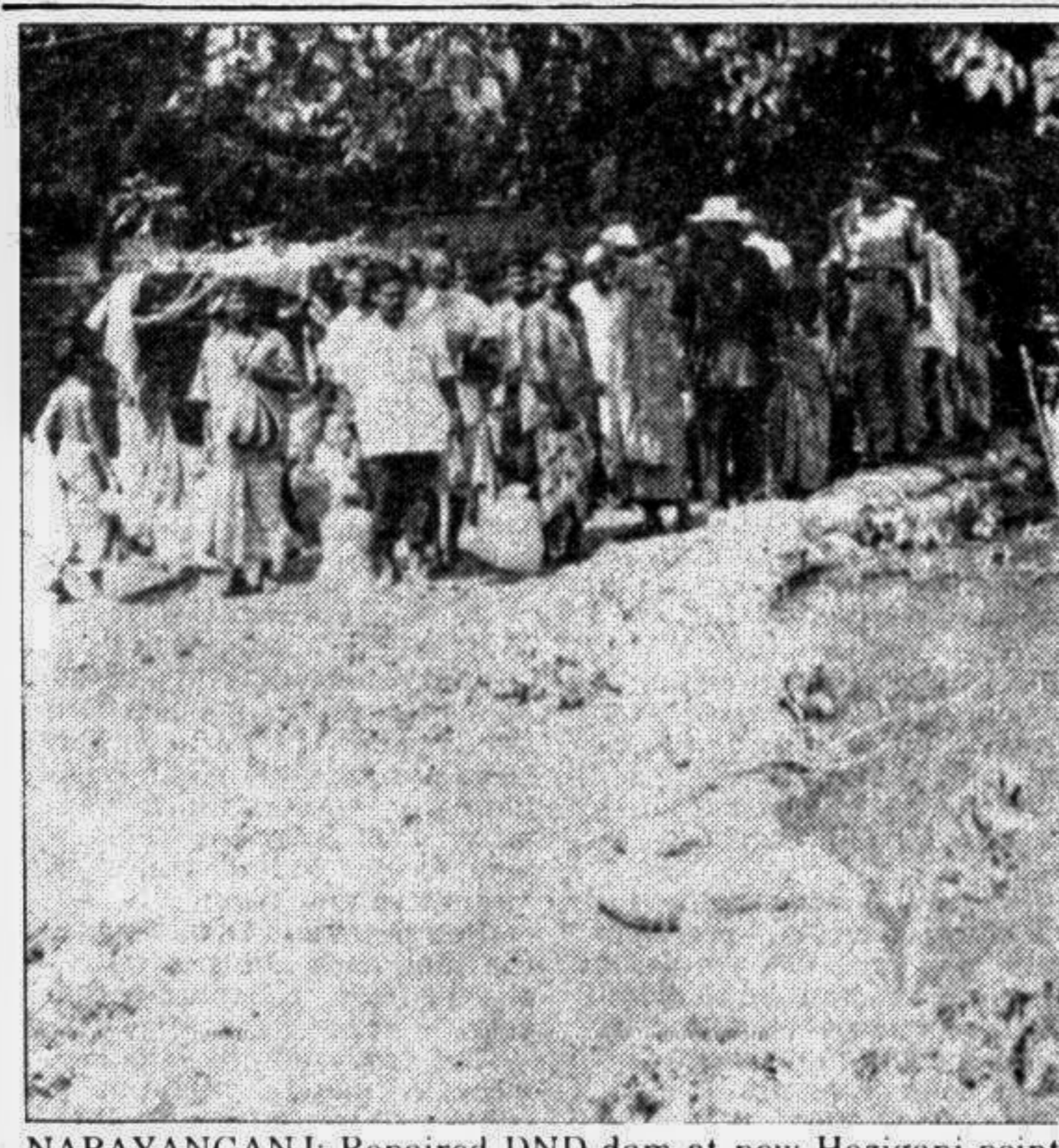
NARAYANGANJ: Repaired DND dam at new Haziganj point.

Work on 117 projects progressing FENI, Sept 2: One hundred seventeen projects of different nature are going to be completed in the district within the next month, reports BSS.