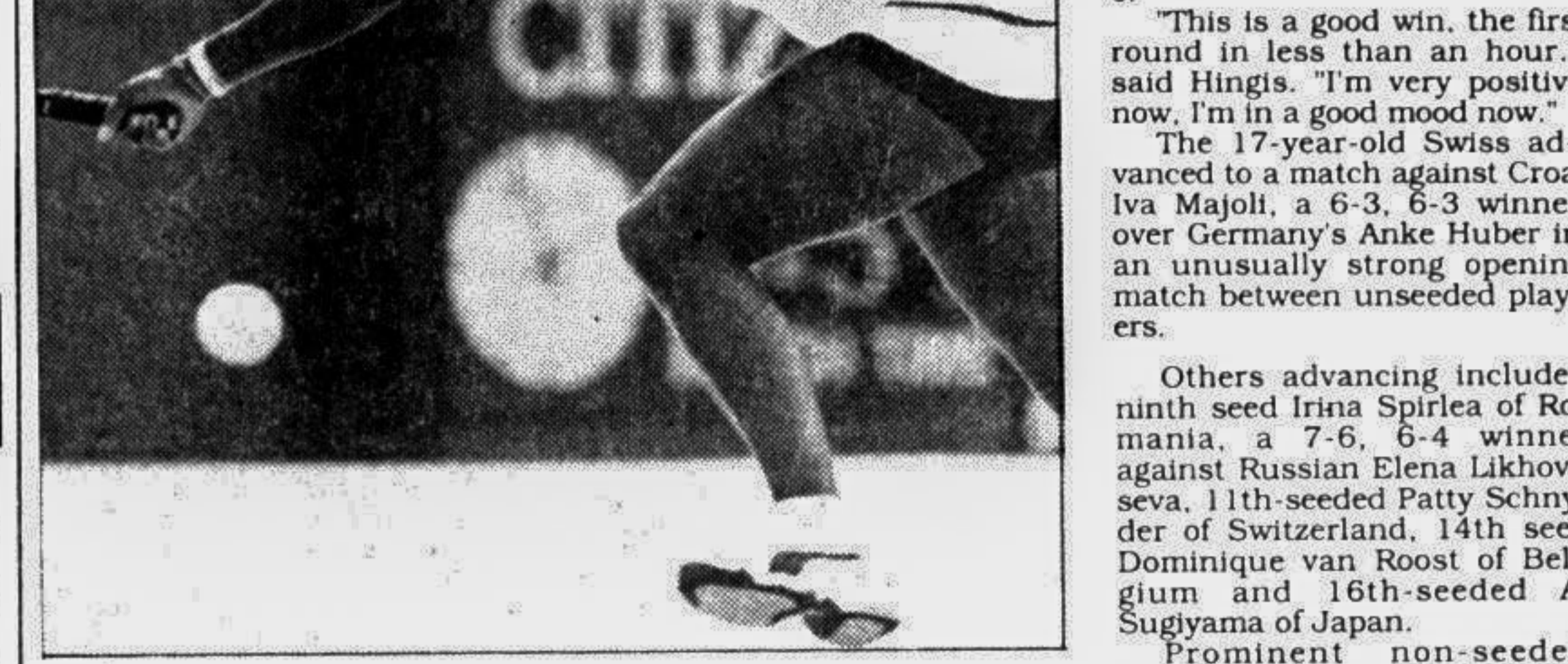
American Serena Williams stretches to execute a forehand during her US Open first round match against Nicole Pratt of Australia at Flushing Meadows, New York on August 31.