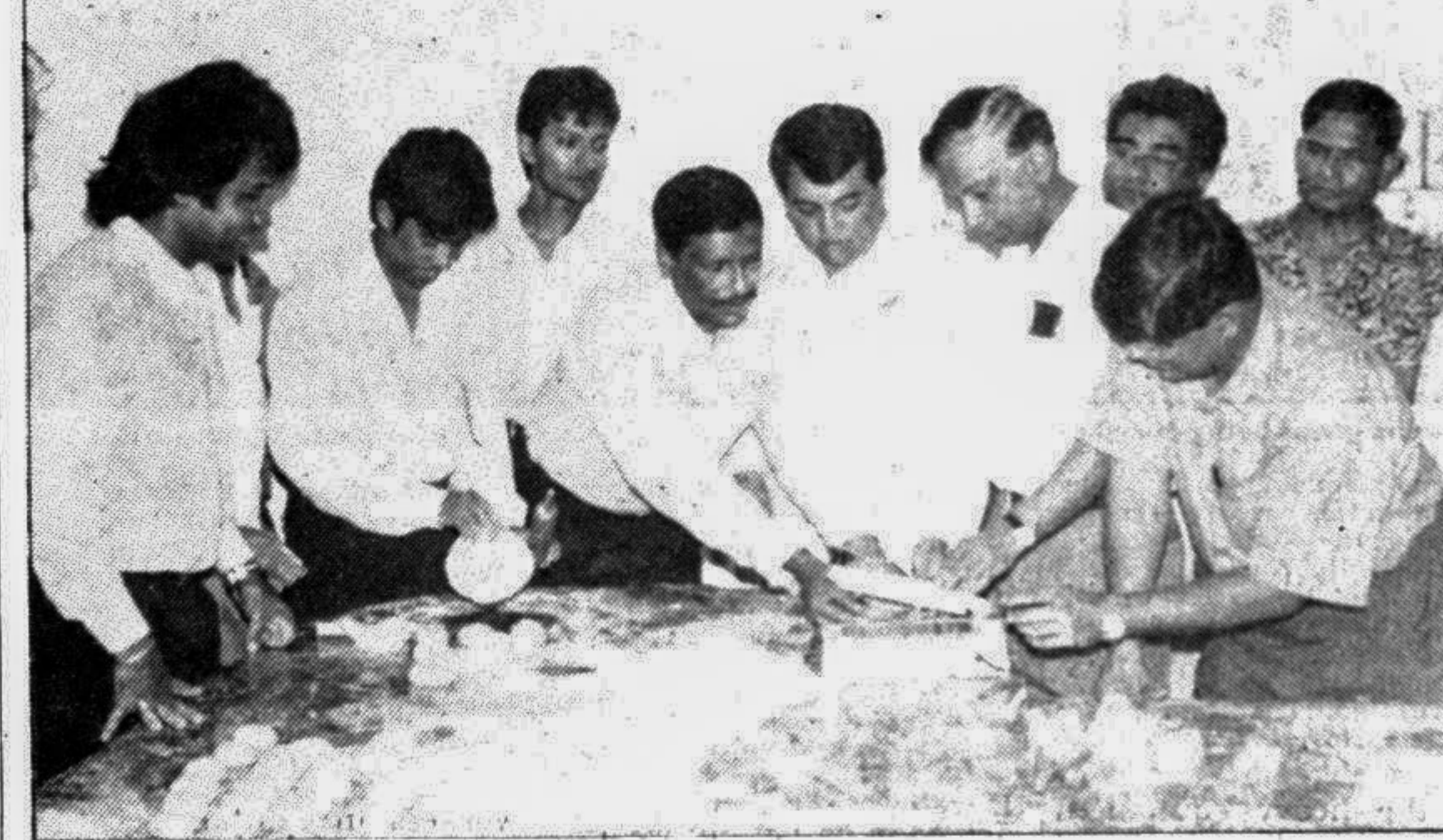
State Minister for Youth and Sports Obaidul Quader inaugurating the saline and 'rooti' project of the sports relief committee at the National Sports Council yesterday.

Having fought back from cocaine addiction to resume his career in 1987 after a layoff of 33 months, Dokes suffered a relapse in 1991.