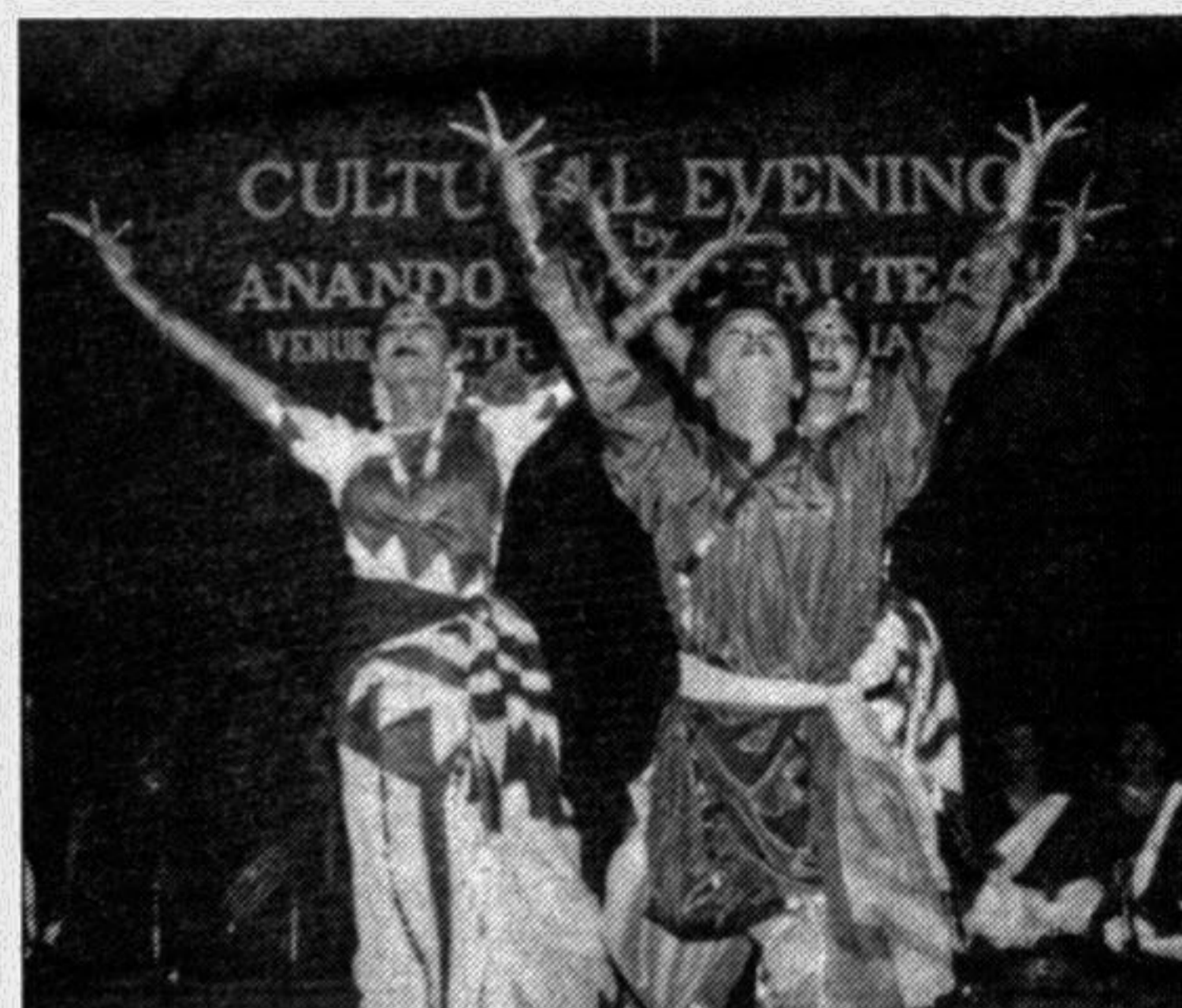
Anando, a national NGO dedicated to Youth Rescue Development, organised a cultural function at the German Cultural Centre recently to raise fund for flood-affected people.

UNB adds: A United Nations Disaster Assessment and Co-ordination (UNDAC) team has arrived in Bangladesh on an emergency mission to assist in development, compilation and "packaging" of an appeal document and on-site assessment for resource mobilisation.