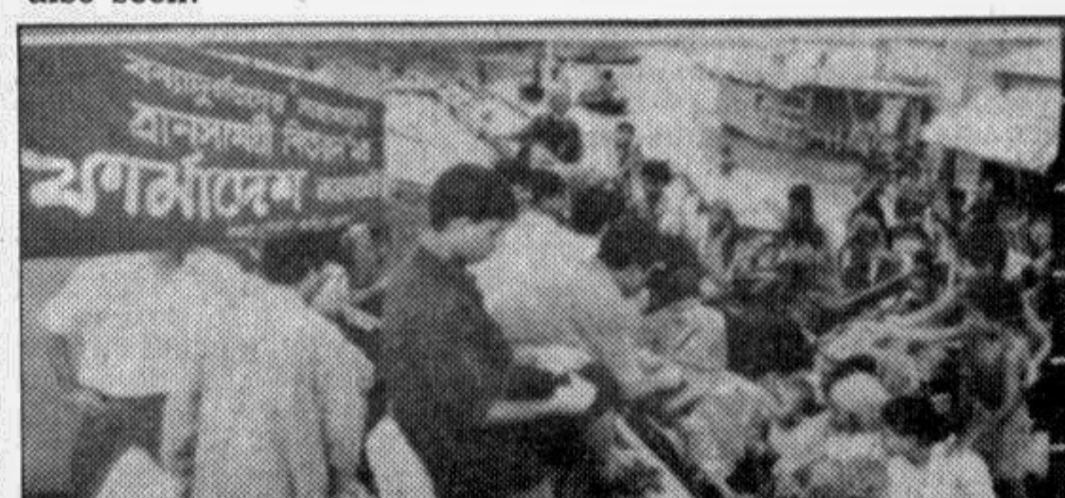
Pharmadesh Laboratories distributed relief materials among the flood victims in the city's Basabo, Goran and Lalbagh areas on Friday.