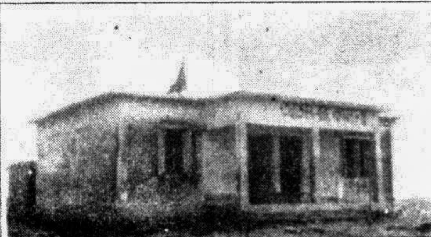
GOPALGANJ: A submerged non-government primary school at Chachania in Gopalganj municipal area.