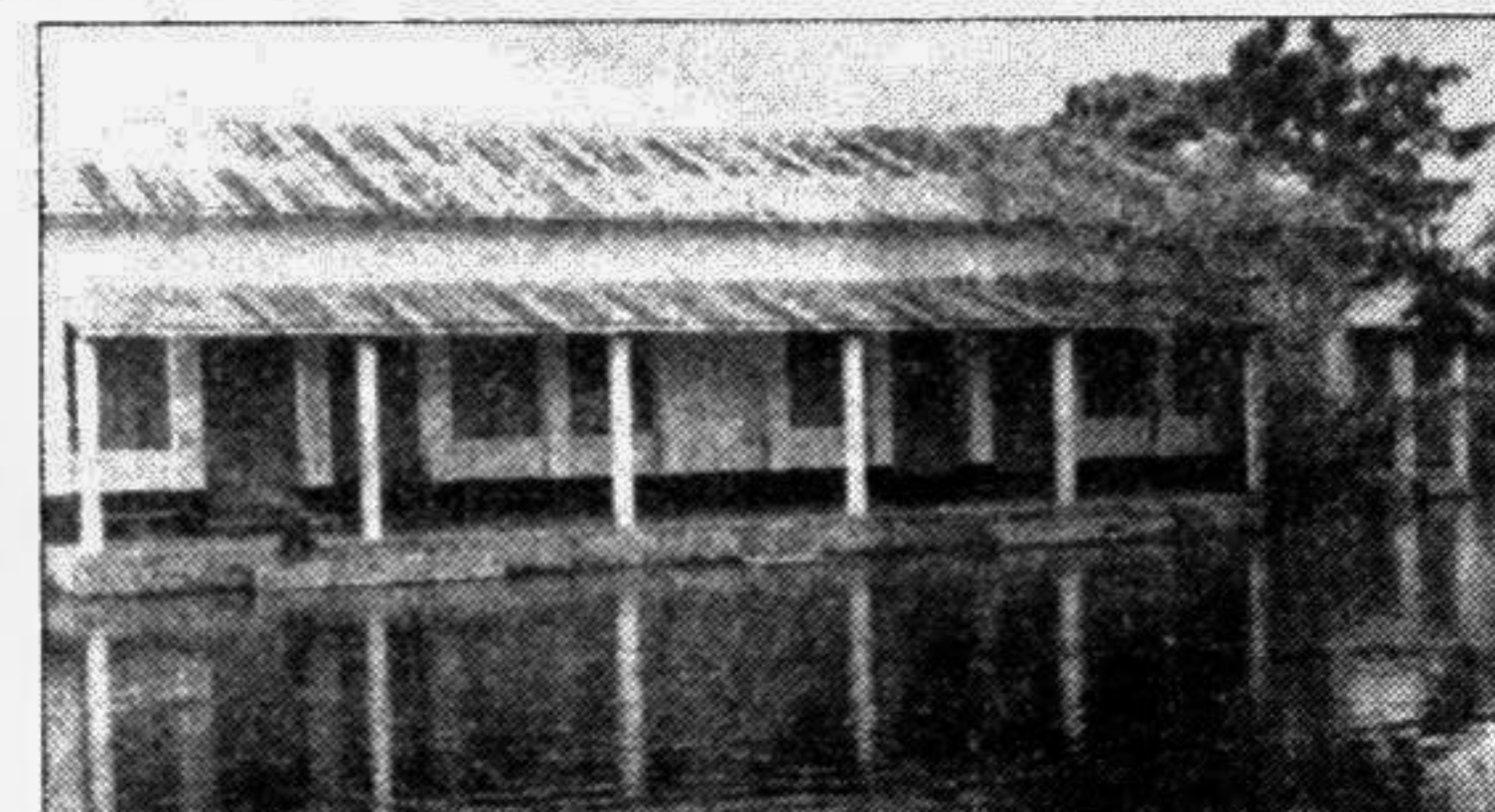
MYMENSINGH: A government primary school remained closed for more than a month due to flood in the sadar thana.