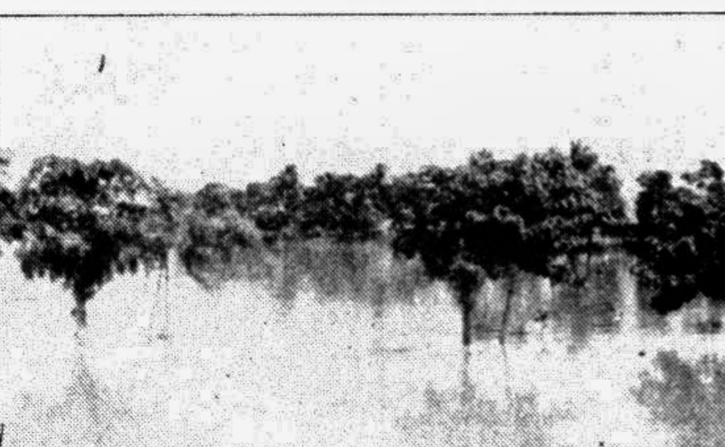
MAGURA: Inundated village Char Chakdah in Sripur thana of the district.

The booklet 'Facts for Life' was published by the Ministry of Information. The publication ceremony was arranged by Cox's Bazar district information office. Government officials, NGO officials, lawyers and local journalists attended the function.