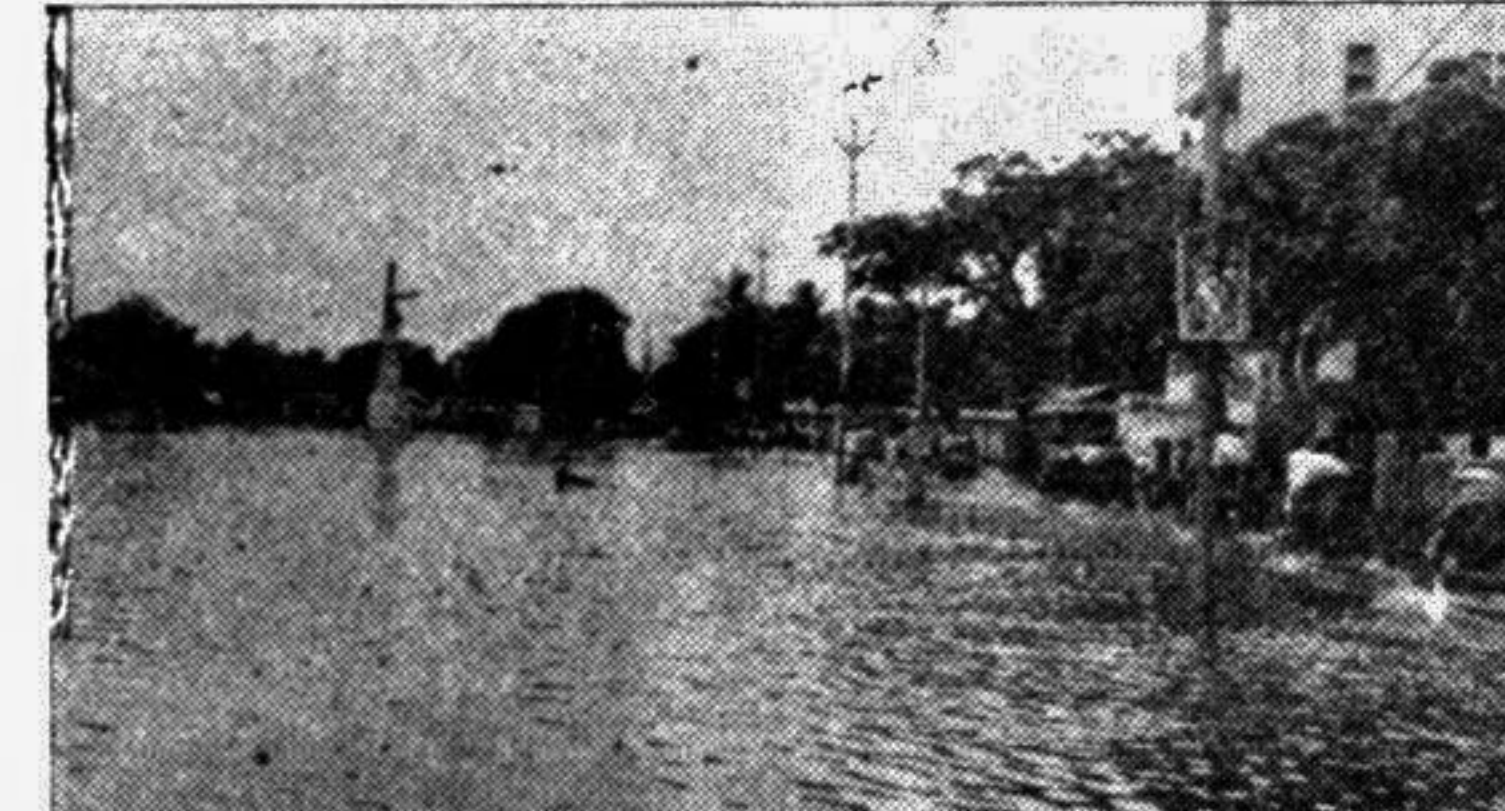
CHANDPUR: 'Ongikar' — the Liberation War monument has been inundated by flood water.