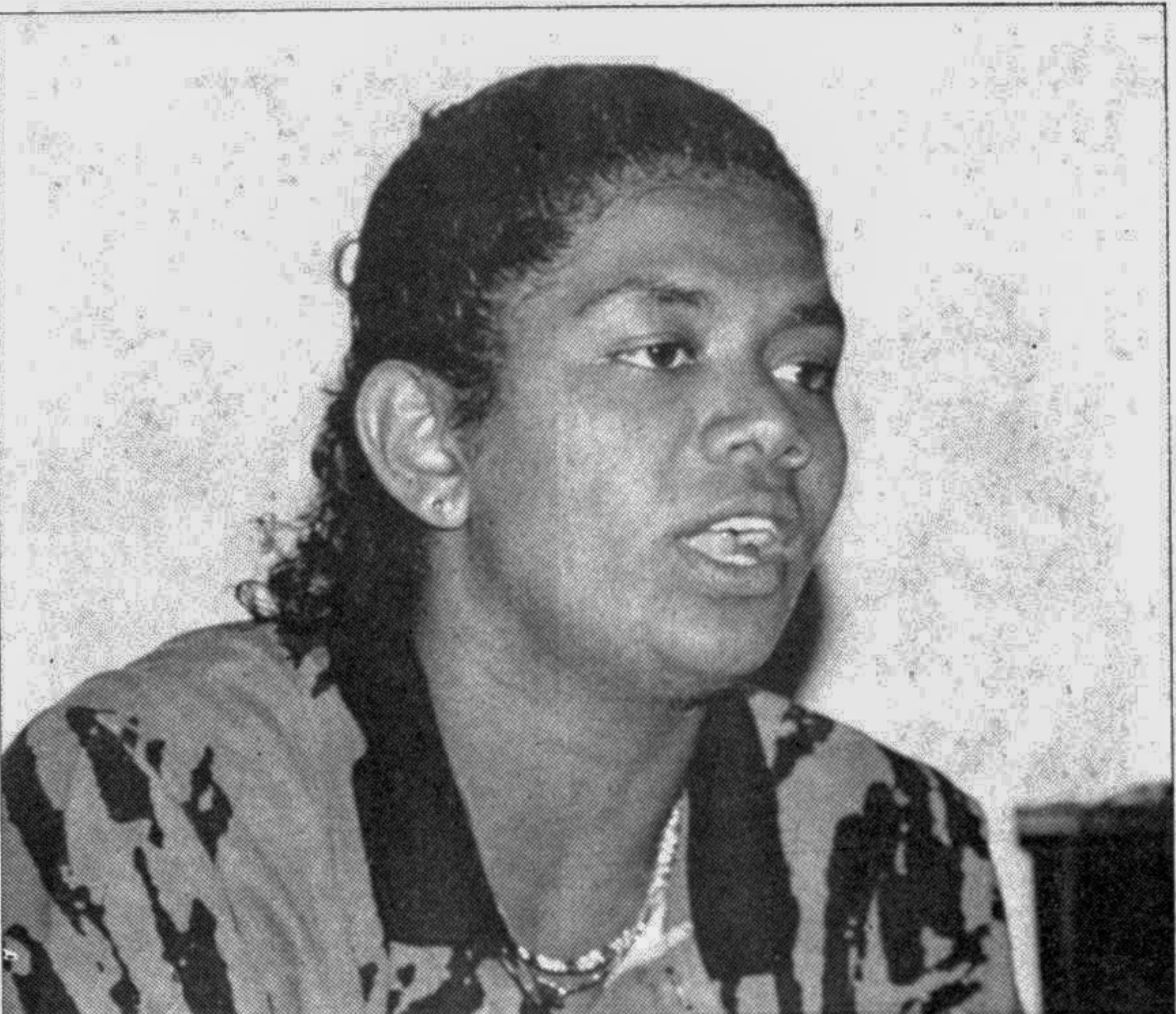
Sri Lankan ace sprinter Susantika Jayasinghe talking at a press conference at Mirigama yesterday. Jayasinghe, who was recently cleared of doping charges, sought a reconciliation with the national sports ministry.