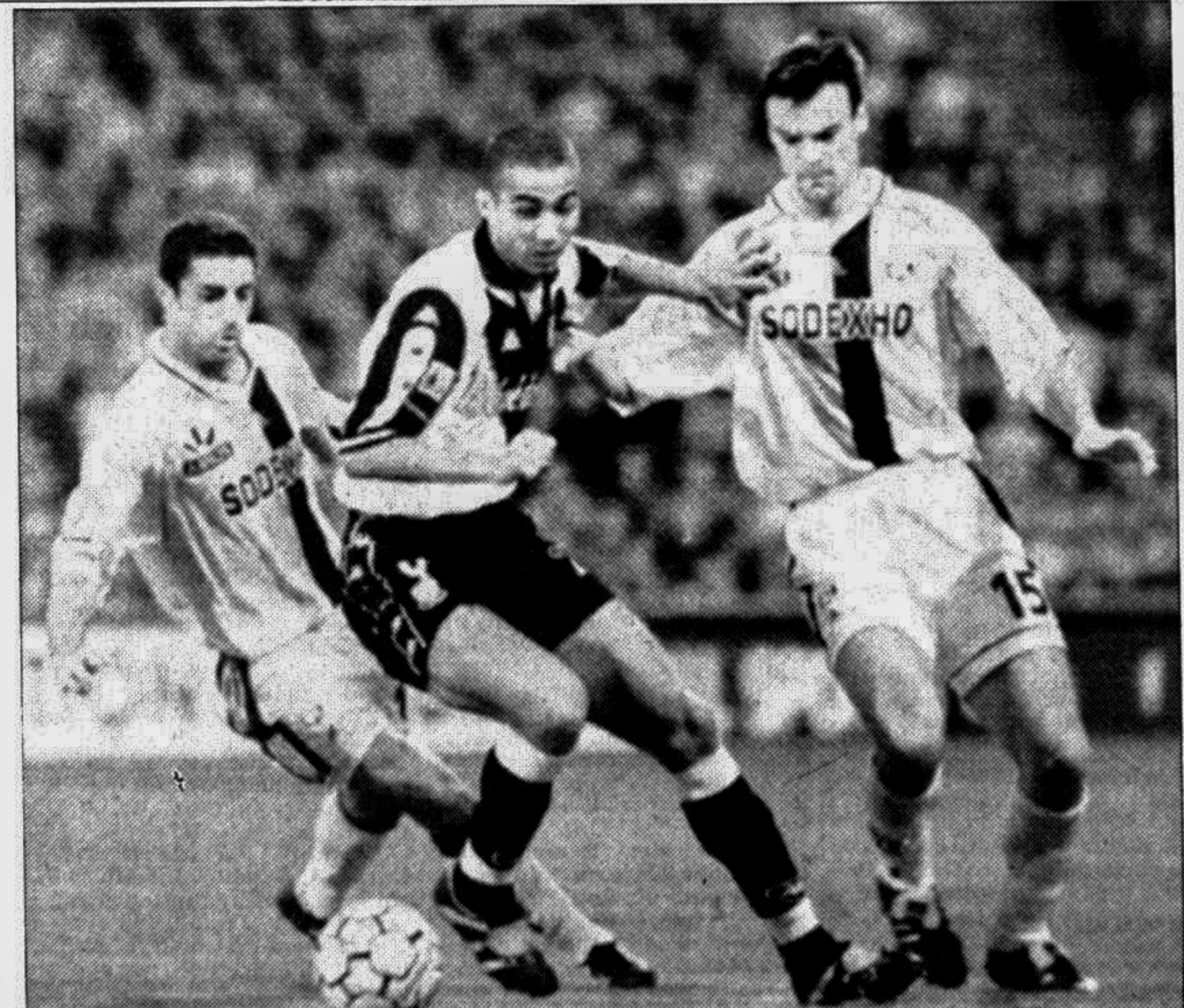
French international David Trezeguet (C) of Monaco staves off the challenge of two Lyon booters during their French First Division encounter at Lyon on August 29.