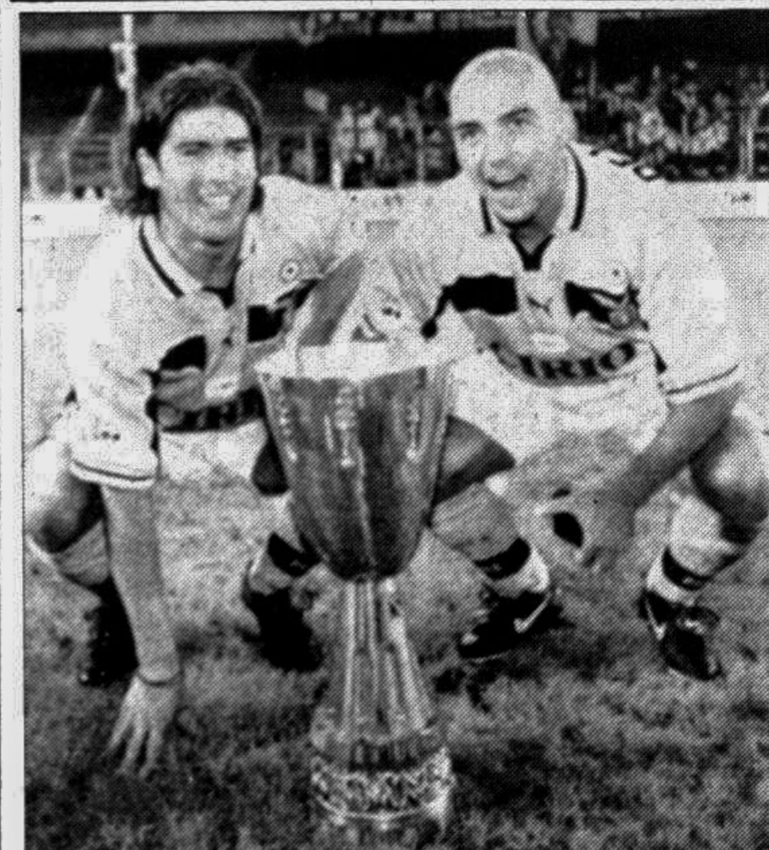
Hot signings Marcelo Salas (L) and Ivan de la Pena (R) pose with the Italian Super Cup after their triumph over defending Serie A Champions Juventus at Turin on August 29. Lazio won 2-1.

ROME, Aug 30: Lazio beat Juventus 2-1 on Saturday in the one-leg Super Cup to win the first trophy of the Italian season, reports Reuters. The Rome side were forced onto the defensive as Juventus opened in spirited form, but moved onto the attack to lead in the 38th minute with a goal by Pavel Nedved, set up by Roberto Mancini. The second half saw a lacklustre Juventus but Lazio in fighting mood, their advantage boosted when Juve striker Filippo Inzaghi was sent off in the 63rd minute. The Turin team, playing at home, equalised in the 87th minute with a penalty from Alessandro Del Piero. But Sergio Conceicao delivered victory to Lazio in extra time when he put the ball into the net in the 93rd minute.