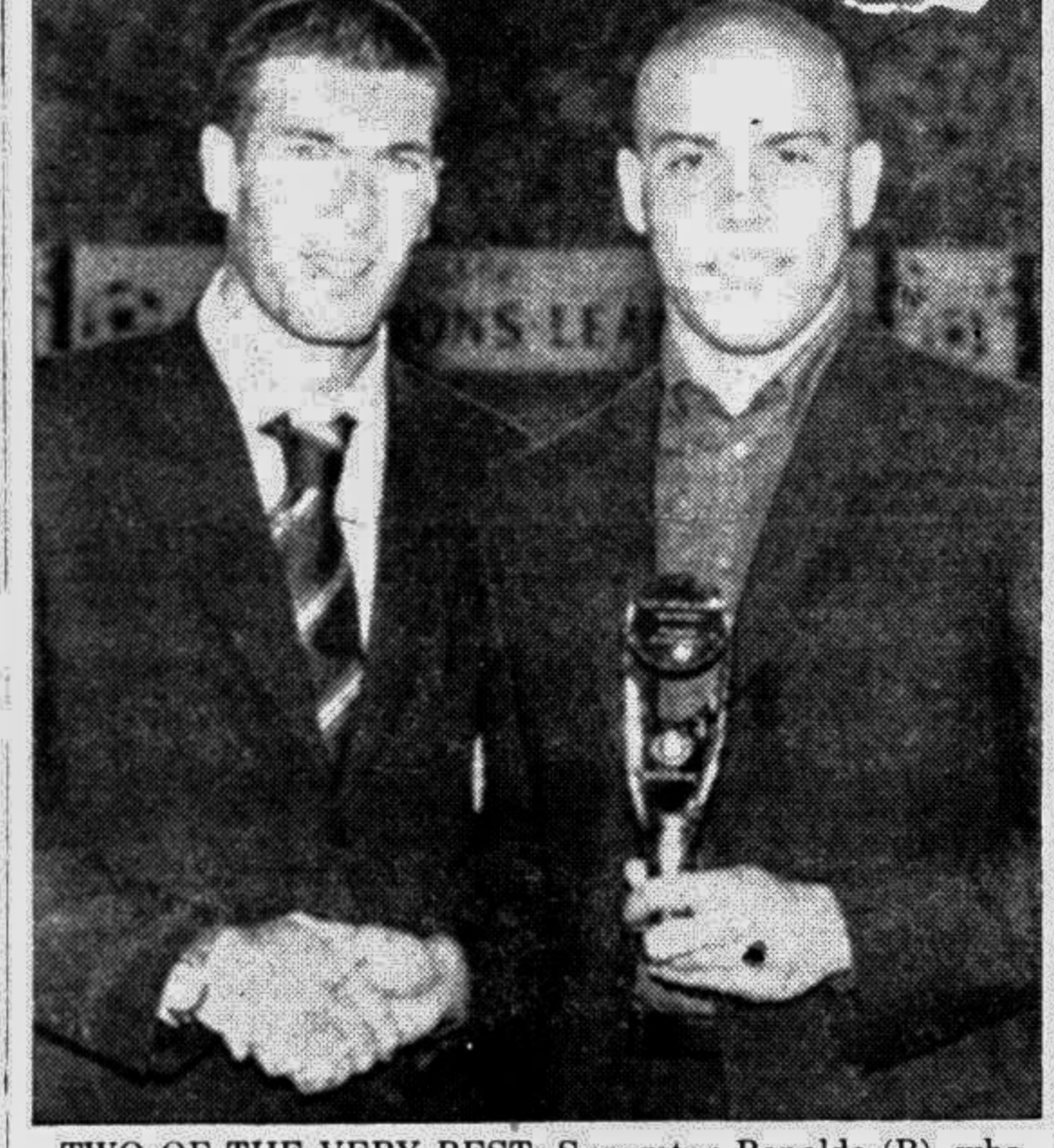
TWO OF THE VERY BEST: Superstar Ronaldo (R), who received the trophy for being European footballer-of-the-year for the 1997-98 season, shakes hands with French star Zinedine Zidane who was declared the best midfielder of the same season, at Monaco on August 27.