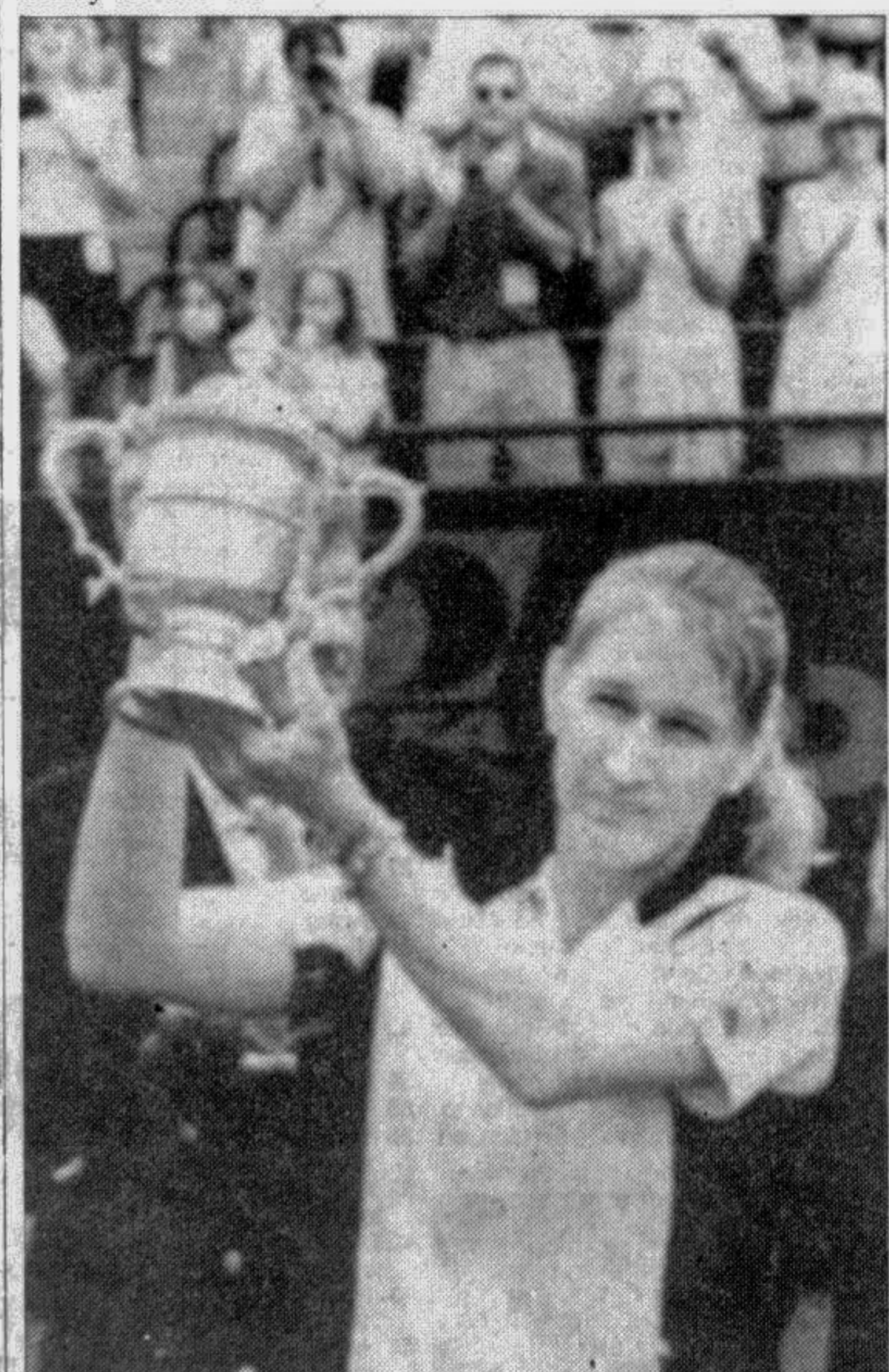
SOMETHING TO CHEER ABOUT AT LAST: Former world No 1 Steffi Graf of Germany holds aloft the Pilot Pen championship trophy after her win in the final against Jana Novotna of the Czech Republic at New Haven on August 29. Graf won 6-4, 6-1.

her triumph on the basis of her first set performance alone. "I was very tired from playing night matches and a lot of tennis this week," said Novotna, who played doubles until after 10 pm the night before the final. "With her you have to be 100 per cent sharp. Steffi was on top of her game." "The way she played today, I think she is just there she was when she stopped playing. Now the point will be if she can do it from one week to another, how long she can keep it up." There were virtually no flaws in Graf's game. She moved like a well-oiled machine and struck both her forehand and backhand with precision. Second seeded Novotna matched her in most areas, and made many well-timed approaches to the net. But once she had dropped the first set her challenge fell away dramatically. Graf broke on lead the first set 3-1. Novotna broke for 2-3 and Graf re-established her lead in the next game to go ahead 4-2 but serving at 5-3, she was beaten by a forehand pass as Novotna earned a reprieve. Graf's response to that was to break Novotna to love for the set, and the Czech claimed only two points in the first three games of the second set before asking for a toilet break. It made no difference. She returned as lethargic as before and claimed only nine points in the set as Graf stroled to victory.