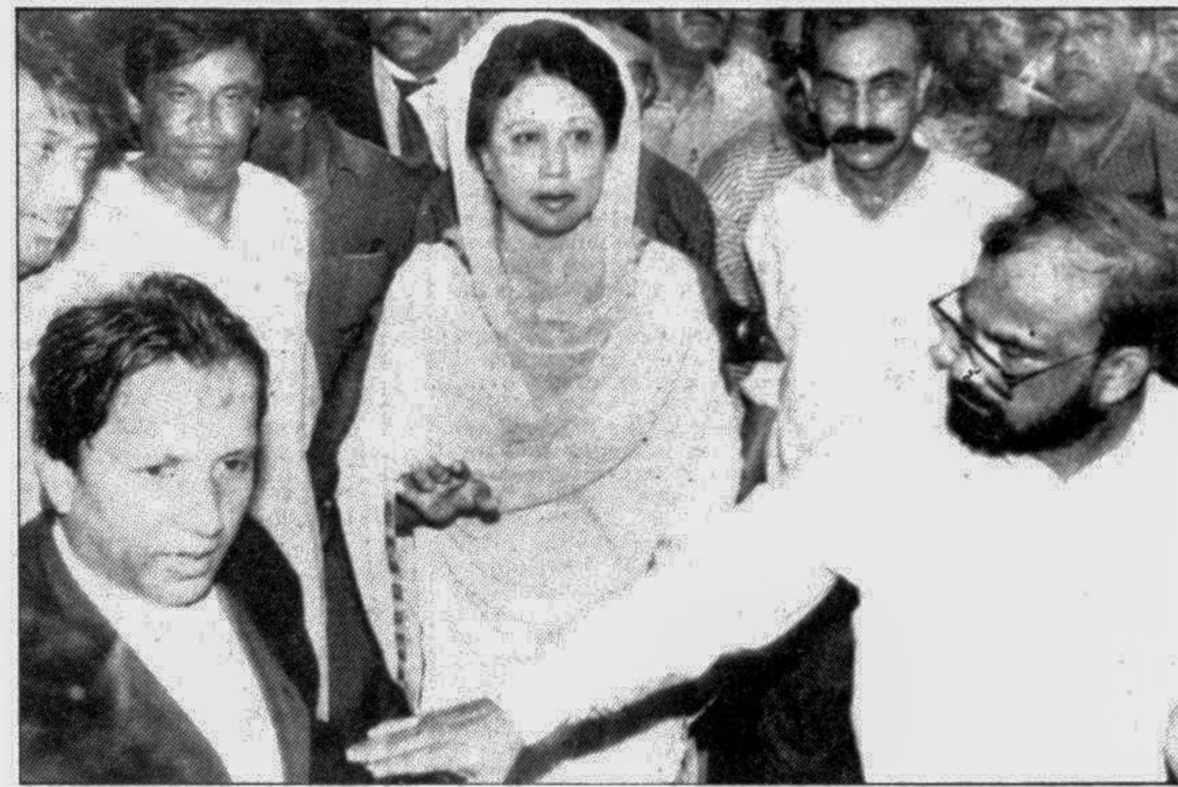
BNP chairperson and Leader of the Opposition in Parliament Begum Khaleda Zia at the district court premises yesterday.