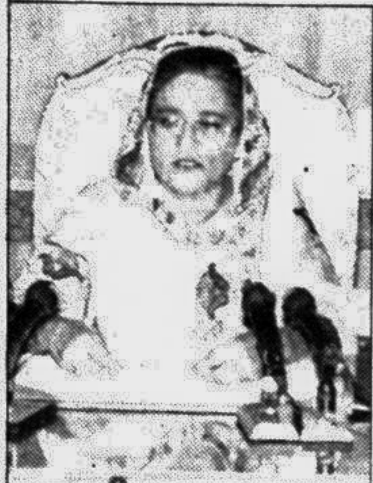
Prime Minister Sheikh Hasina addressing the nation yesterday.

Prime Minister Sheikh Hasina yesterday appealed to the nation to work unitedly for the flood-hit people "at this time of national distress," forgetting all differences, reports UNB.