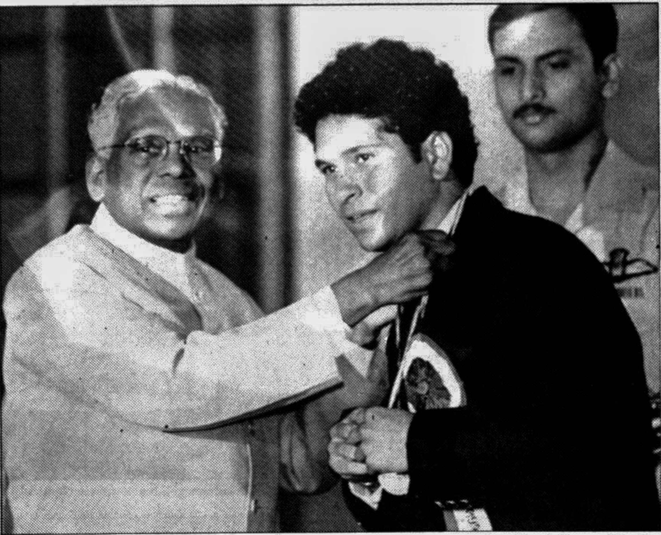
Indian President K R Narayanan decorating master batsman Sachin Tendulkar with the Rajiv Gandhi Khel Ratna Award at a ceremony at the presidential palace in New Delhi yesterday.