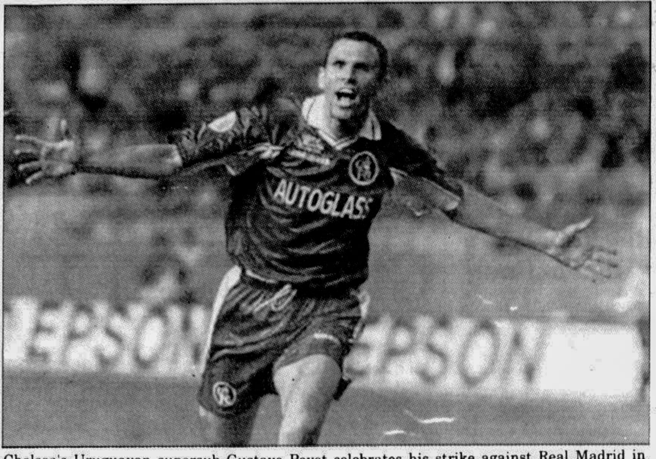
Chelsea's Uruguayan supersub Gustavo Poyet celebrates his strike against Real Madrid in the European Super Cup final in Monaco on August 28. The London team won on Poyet's goal.