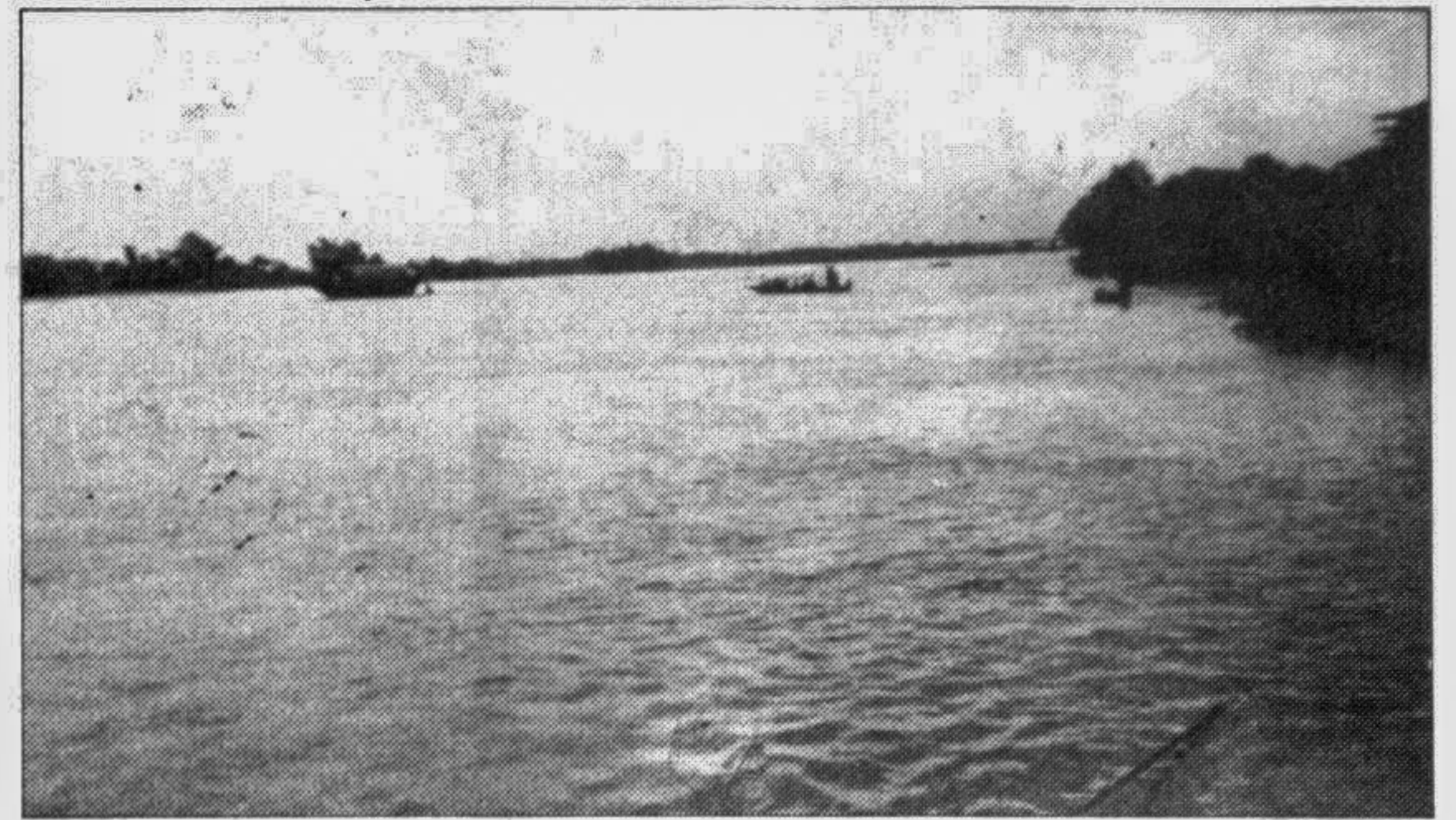
A view of an inundated village in Fenchuganj thana.