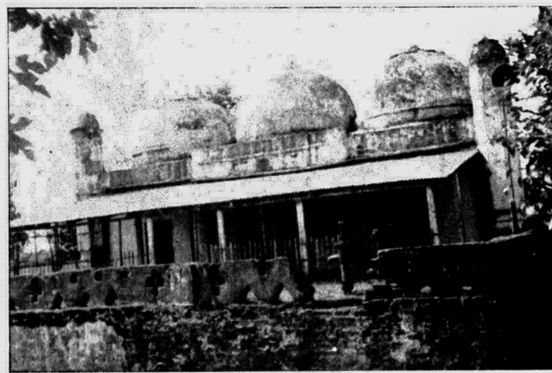
RANGPUR: Front view of "Nidaria Jam-e-Mosque".

People further demanded to take action for restoration of the 800 acres of wakf land taken away by some local so called influential guys.