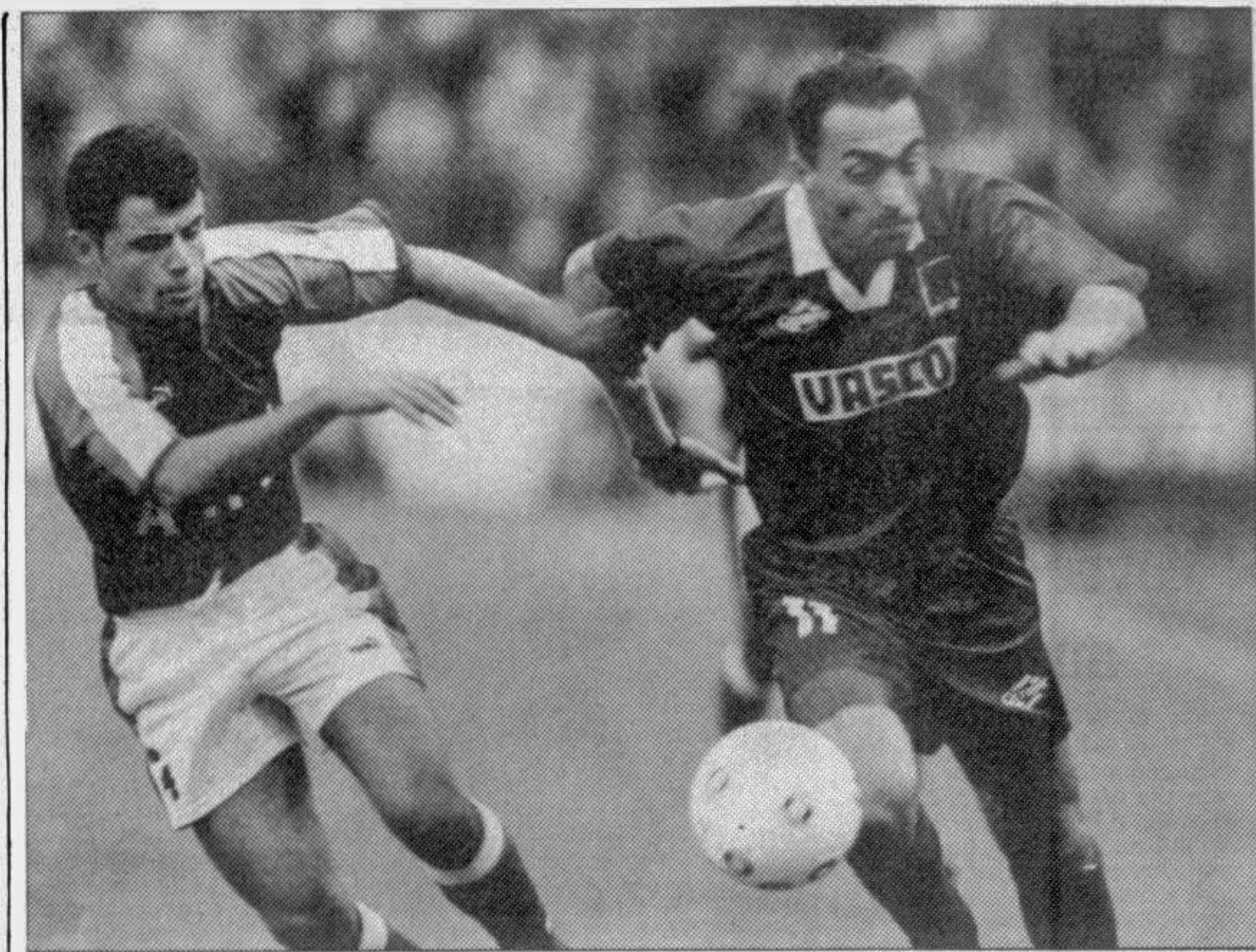
Action from the European Cup Winners' Cup qualifying second leg match between KRC Genk and FK Apolonia at Genk, Belgium on August 27.