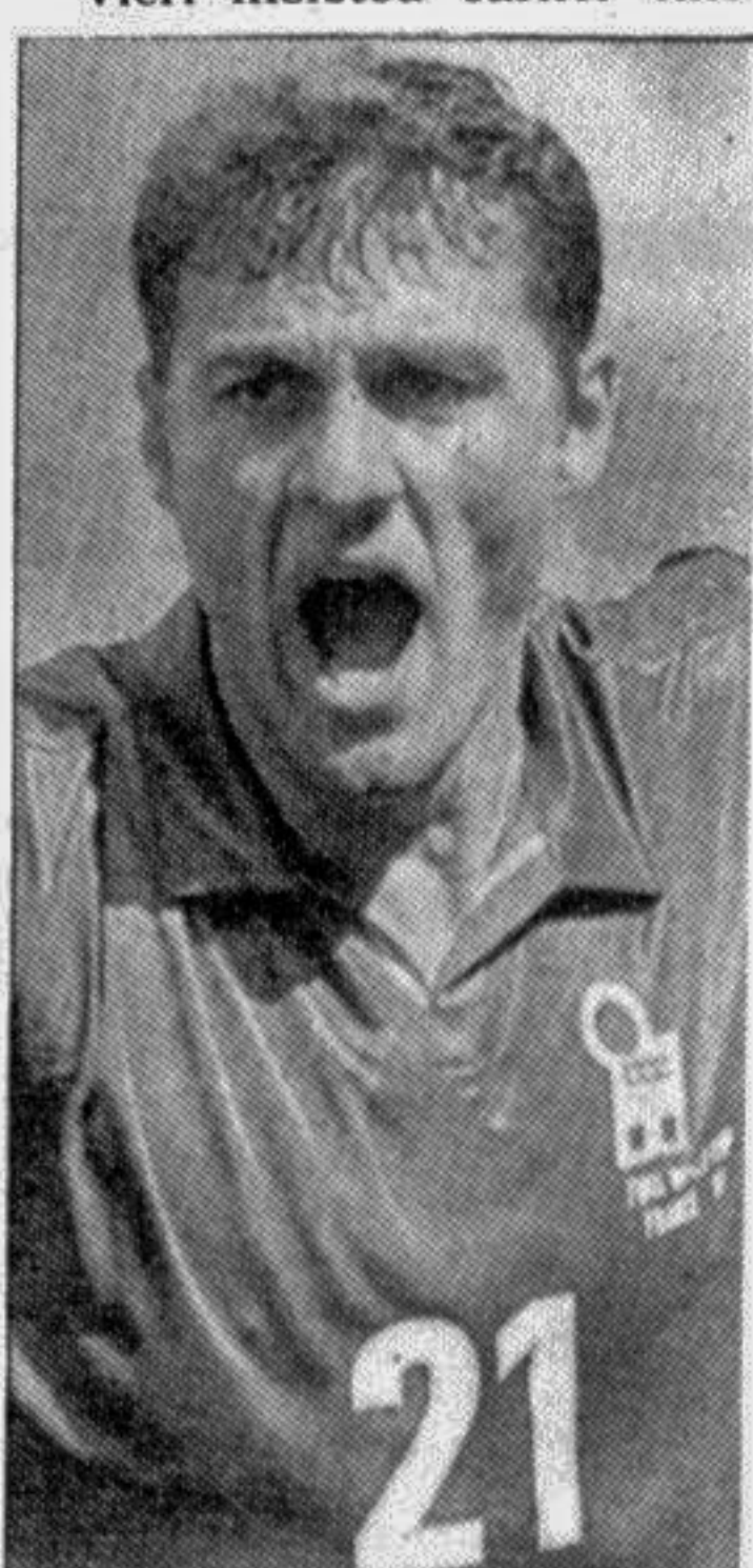
CHRISTIAN VIERI week that he intended to stay at Atletico and work out his difference with Sacchi. But Vieri, who scored 24 goals in Spain last season followed by a five-goal haul in the

World Cup, has been forced to train with the second team over the past few days and it now appears Sacchi has been true to his word.