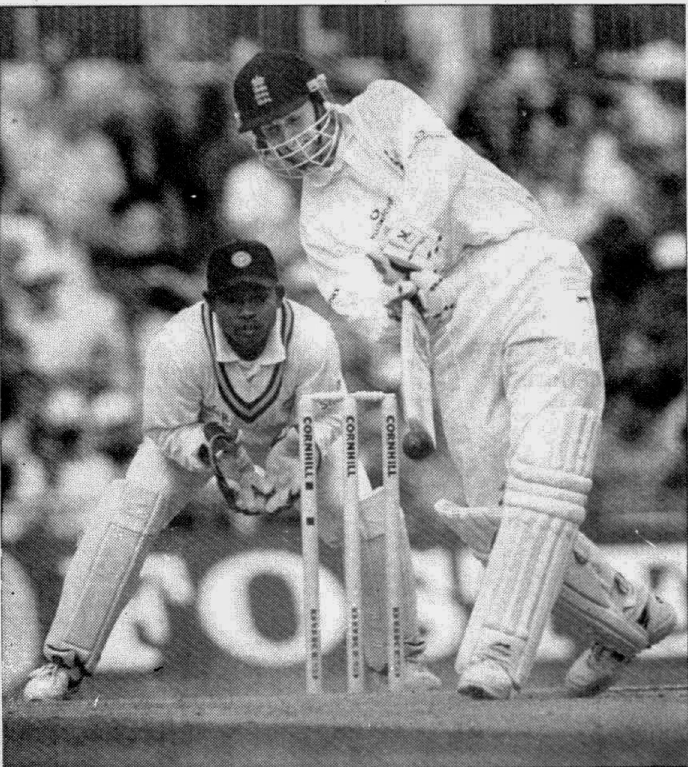
CRAWLEY COMES GOOD: England batsman John Crawley tries to play one towards the on-side during his superb unbeaten 156 in the one-off Test against Sri Lanka at The Oval yesterday.