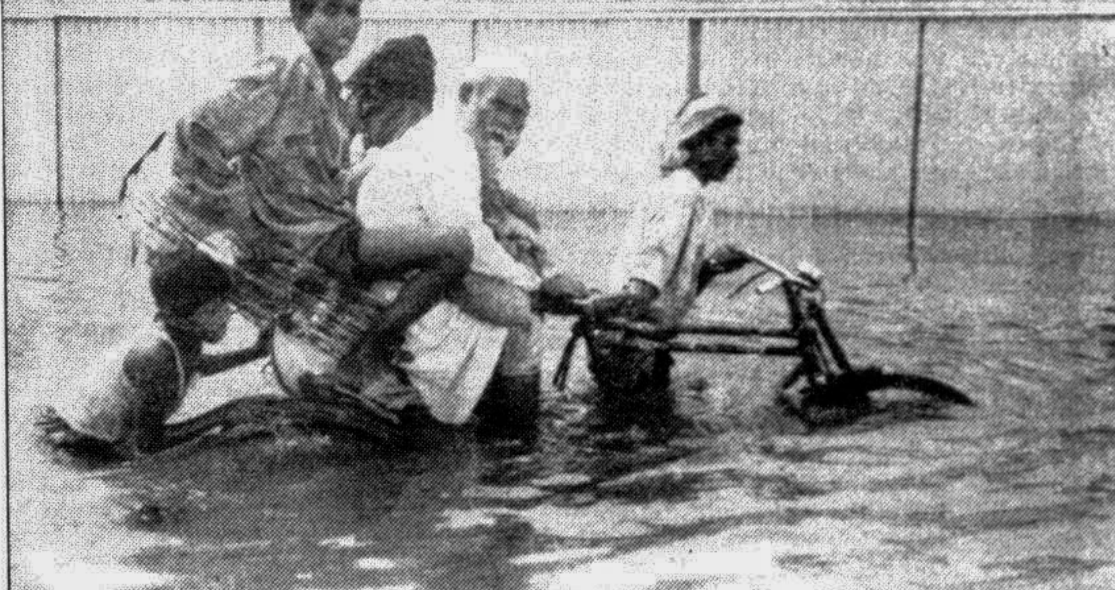
FLOOD WATER EVERYWHERE: Pictures taken by The Daily Star photographer show boat carrying people on the road in front of Bangladesh Red Crescent Society Headquarters in city (top) and Tongi-Ghorashal road submerged by knee-deep water.