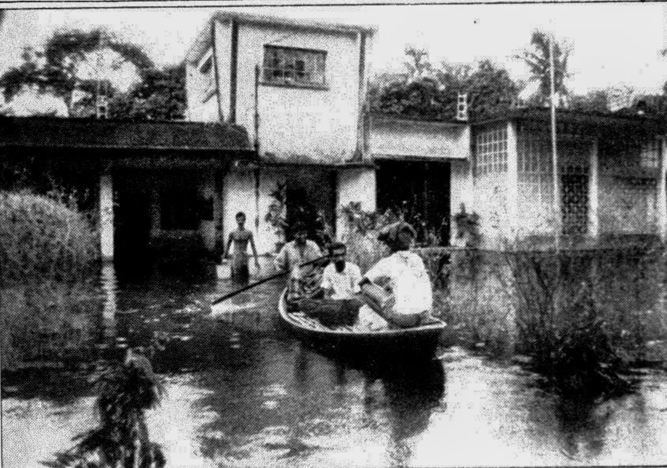
FLOOD WATER EVERYWHERE: Pictures taken by The Daily Star photographer show boat carrying people on the road in front of Bangladesh Red Crescent Society Headquarters in city (top) and Tongi-Ghorashal road submerged by knee-deep water.

Mayaroon belongs to Hettimganj village under Golapanj thana of Sylhet district. A general diary was lodged with Motijheel police on Thursday.