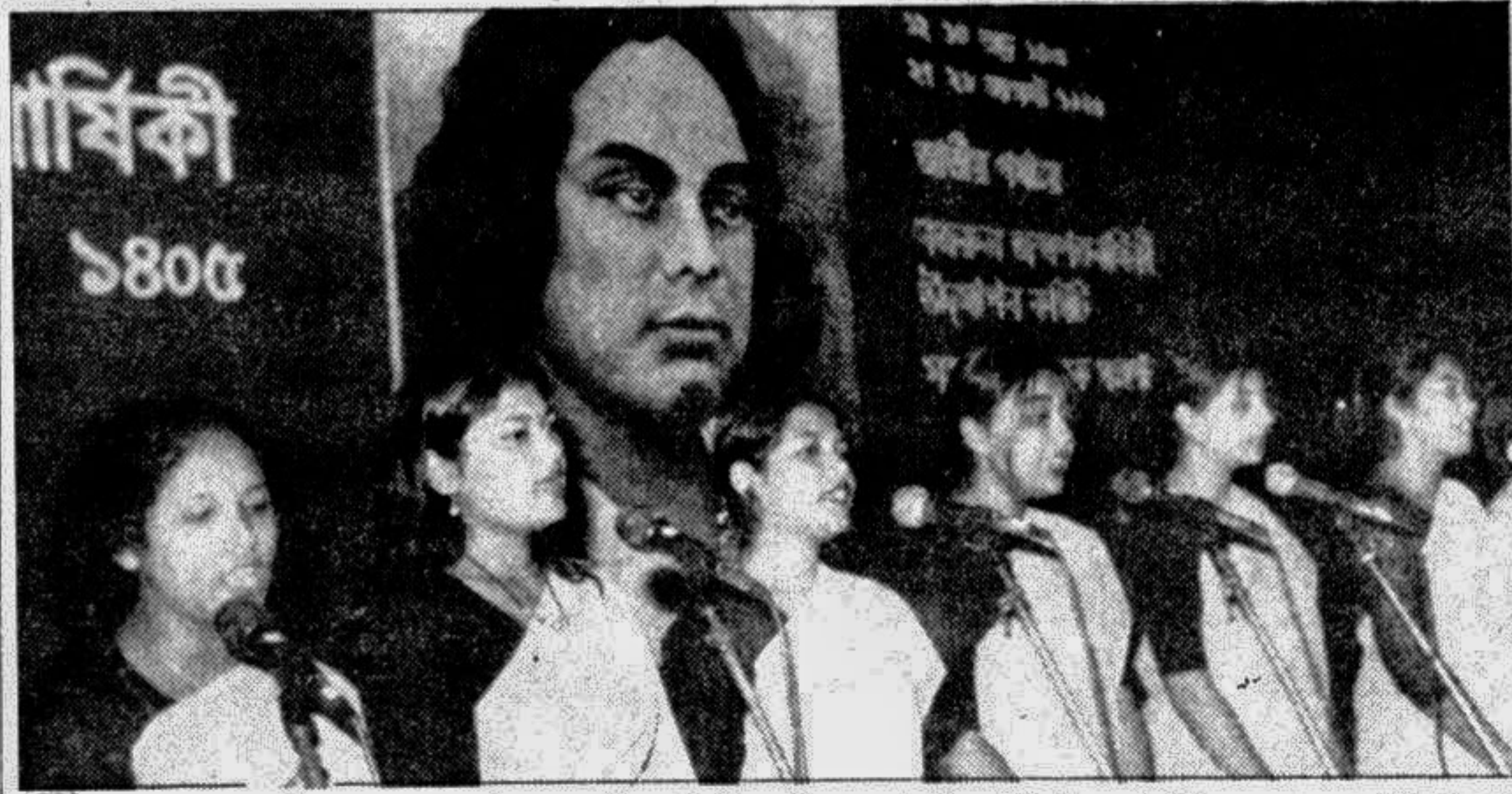
Artistes presenting song at a cultural function at the National Museum auditorium yesterday to mark the 22nd death anniversary of National Poet Kazi Nazrul Islam jointly organised by Nazrul Birth Centenary Observation Committee and the Ministry of Cultural Affairs.

"We've taken steps to ensure a better life for the people, we're fighting to remove all their miseries," she said and urged everybody to work for building a happy and prosperous 'Sonar Bangla'.