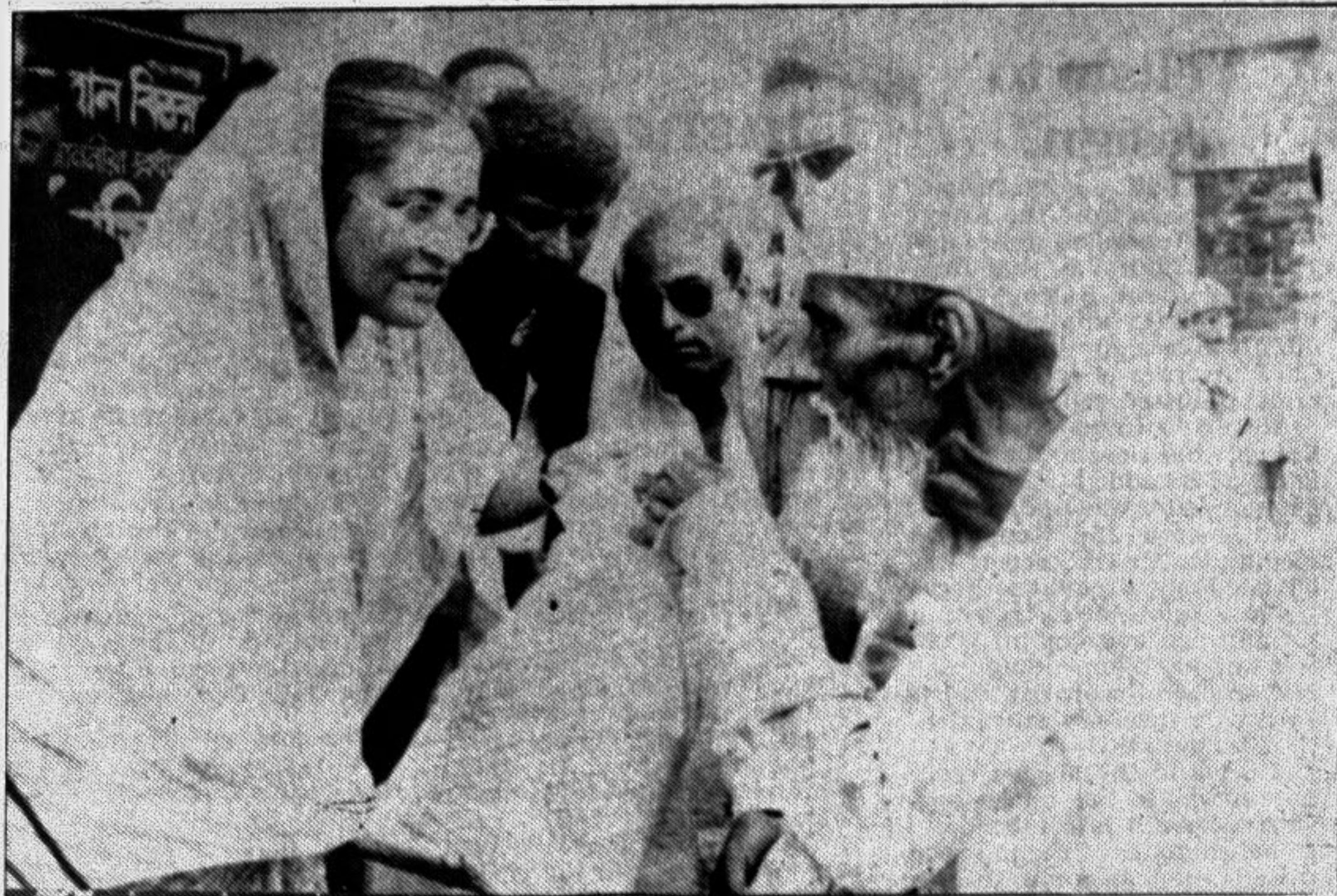
Prime Minister Sheikh Hasina distributed relief materials among the flood victims in Bramhanbaria on Thursday.