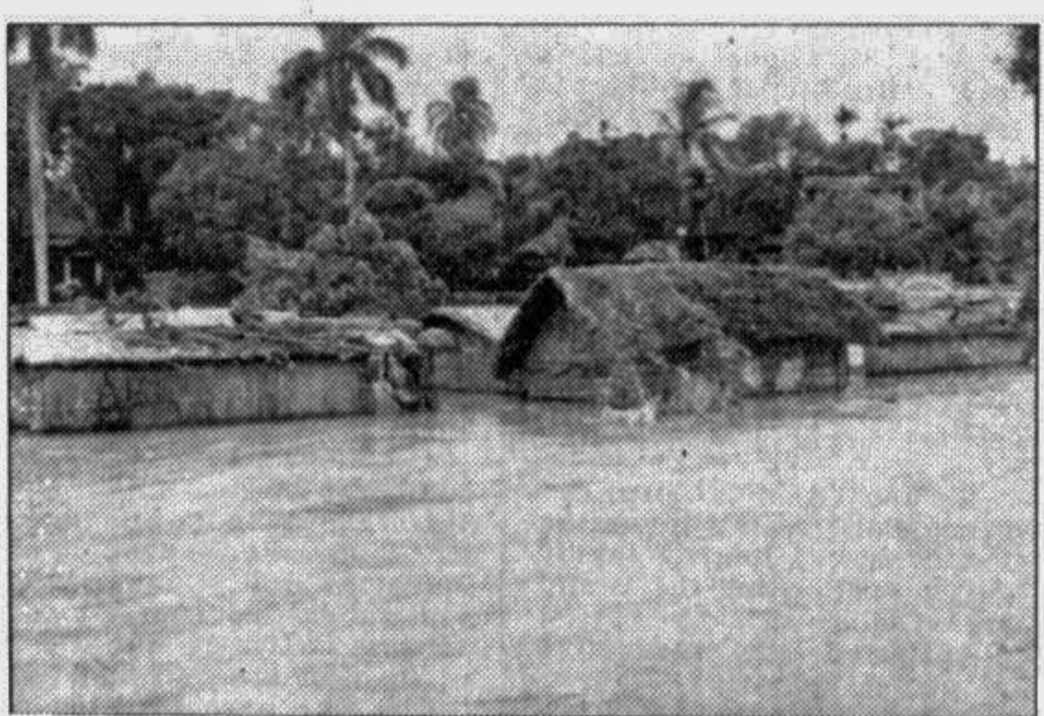
MYMENSINGH: A flood-affected area of Sadar thana. (Right) Two women returning to their flood-hit houses by a raft.