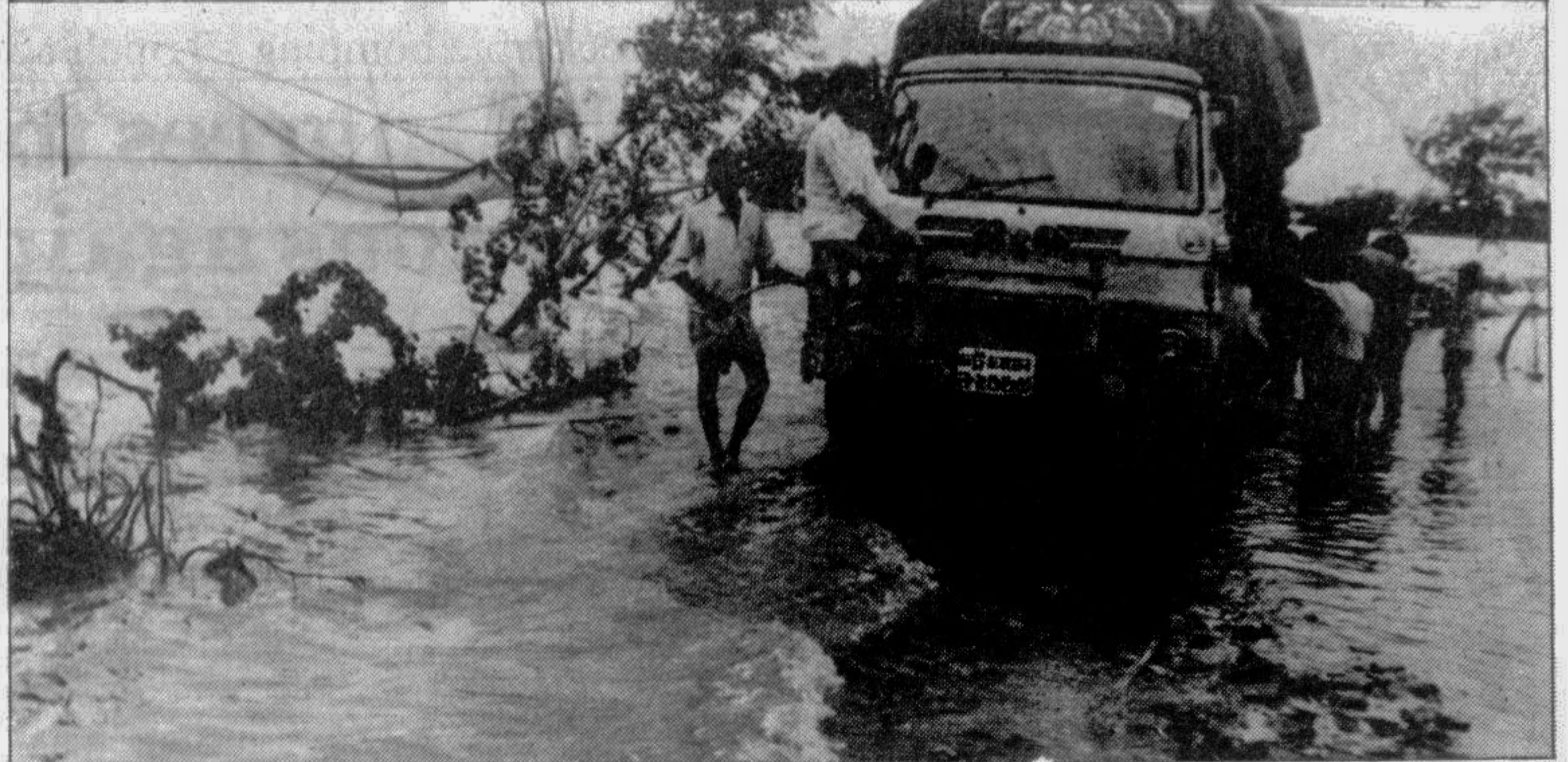
Relentless rains and onrush of waters from upstream pushed the Meghna River over its banks, inundating Dhaka-Sylhet road at many points that disrupted communication between places.