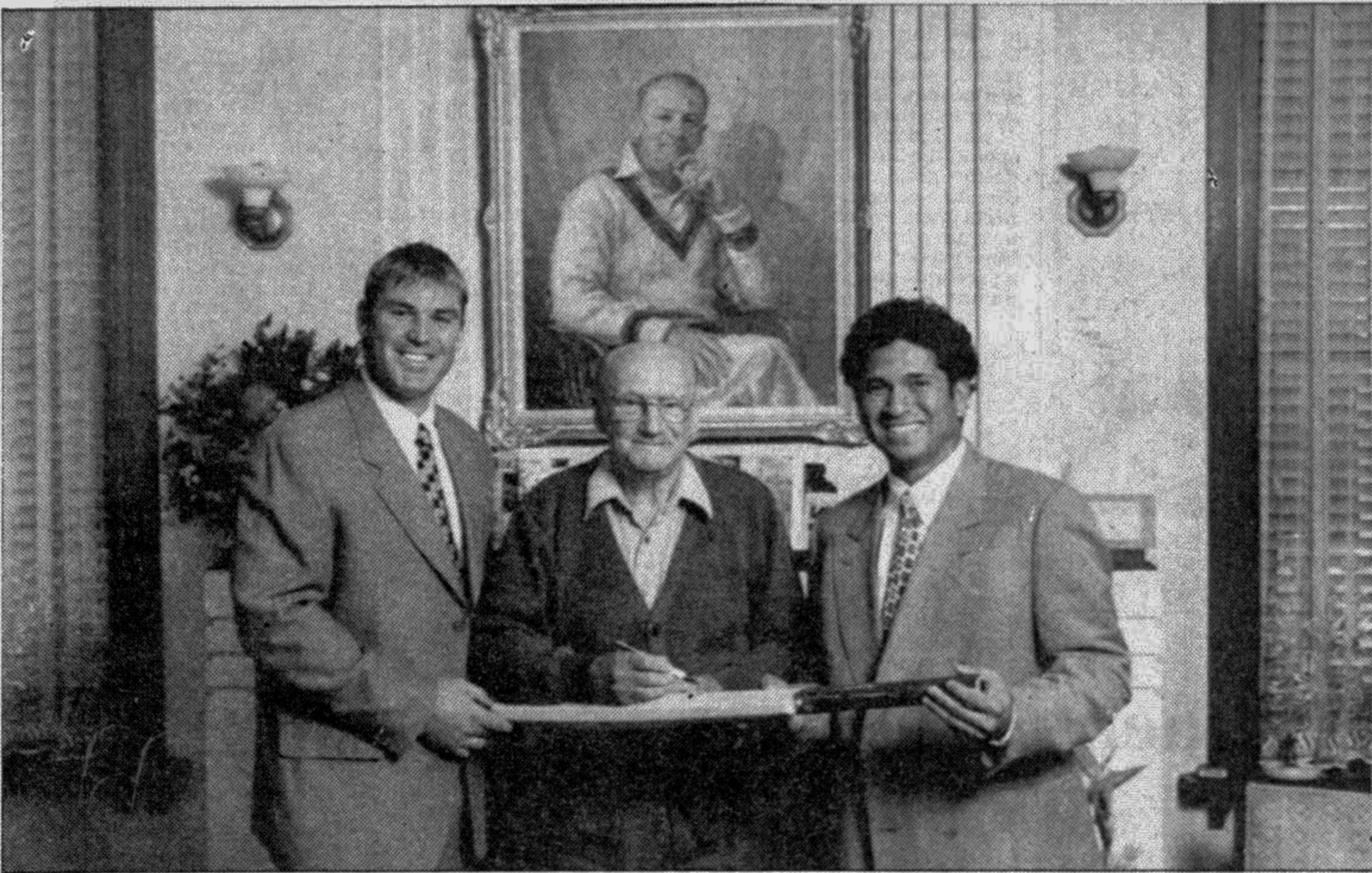
IN COMPANY OF THE GREATEST: Sir Donald Bradman (C), who was celebrating his 90th birthday spares some moments with modern cricket greats leg-spinner Shane Warne (L) and master bat Sachin Tendulkar at his Adelaide residence yesterday.

Interested teams have been requested to enlist their name with an entry fee of Tk 200 by Sept 15.