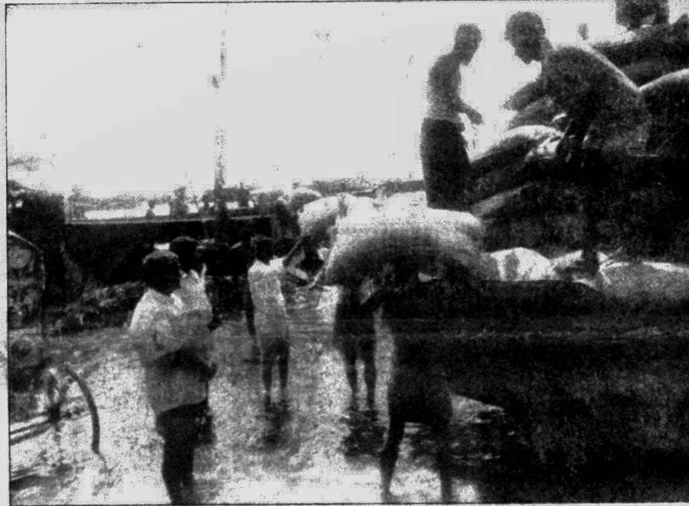
Foodgrains are being loaded in a boat from a truck at the Mill Barrack CSD ghat for sending those to flood-affected areas. The ghat has already been submerged.

The government has decided to import six lakh tonnes of foodgrains to offset the shortfall due to massive damage of crops by the floods, sweeping the country for more than six weeks, according to official sources. Half of the imports will be rice and the rest wheat which will beef up the stocks, now over seven lakh tonnes, the sources said. Another 13.8 lakh tonnes are expected from donors, which, together with the imports, are likely to replenish a possible shortfall of about 20 lakh tonnes of foodgrains in the current year. According to preliminary estimates, more than Tk 1400 crore worth of farm produce including rice have been damaged by the floods. Damages can go up when the full assessment will be available after the flood waters recede, agriculture officials said yesterday. Officials of the Agriculture Extension Department said, their estimates till mid-August showed that at least seven lakh tonnes of rice and about 250,000 tonnes of vegetables and other farm produce in See Page 12 Col 3