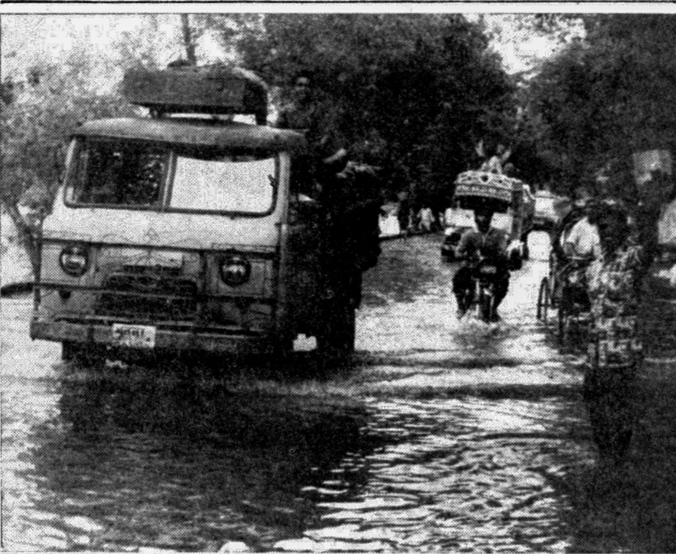
Dhaka-Narasingdi highway went under water at different points, causing disruption of traffic movement. This picture was taken from Sahepratrap Bazar area.

Number of ferries have also been reduced as some ferries have gone out of order. It has been alleged. The poor people cannot afford to buy medicine as the price is abnormally high in the local market, particularly in the rural areas.