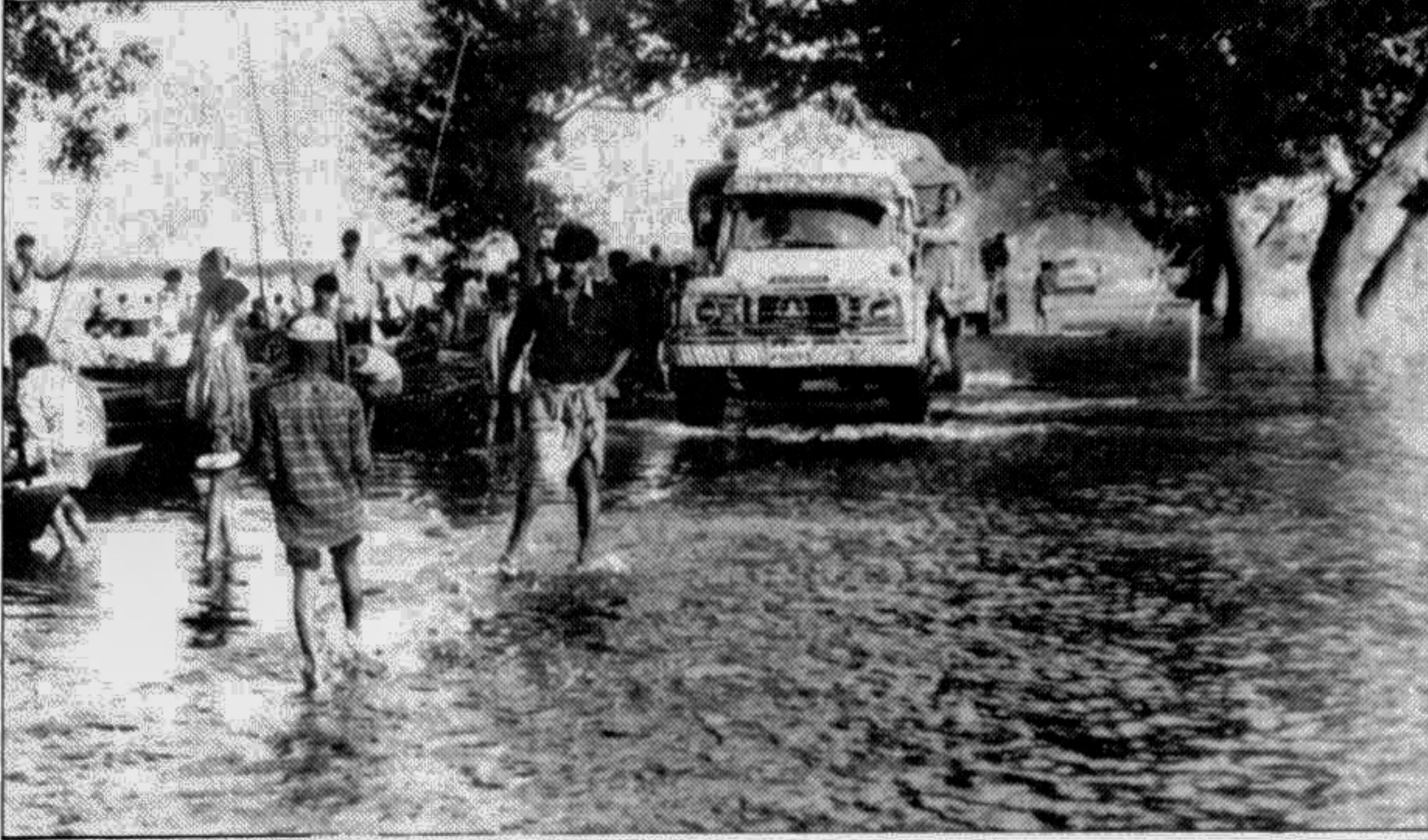
Flood waters overflowing Dhaka-Chittagong highway at Jingla in Sonargaon yesterday and (Right) trucks loaded with various goods stranded on the highway due to its inundation.

Talking to The Daily Star the BCL activists said they will stage another sit-in demonstration at Aparajito Bangla at 11:00 am today. They submitted a memorandum to the President and General Secretary of the central committee yesterday with the same demand. The BCL failed to announce a full-fledged committee for DU unit despite promising to do so earlier.