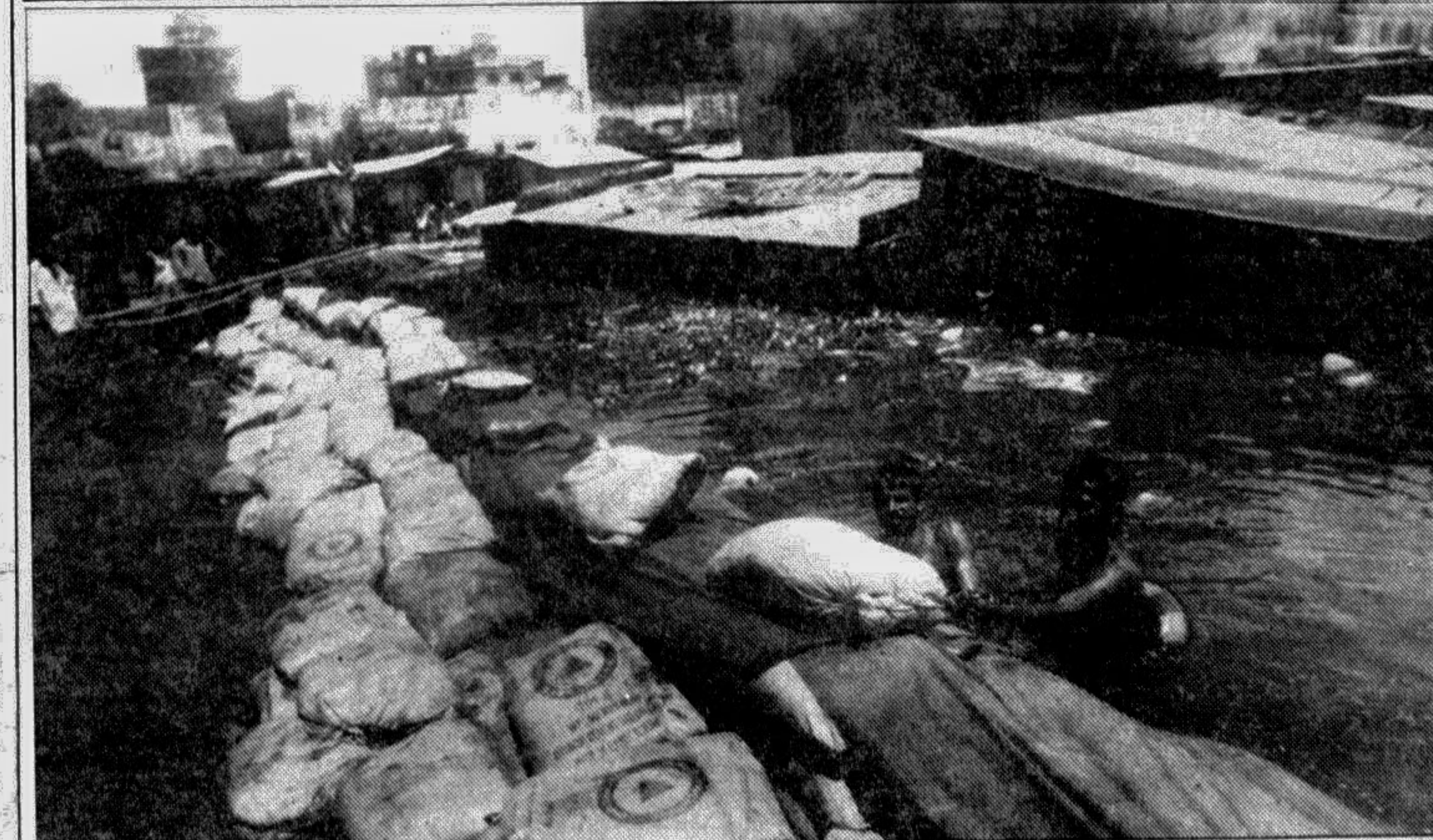
The residents at Lalbagh Fort area have set up a unique example of collective efforts by creating a barrier with own expenses to stop flood water entering into the locality.

Former President Abdur Rahman Biswas and Begum Biswas have condoled the death of Mahfuza Begum Mahbubunnesa, wife of former President of Supreme Court Aljibi Samity Khandakar Mahbubuddin Ahmed, reports UNB. In a message of condolence yesterday, they expressed deep shock at the death and prayed for salvation of the departed soul.