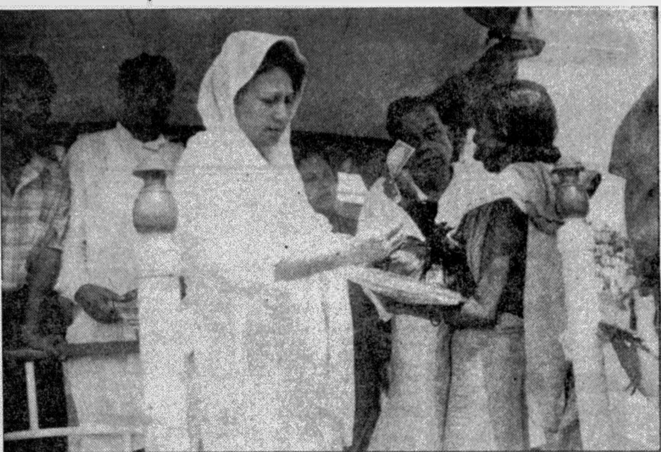
Leader of the opposition and BNP chairperson Begum Khaleida Zia distributing relief materials at Shibalaya thana under Manikganj district yesterday.