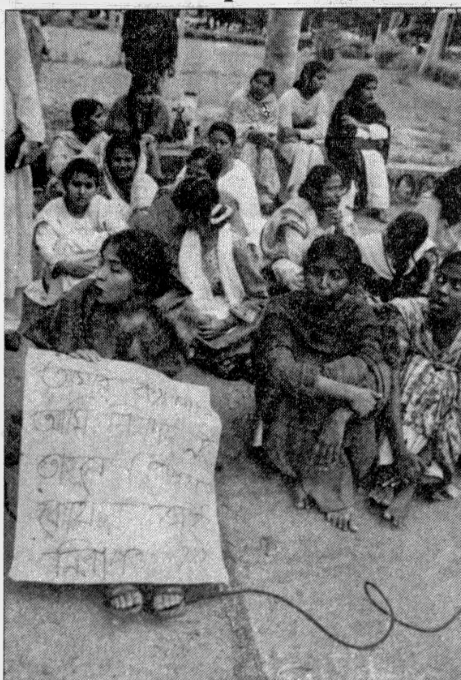
A group of female students of Dhaka University held a rally on the campus yesterday protesting alleged rape of three JU students.

The next meeting of the committee will be held on August 29 at the office of Dhaka Reporters' Unity.