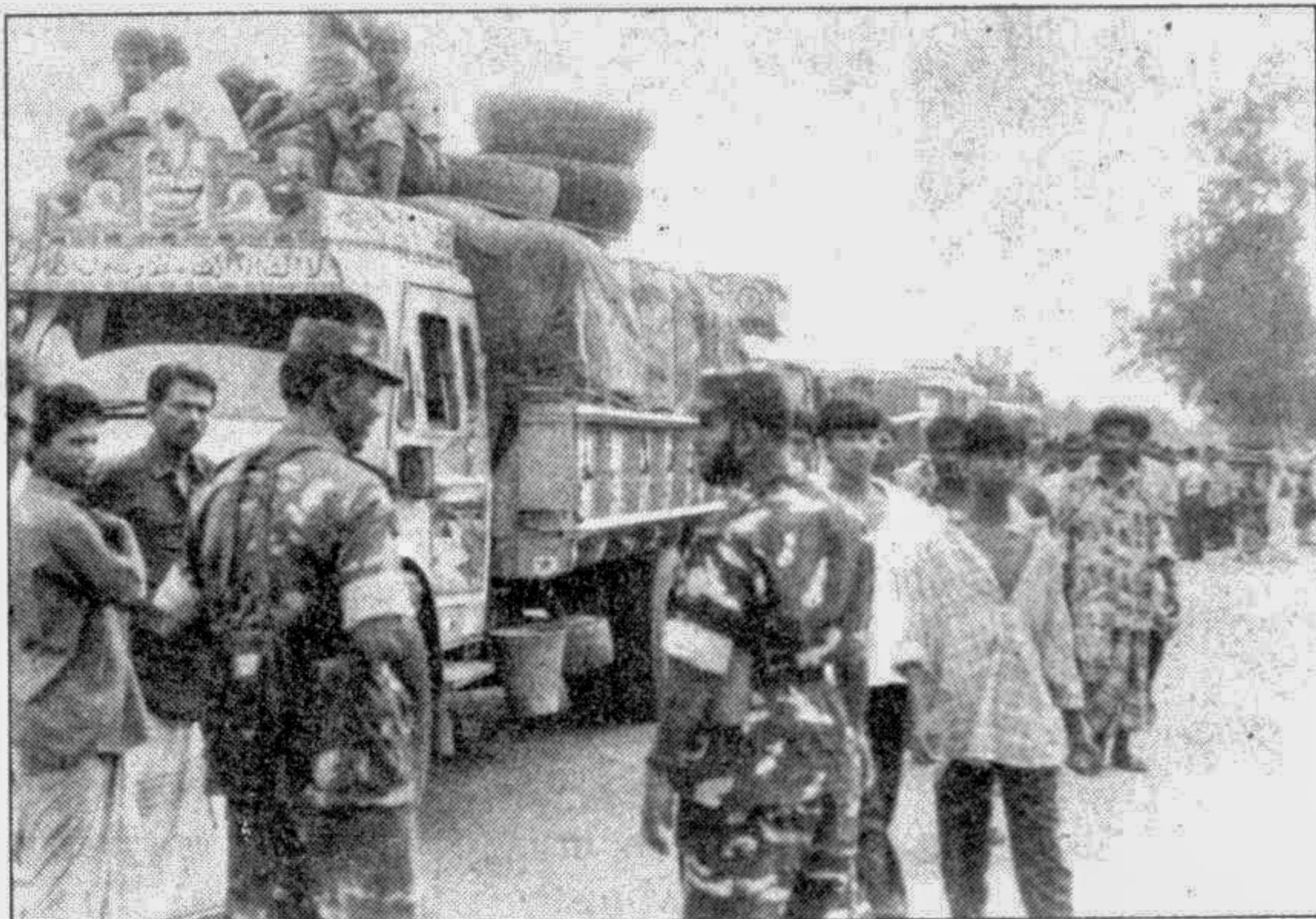
Army personnel were sent to clear a traffic jam near Sonargaon on the Dhaka-Chittagong highway yesterday after some portions of the road went under waist deep flood waters (left) and stranded passengers at Kanchpur trying to avail boats to go to their destinations.