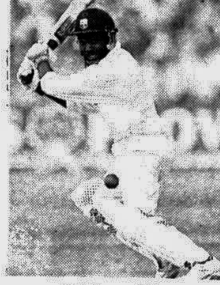
LARA ... 158

for 154 off 157 deliveries. Hooper hit three sixes and 19 fours as his side reached 323 for seven in reply to 360.