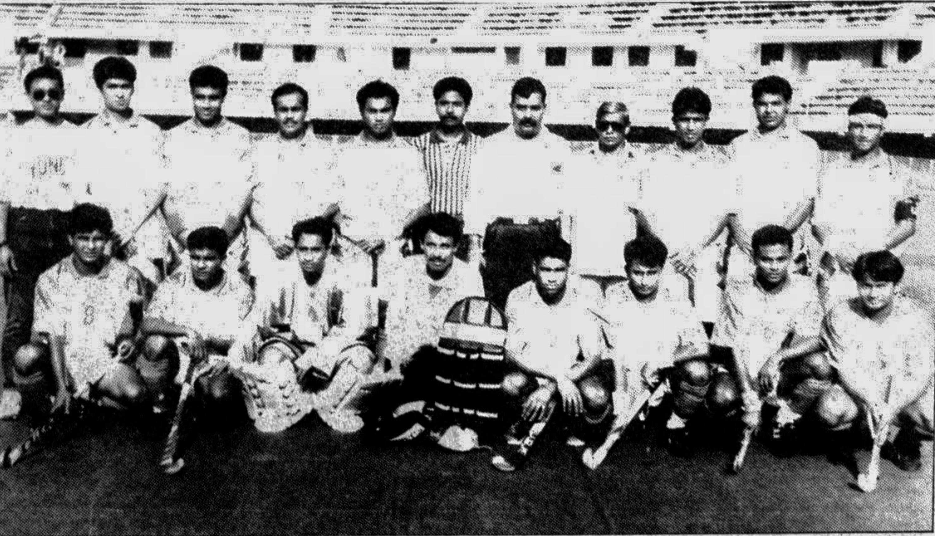
Players and officials of Usha Krira Chakra.