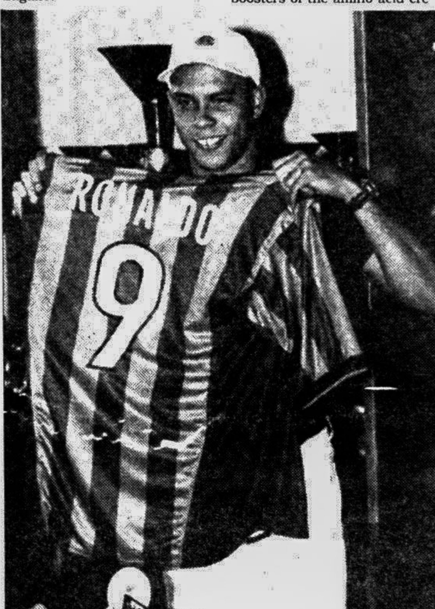
The most famous No 9 ready to roll: Ronaldo displays his no 9 Inter Milan jersey to mediamen during a news conference at the club's headquarters in Milan on August 20. The world-player-of-the-year returned to Italy on Thursday following a long vacation.

He said he had never taken boosters of the amino acid cre