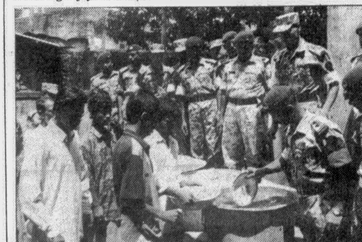
BDR distributed prepared food among the flood victims at the Hazaribagh relief camp on Thursday.