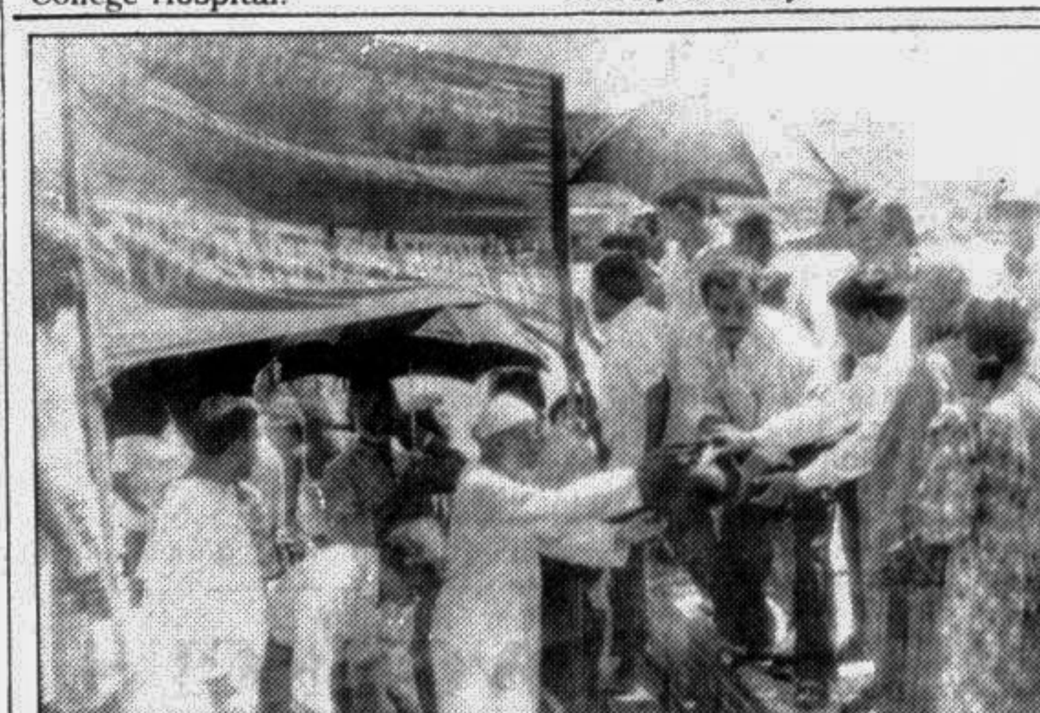
Bangladesh Wholesale Sugar Merchant Association distributed relief goods among the flood victims in Keraniganj yesterday.

Of the injured passengers, six were admitted to Sadar Hospital and 28 to Rangpur Medical College Hospital.