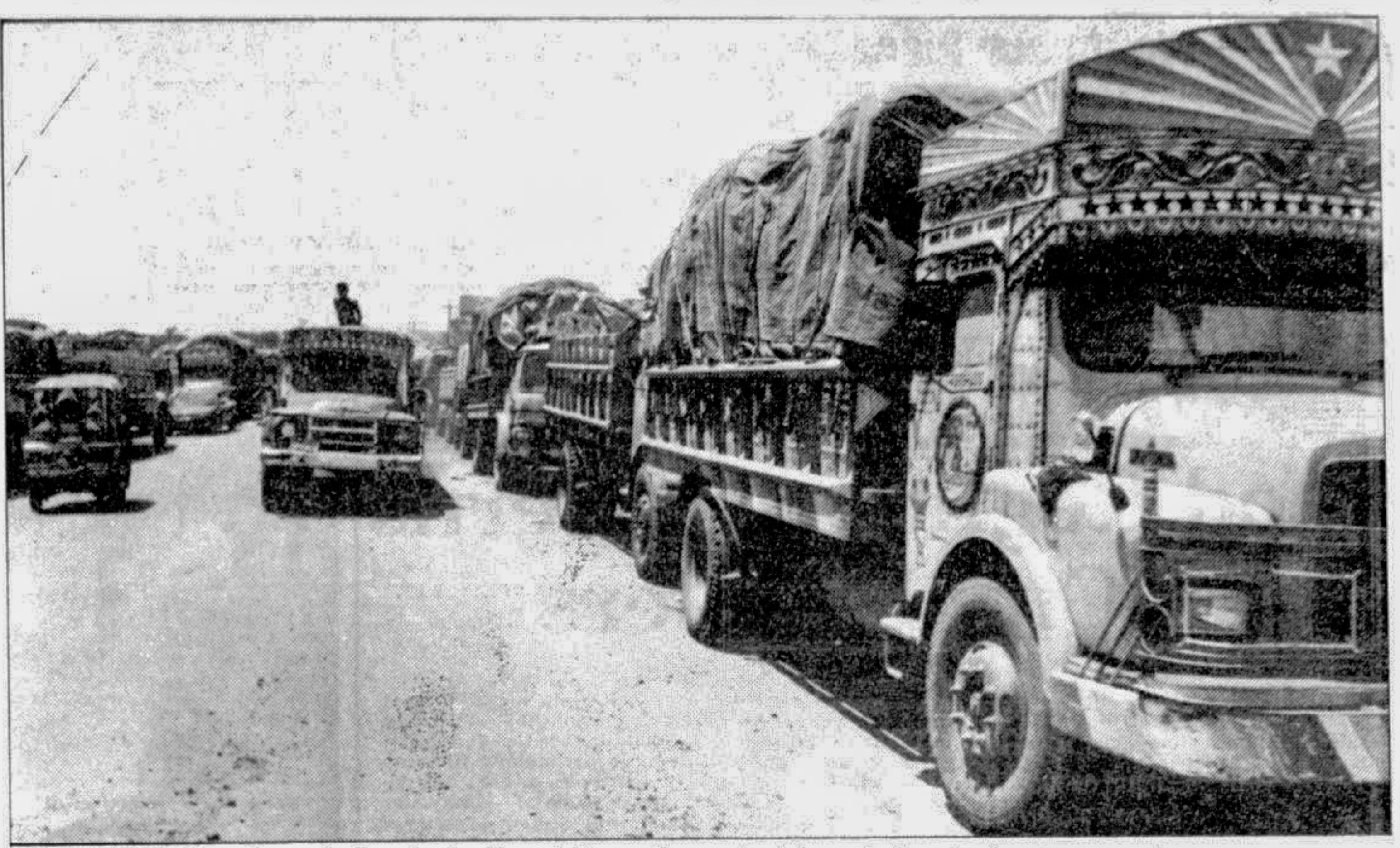
Long lines of trucks parked on both sides of the road near Aminbazar bridge in the city cause disruption of traffic movement.