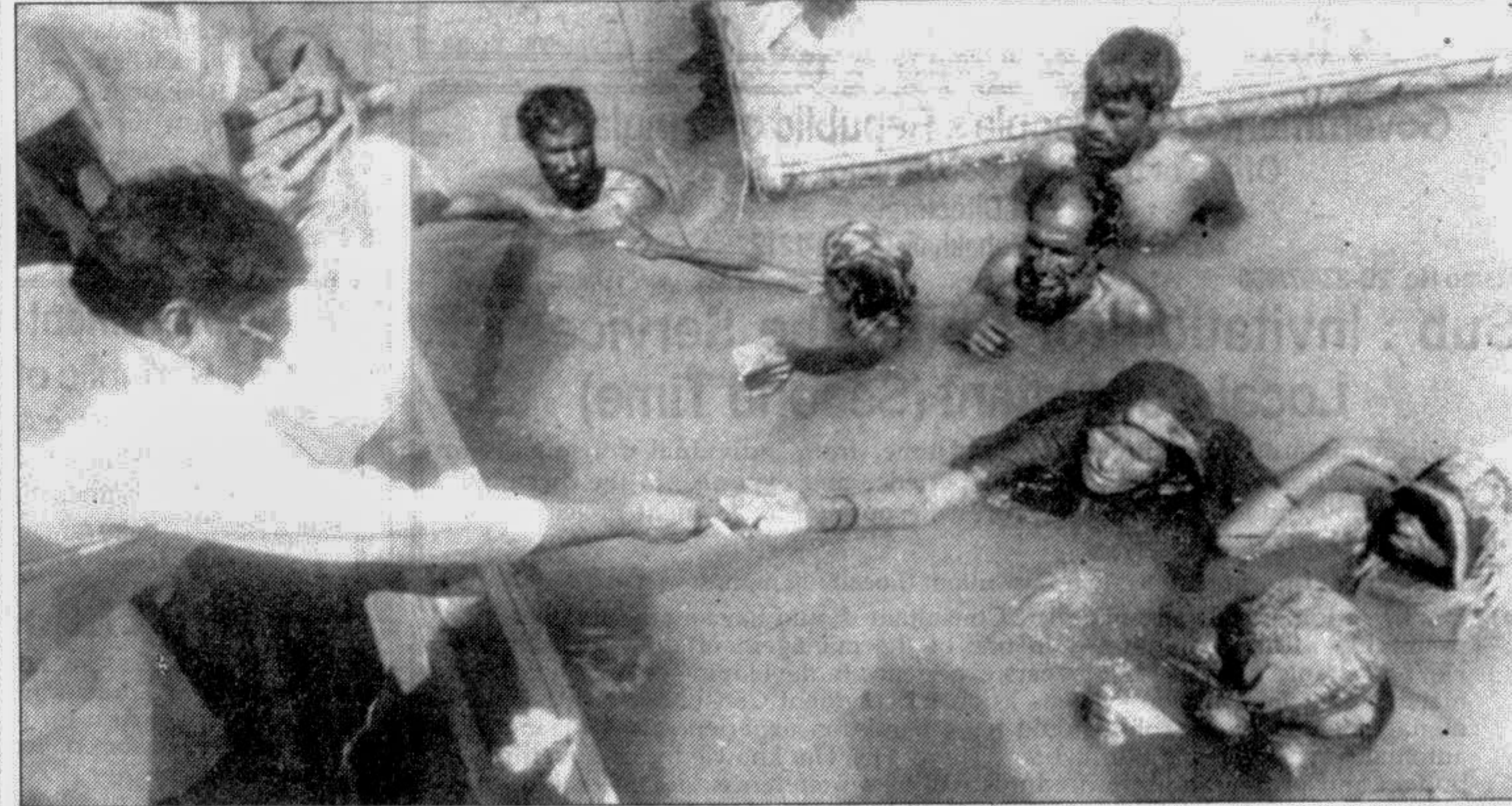
A HELPING HAND IN NEED : Flood victims at Kalma village under Louhajang thana in Munshiganj district receiving cash money in chest-deep water.