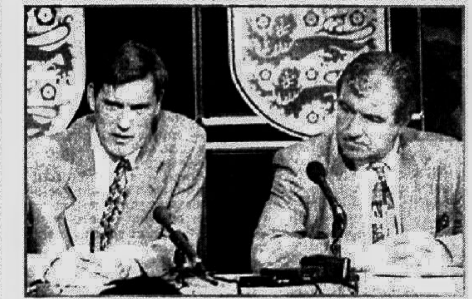
FRIENDS OR FOES? Glenn Hoddle (L) and Terry Venables.

In his role as World Cup pundit for ITV, Venables often expressed differing tactical opinions from Hoddle, and criticised his successor for leaving Paul Gascoigne out of the England squad.