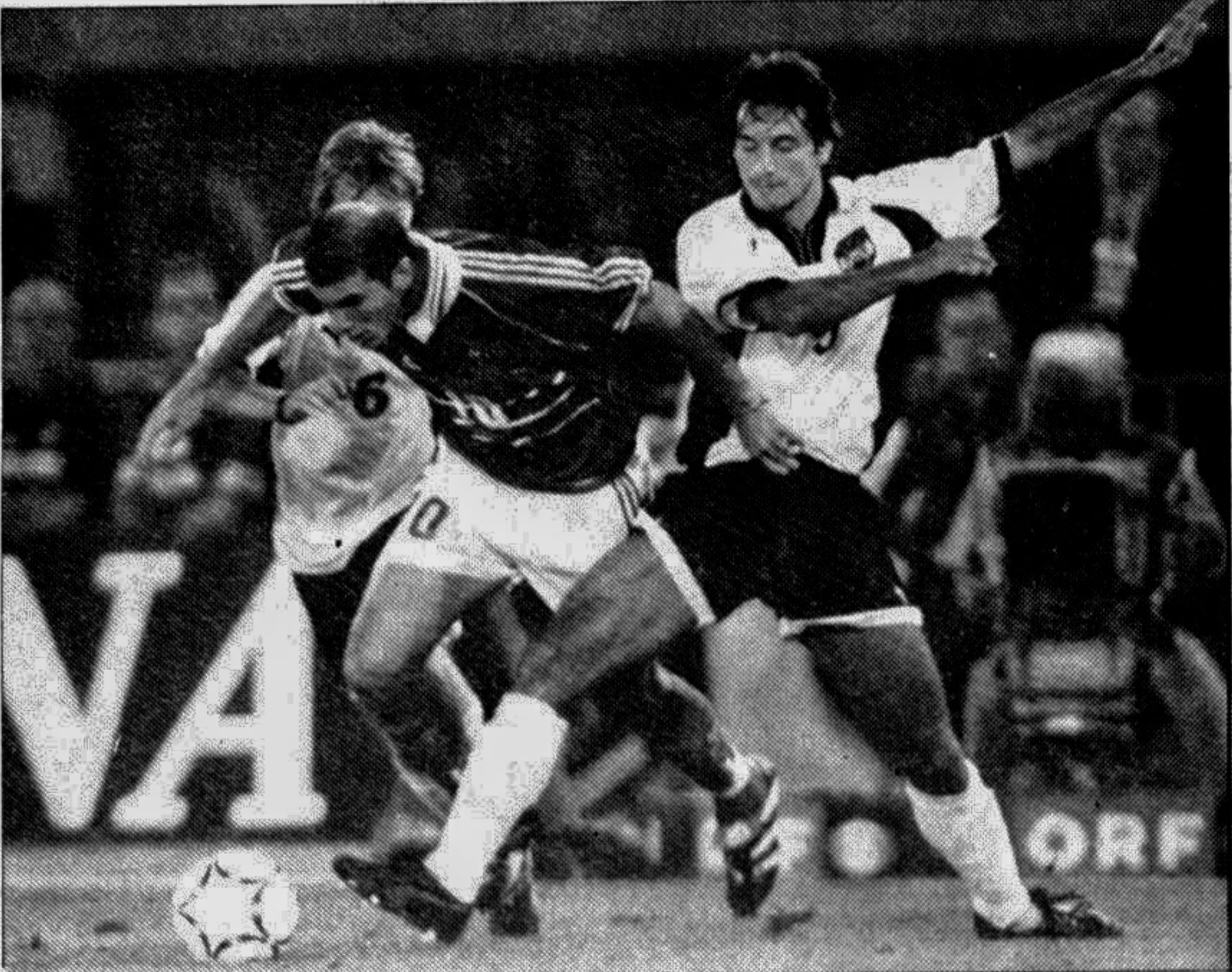
French midfield supremo Zinedine Zidane (C) tries to burst through two Austrian defenders during their friendly international at Vienna on August 19. The match ended 2-2.