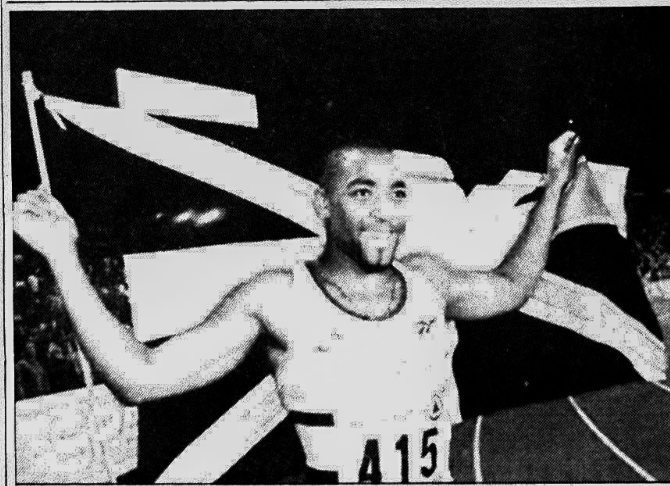
Britain's Darren Campbell, victor in the men's 100 metres at the Euro Athletics Championships, holds the Union Jack.