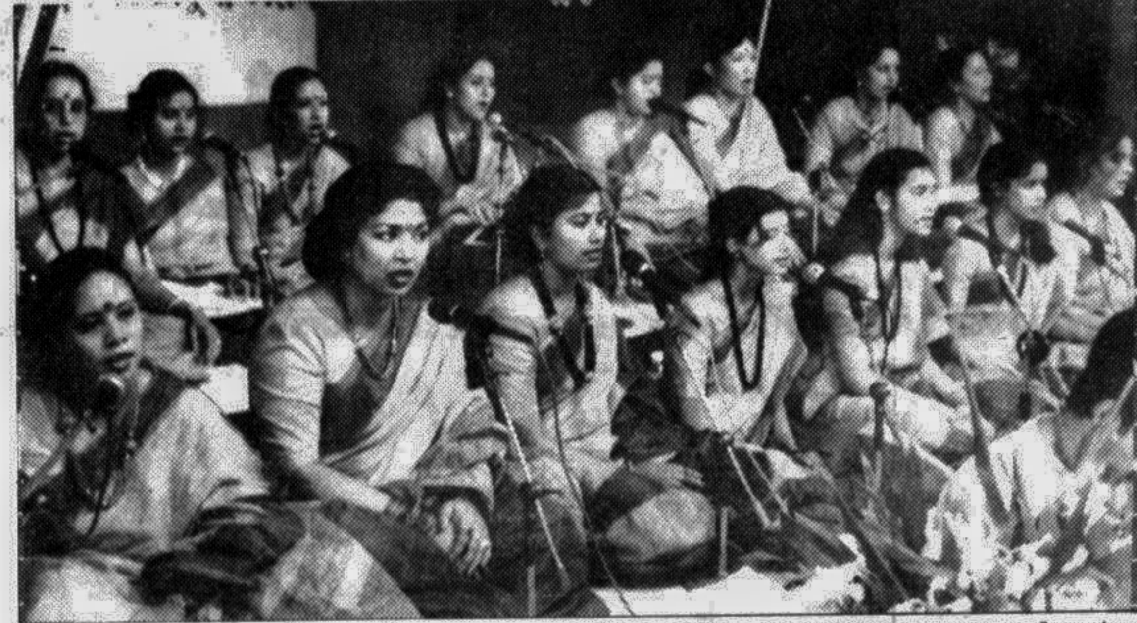
Members of Geetasudha, a Tagore song practice centre, rendering song at a function marking its second founding anniversary, held at the Public Library auditorium in the city.

The United States Agency for International Development (USAID) will provide an emergency assistance of up to Taka 1.23 crore (US $261,156) to the International Centre for Diarrhoeal Disease Research, Bangladesh (ICDDR,B), says a press release. The assistance is in response to the centre's proposal to USAID to take care of the large number of patients affected by diarrhoea and other water-borne diseases.