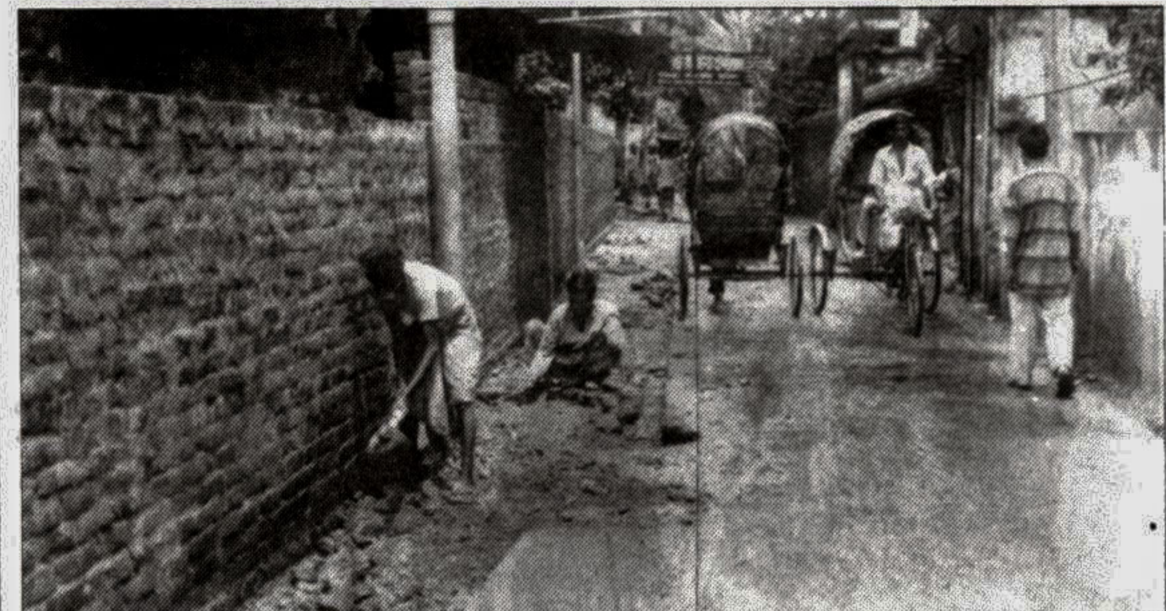
Madhubazar street in Dhanmondi being widened.