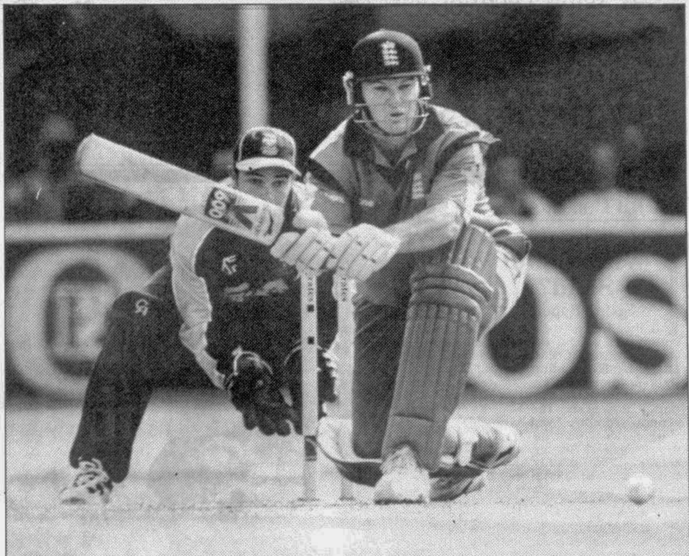
England's Graeme Hick prepares to sweep during the Emirates triangular tournament match against South Africa at Edgbaston on August 18.