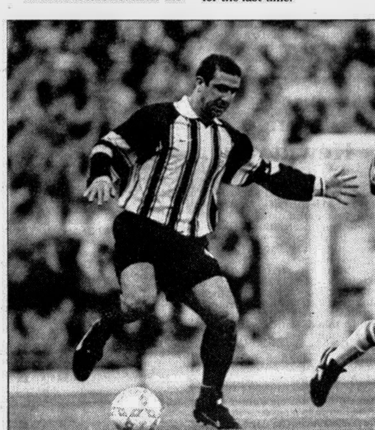
DOING WHAT HE DOES BEST: Eric Cantona (L) the French maverick, shows off a bit of old magic while former Manchester United teammate Ryan Giggs watches with admiration during a memorial match at Old Trafford on August 18.