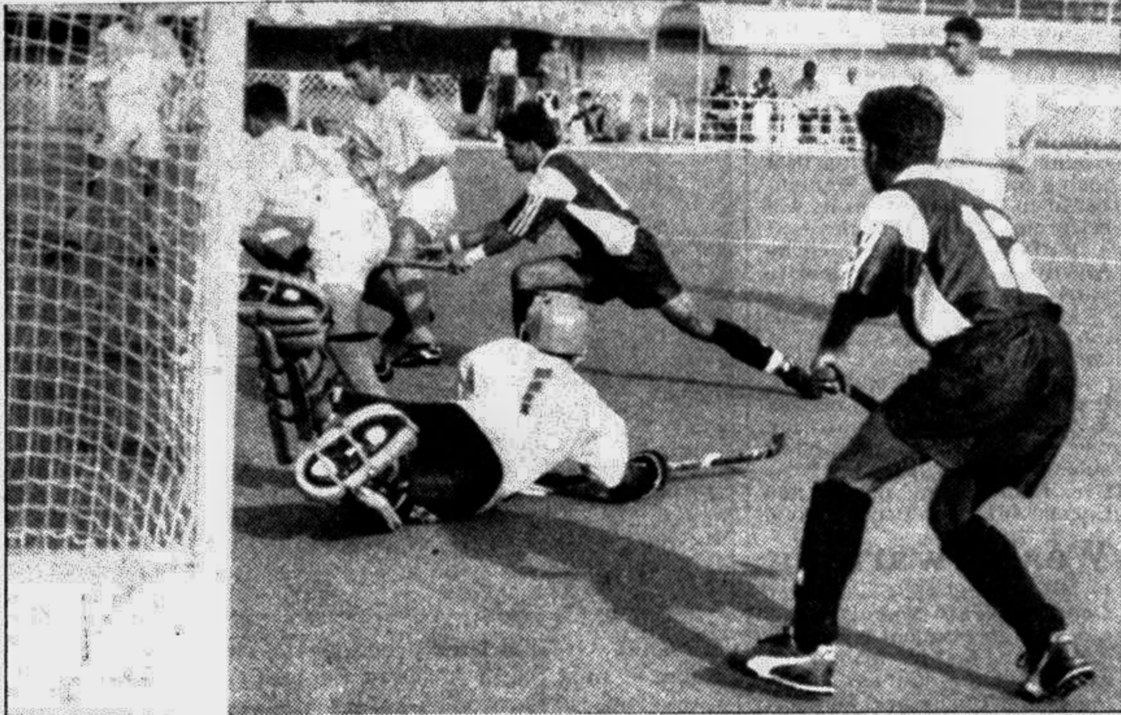
Goalmouth action during the Mohammedan-Ajax semifinal of Club Cup hockey tournament at the Moulana Bhasani Stadium yesterday.

BJMC, Bangladesh Ansars, Rajbari and Pabna advanced to the semifinals of the national women's volleyball championship eliminating their rivals in the quarterfinals at Mirpur Shaheed Suhrawardy National Indoor Stadium yesterday, reports UNB. BJMC will take on Rajbari at 2:30 pm in the first semifinal while Ansars will face Pabna at 4 pm on Thursday. In the quarterfinals, Pabna beat Rangpur 15-5, 15-8, 15-9, BJMC defeated Dinajpur 15-2, 15-3, 15-3, Ansars overpowered Khulna 15-5, 15-6, 15-4 while Rajbari got a walkout against Bhola. In the men's competition, eight teams — Army, Navy, Air Force, Rifles, Titas Gas, Dhaka, Khulna and Rajshahi — moved into the last eight.